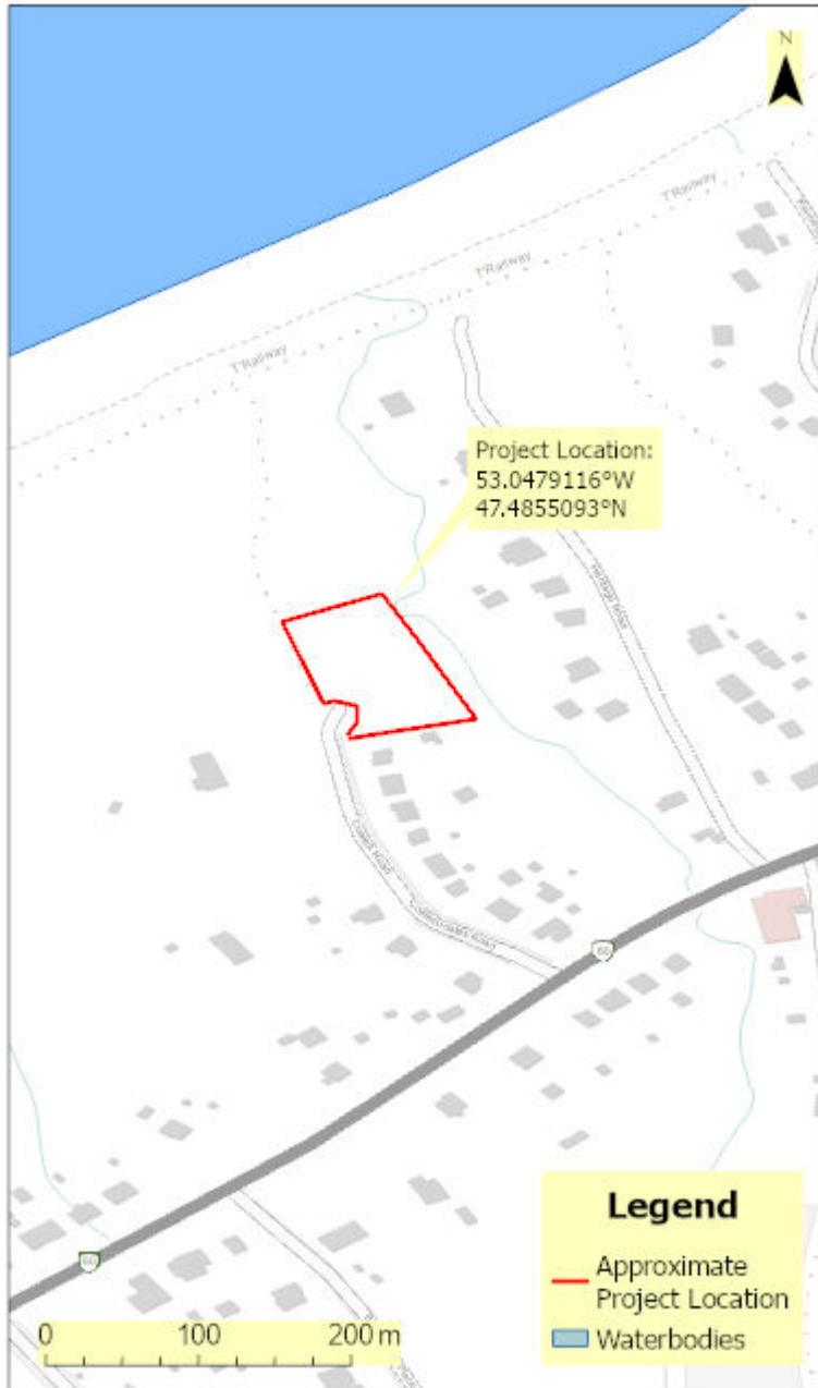
Conception Bay South (Upper Gully River) - Coates Road Extension