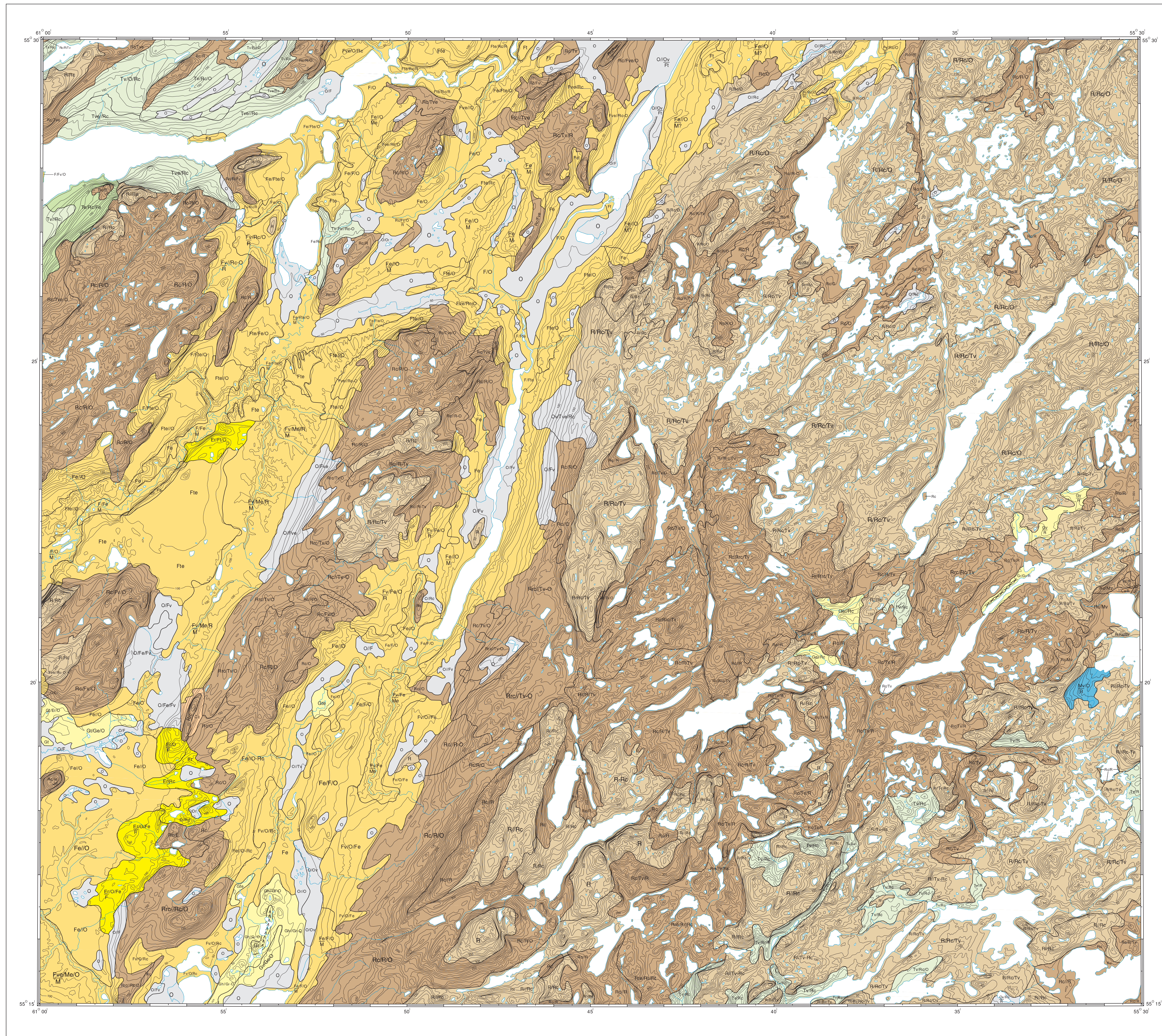
MAP 99-18 UNTITLED NEWFOUNDLAND