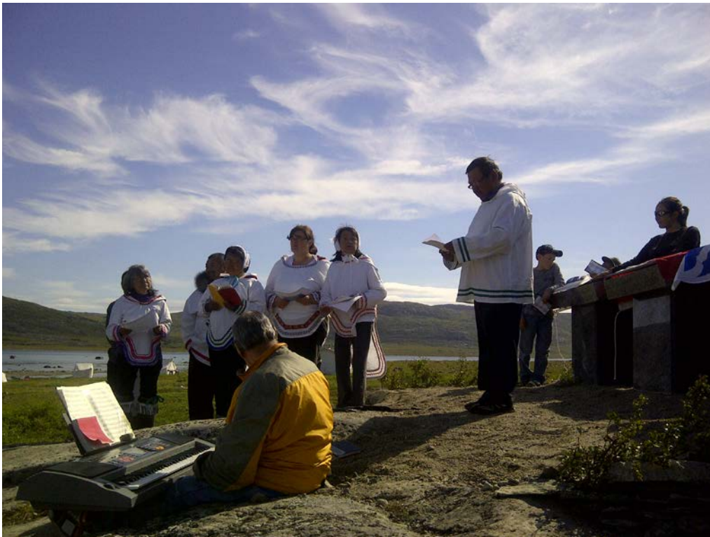
Photo: Apology Ceremony at Nutak.

SUPPORT AND COORDINATION: The Secretariat assists and co-ordinates other interdepartmental and regional initiatives. The Secretariat liaises with other Aboriginal ministries and assists in the management of intergovernmental relations on national Aboriginal issues.