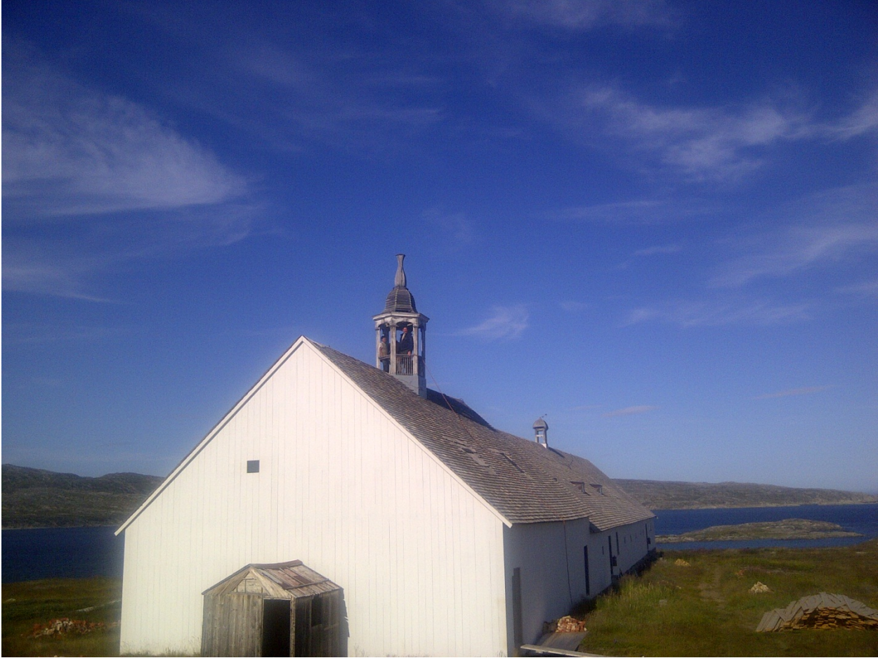
Photo: Hebron, Newfoundland and Labrador.

Nunatsiavut Government officials participated in a ceremony in Nutak commemorating the formal apology made by the Government of Newfoundland and Labrador. The monument which was unveiled consists of three plaques, each in Inuktitut and English. The first presents the statement of apology by the Provincial Government to the Inuit of Nutak and Hebron; the second displays the Inuit's acceptance of the apology; and the third identifies the names of all the former residents of Nutak. A similar monument was erected in Hebron and unveiled during a 2009 ceremony.