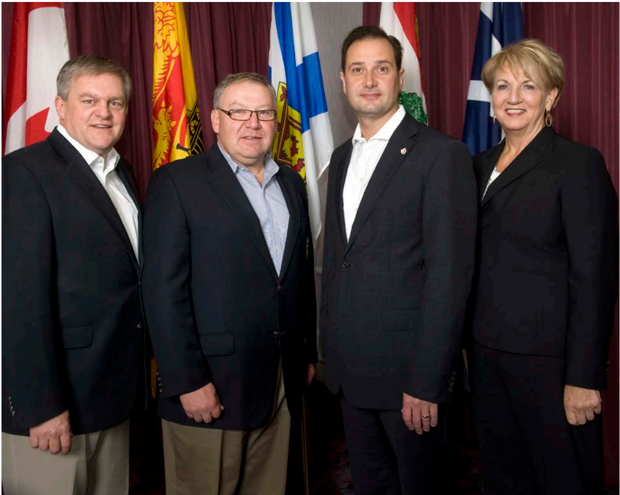
Photo: The Premier meets with her Atlantic counterparts in Brudenell, PEI on June 5-6, 2012

For more information about the Council of Atlantic Premiers, including communiqués issued following the meetings, visit the website at: www.cap-cpma.ca .