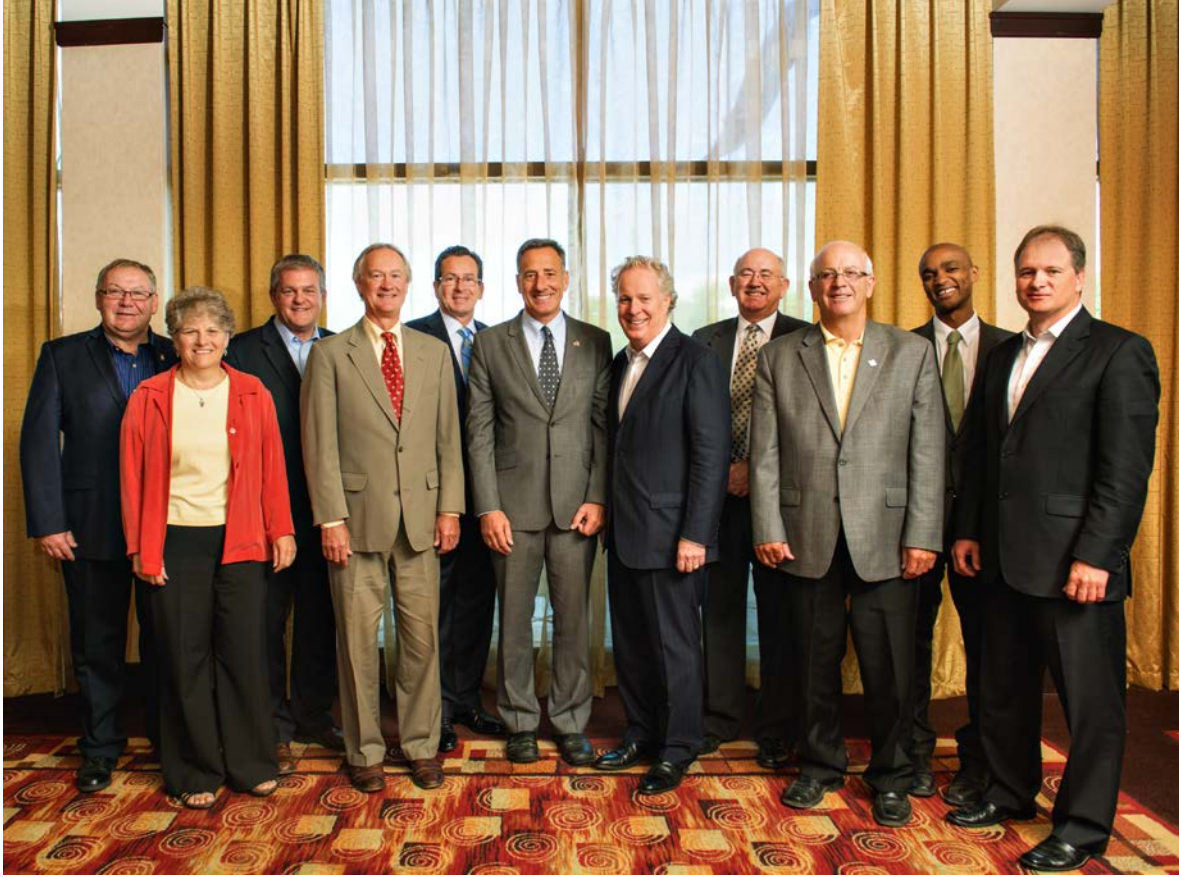
Photo: Minister Keith Hutchings represented Newfoundland and Labrador at the Conference of New England Governors and Eastern Canadian Premiers held July 29-30, 2012.