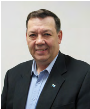
JOHN HICKEY, M.H.A. Lake Melville District Minister of Labrador Affairs