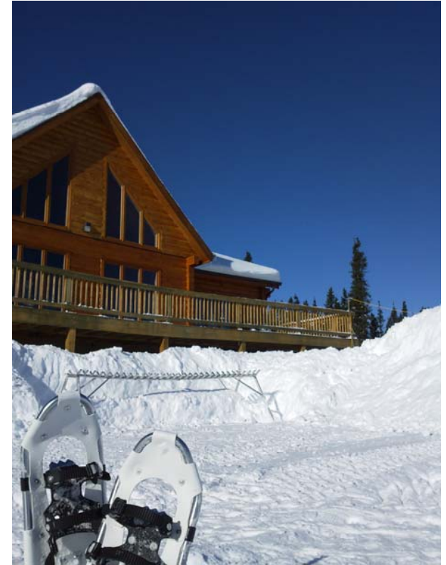
Birch Brook ski lodge

enhance the core development of the plan, as well as the social and economic growth of Labrador.