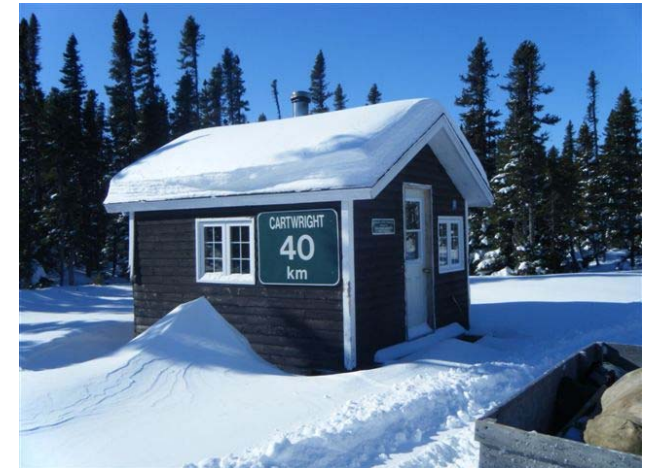
Rest station on snowmobile trail to Cartwright

2012 due to heavy ice conditions when marine service was not available. The budget for the 2011-12 fiscal year AFS was $230,000.