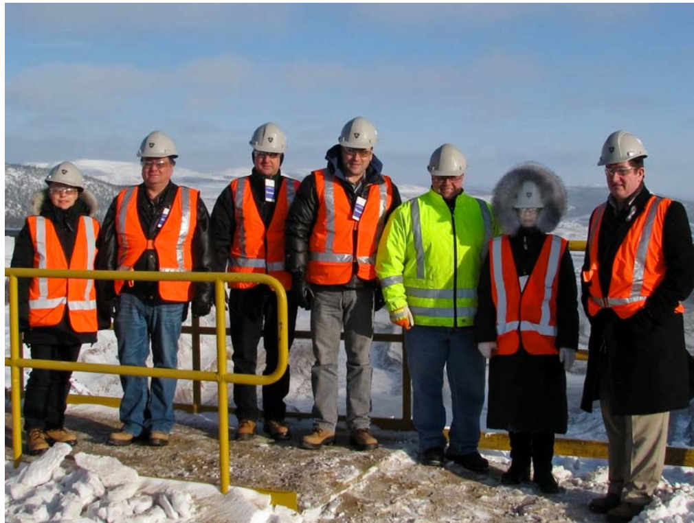
Over looking Luce Pit at Iron Company of Canada,

member of the board. The next Labrador Winter Games is scheduled for March 2013.