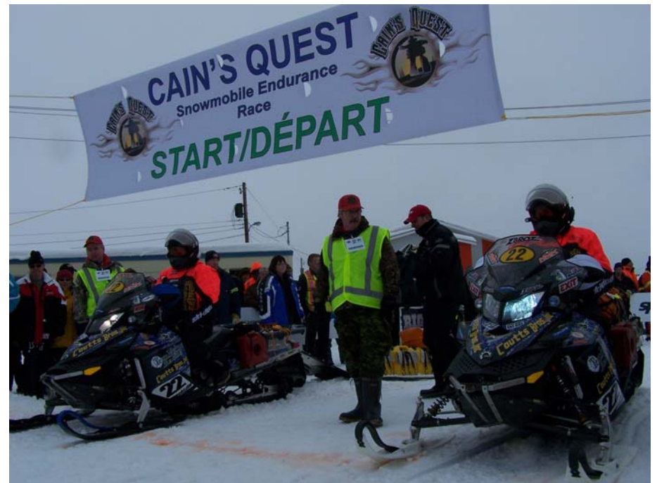
Cain's Quest Snowmobile race, Labrador City

The Labrador Affairs Office will report upon the objective and indicators in each of the next three years ending March 31, 2012, 2013 and 2014.