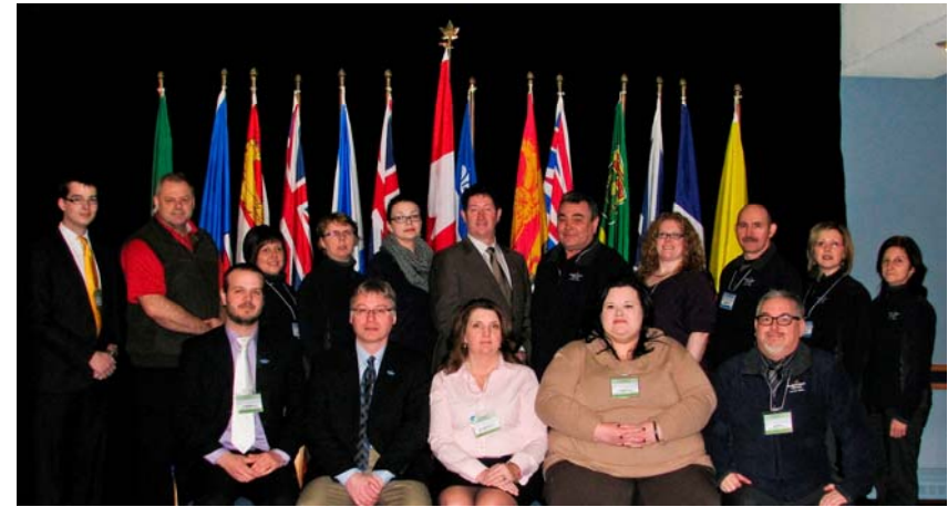
Labrador Affairs Office staff at the Northern Development Ministers' Forum

The massive economic activity in Labrador may cause a population increase over the coming years in some areas and place significant demands on existing government infrastructure, programs and services. LAO will work with all government departments/entities to ensure the impact on existing infrastructure such as hospitals, schools and roads are able to meet these demands. The Office will continue to support effective program delivery within Labrador. LAO plans to open an office in Labrador West to support social issues and economic opportunities around mining expansion.