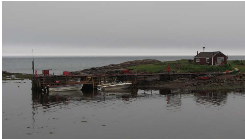
West St Modest, Labrador Straits

The Labrador Affairs Office is mandated to advance social and economic development in Labrador. This is achieved through coordination and collaboration of Labrador related initiatives. The Office collaborates with Provincial Government departments/entities, federal, Aboriginal and municipal governments and industry organizations to support advancement of economic and social development in Labrador. Often the Labrador Affairs Office takes the lead role in coordinating intergovernmental committees such as the Environmental Management Planning and Consultative Committee and the Northern Development Ministers' Forum.