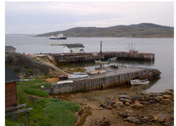
Northern Ranger entering Hopedale Harbour

the Center for Learning and Development and where appropriate other agencies to ensure effective and efficient delivery of training opportunities in Labrador. The committee assesses and identifies regional training needs and works to coordinate the development and delivery of training activities related to the identified needs.