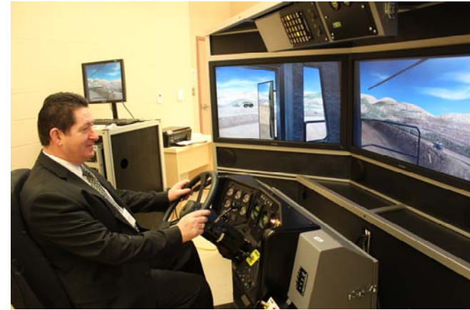
Minister Nick McGrath at the heavy equipment simulator at the College of the North Atlantic, Labrador City

Labrador Affairs Office is represented on the Newfoundland and Labrador Geographical Names Board which is led by the Department of Environment and Conservation (ENVC). Under the Geographical Names Board Act , ENVC has the authority to officially name all geographical features such as rivers, ponds, lakes, mountains and roads. Provincial, territorial and federal naming authorities have representation on the Geographical Names Board of Canada which is responsible for the establishment and the maintenance of national standards in toponomy.