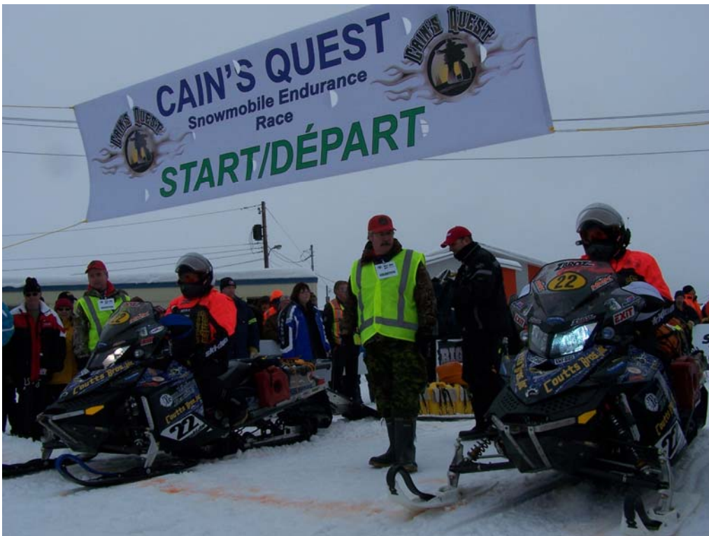
Cain's Quest Snowmobile Race, Labrador City