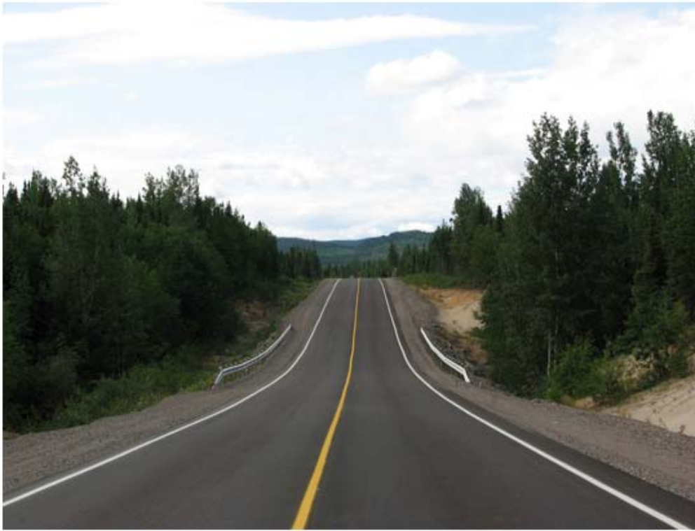
Trans Labrador Highway, Phase I