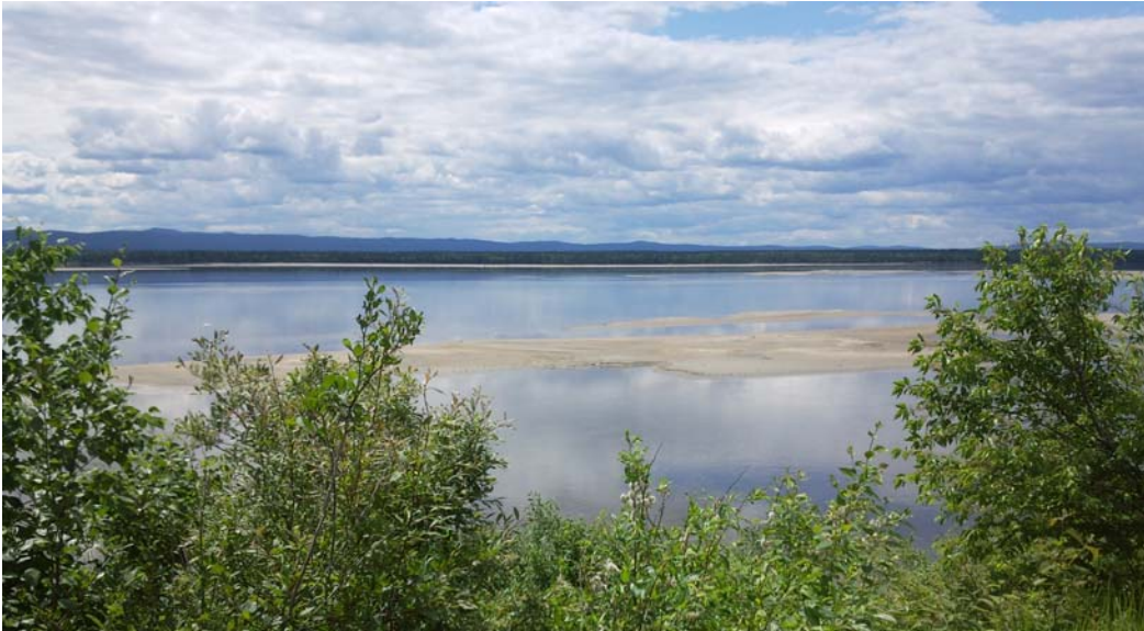
Churchill River, Happy Valley-Goose Bay, Labrador

Provincial engagement with resource development stakeholders in Labrador is crucial to unlocking the resource rich potential of Labrador.