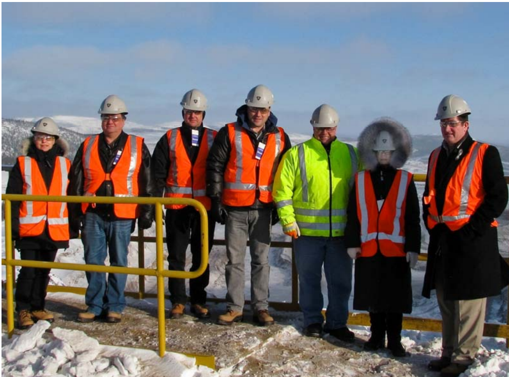
Over looking Luce Pit at Iron Company of Canada.

The Labrador Affairs Office is mandated to advance social and economic development in Labrador. This is achieved through coordination and collaboration of Labrador related initiatives. The Office collaborates with provincial government departments/entities, federal, Aboriginal and municipal governments and industry organizations to support advancement of economic and social development in Labrador. Often the Labrador Affairs Office takes the lead role in coordinating inter-governmental committees such as Environmental Management Planning and Consultative Committee and the Northern Development Ministers Forum.