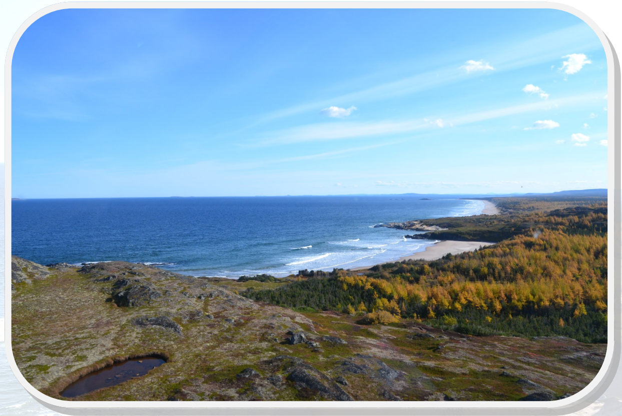
Northern tip of the Wunderstrands, Labrador

The proposed National Park Reserve in the Mealy Mountains will encompass 10,700 square kms.