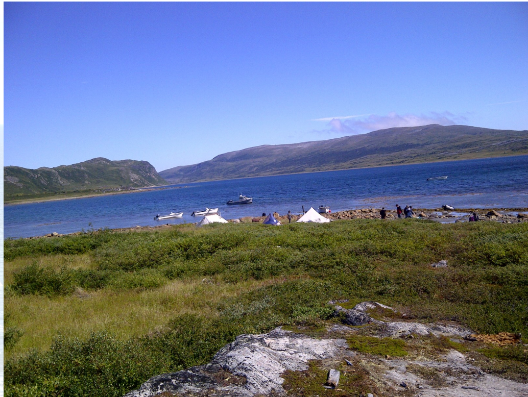
Tents outside Hebron, Labrador