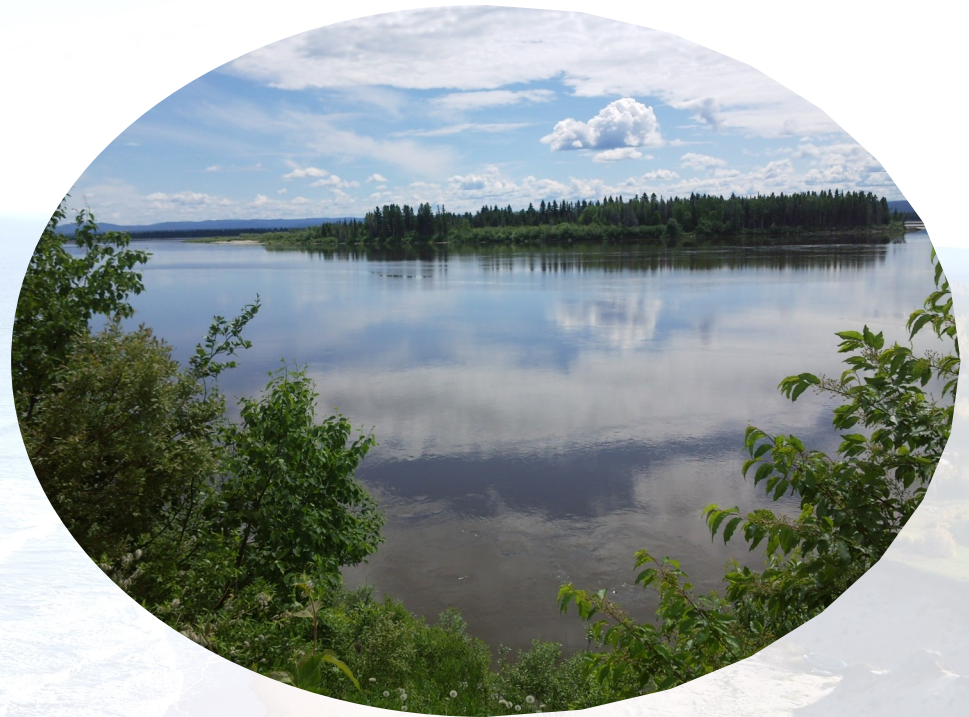
Churchill River, Labrador

This initiative supports government's strategic direction to enhance accessibility for residents of Labrador. LAO participation on the Board also ensures Provincial Government policy reflects Labrador interests.