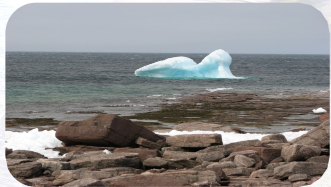
Iceberg off South Coast of Labrador

The Labrador Affairs Office is mandated to advance social and economic development in Labrador. This is achieved through coordination and collaboration on Labrador related initiatives. The office collaborates with Provincial Government departments/entities, federal, Aboriginal and municipal governments and industry organizations to support advancement of economic and social development in Labrador. Often the Labrador Affairs Office takes the lead role in coordinating intergovernmental committees such as the Environmental Management Planning and Consultative Committee and the Northern Development Ministers' Forum.