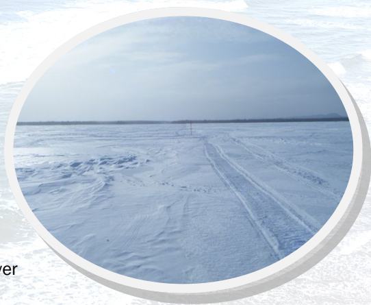
Trail Marking North West River to Mulligan

The Government of Newfoundland and Labrador continues to provide funding from the Labrador Transportation Grooming Subsidy (LTGS) to coastal communities that do not have year-round road connections to other areas of Labrador. This subsidy supports government's strategic direction to improve economic and social development in Labrador. The Provincial Government provides support to regions along the north and south coasts of Labrador for maintenance of the winter trail systems. The Inuit Community Governments of Hopedale, Postville, Makkovik, and Rigolet, as well as the Eagle River Development Association, Labrador White Bear Development Association (LWBDA), Mud Lake, Town of North West River and Grand River Snowmobile Club, received funding from this program. Weather conditions for the 2012-2013 grooming season were exceptional. Emergency shelters were placed in strategic locations on the trail between Happy Valley-Goose Bay and Rigolet and between North West River and Postville. The overall operating budget for the LTGS for the 2012-2013 grooming season increased to $351,000.