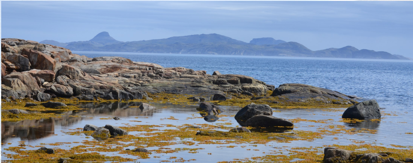
Coastline in the Torngat Mountains National Park

The Labrador Affairs Office will report upon the objective and indicators for the 2012-2013 fiscal year.