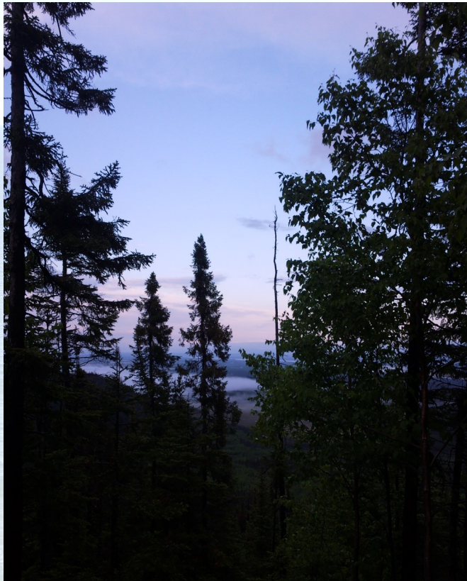
View from Pine Tree, Lake Melville

The Institute offers scientifically supported recommendations to the federal ministers of Environment and National Defence on policy issues relating to the impacts of low-level flying.