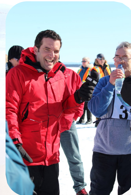
Rick Mercer at the 2013 Labrador Winter Games

The Labrador Winter Games provides an opportunity for Labradorians to come together to celebrate Labrador sports and culture. More than 400 participants from 25 communities throughout Labrador compete in contemporary sport and traditional skill competition such as dog sledding and snowshoeing. The 30 anniversary Labrador Winter Games took place from March 3 to 9, 2013 The Provincial Government provided $500,000 to support the 2010 Labrador Winter Games. A Labrador Winter Games Board of Directors is responsible for overseeing and managing operations of all aspects of the games. LAO is a member of the Board.