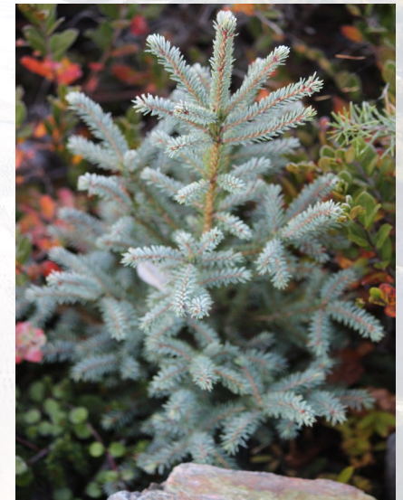
Blue Spruce near Port Hope Simpson

On January 28, 2013, due to continued decline of the George River caribou herd, the Provincial Government initiated an immediate ban on all caribou hunting in Labrador for conservation purposes for a period of five years, with a review after two years. Recent census results, as well as biological information gathered and ongoing population modeling, indicate the herd currently stands at less than 20,000 caribou, representing a decline of more than 70 per cent since the July 2010 estimate of 74,000. The Provincial Government will continue to monitor the George River caribou herd, assess the population on an annual basis, and continue to work closely with Aboriginal groups while it proceeds with protecting this herd. LAO supported the efforts of the Department of Environment and Conservation (ENVC) through government's consultative process and through participation at stakeholder meetings. ENVC established a Provincial George River Caribou Herd Advisory Committee which is responsible for promoting conservation of the herd and providing management recommendations to the Minister of Environment and Conservation. LAO's participation on this Committee supports the strategic direction of Government to improve social development in Labrador, enhance accessibility for residents of Labrador and to ensure Provincial Government policy reflects Labrador interests.