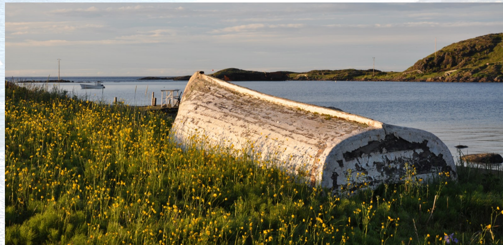
Red Bay, Labrador