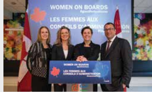
Minister Leitch as she released the federal Advisory Council for women on boards report. June 2014

In June 2014, the Honourable Dr. K. Kellie Leitch, Minister of Labour and Minister of Status of Women, released the Advisory Council's report Good for Business on ways to increase the representation of women on public and private boards.