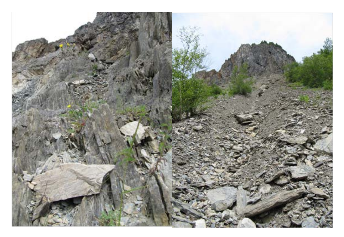
Figure 2: Cutleaf Fleabane in habitat near Breakfast Head, 2013 (credit: Aare Voitk)

Figure 3: Cutleaf Fleabane habitat near Breakfast Head, 2013 (credit: Aare Voitk)