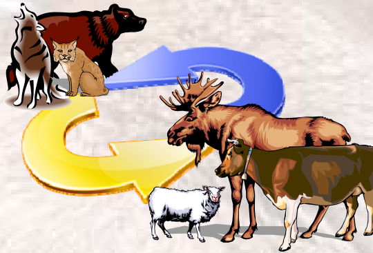
Figure 1: Predator – Prey Life Cycle.

The cyst can be found in the muscles and heart of moose and occasionally in the caribou. It was not very common on the Island of Newfoundland until the early 1980's. First reports appeared on the southwest coast, then progressed to the east.