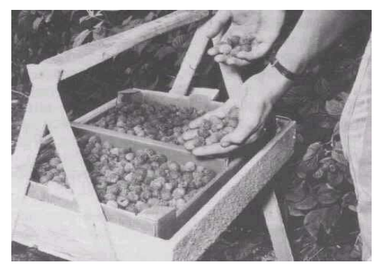
Fig. 3 - A convenient picking tray for raspberries that can be constructed to support 12 pint containers.