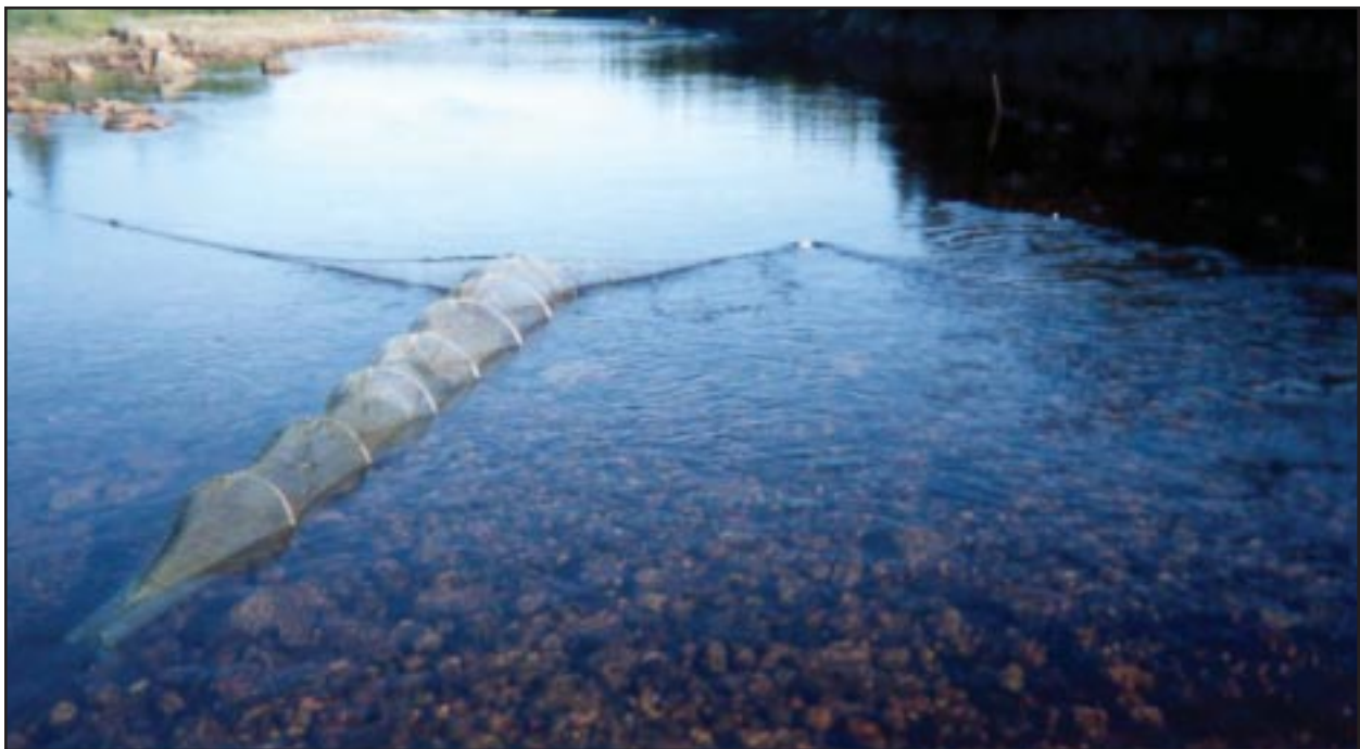
Setting eel fyke net