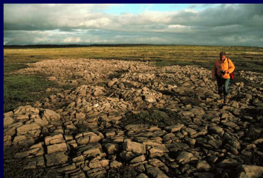
Watts Point Ecological Reserve