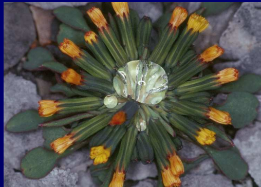
Burnt Cape Ecological Reserve