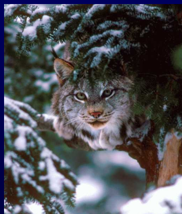
Little Grand Lake Ecological Reserve