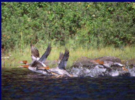
King George IV Ecological Reserve