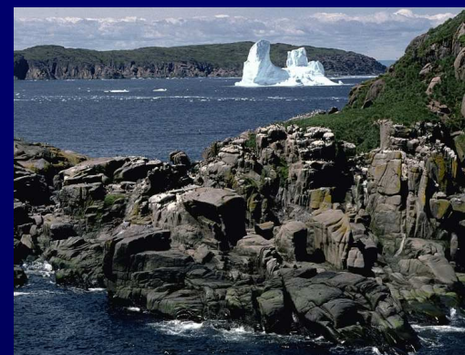
Gannet Island Ecological Reserve