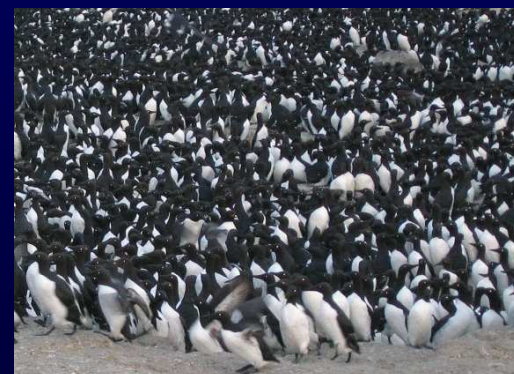
Funk Island Ecological Reserve