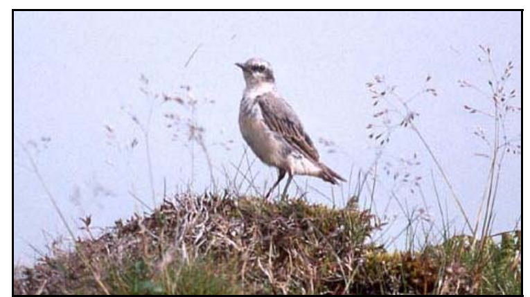
Juvenile Northern Wheatear, Cape Pine, August 9, 2001