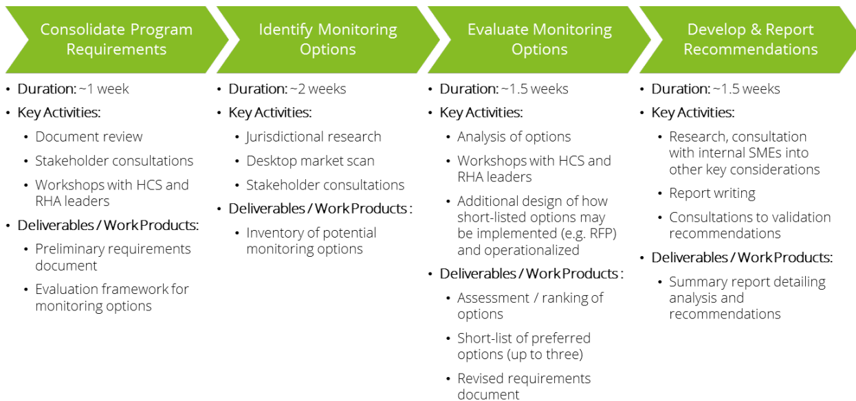
Figure 1: Project Approach

Per Figure 1 below, research and analysis activities were completed over approximately 6-weeks and were complemented with stakeholder consultations 2 and workshops with the Steering Committee. Additionally, working recommendations were presented to the PHSP Advisory Committee for input and validation.