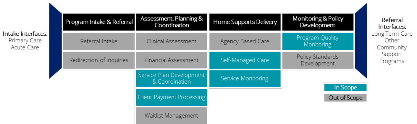
Figure 2: PHSP Process Framework & Scope of SMC Oversight & Monitoring

Understanding the current state of oversight and program delivery is essential for determining the gaps to be addressed in a future model, and Figure 2 below defines the process relevant to SMC within the wider PHSP.