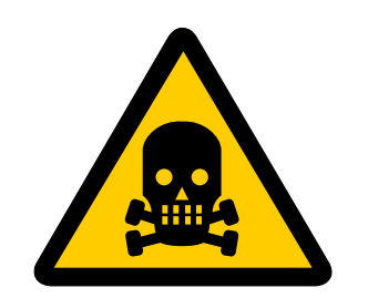
Cleaning Your Cabin

Note: If you decide to use rodent poisons, follow the manufacturer's instructions carefully. Do not place poisons where children or pets can get at them. Do not place poisons near food, clothing or bedding.