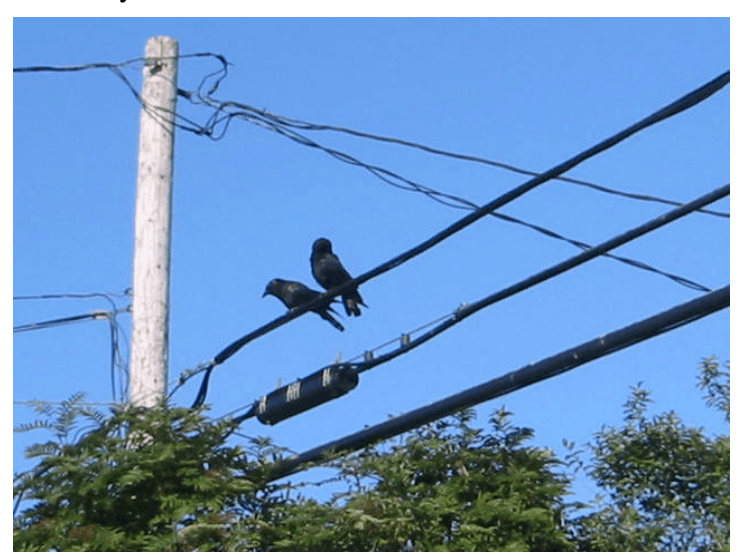
Figure 2: Two crows on a common perch

Hundreds of different bird species have been found with this virus however the most important for surveillance is the common crow (Figure 2). This bird, and other members of the crow family (such as the raven, blue jay and gray jay) get sick very quickly and may die in large numbers in affected areas. The signs of illness include convulsions, tremors, head tilt, wing droop, paralysis, loss of balance and circling. General signs such as weakness and lying on the chest may be seen as well.