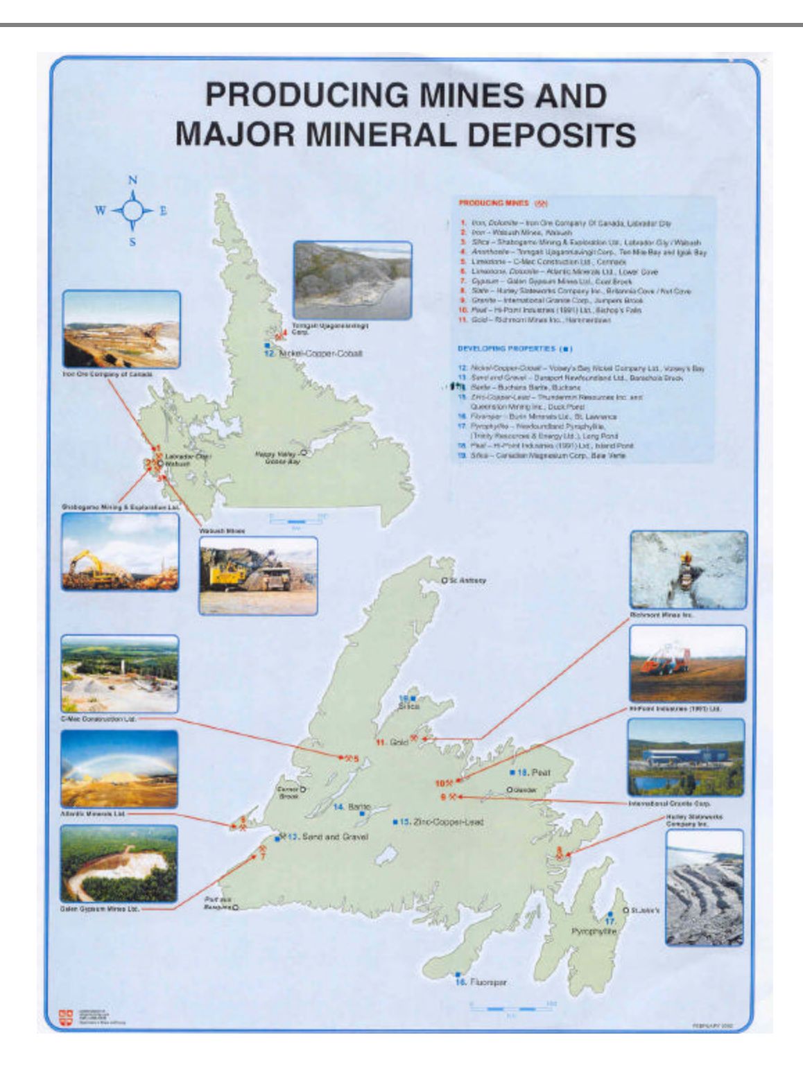
FIGURE 1: Map showing the location of the T.U.C. Ten Mile Bay and Igiak Bay anorthosite quarries near Nain, Labrador, the International Granite Corp. gabbro quarries at Jumpers Brook, central NL and the Hurley Slateworks Co. Ltd. quarry in eastern NL.