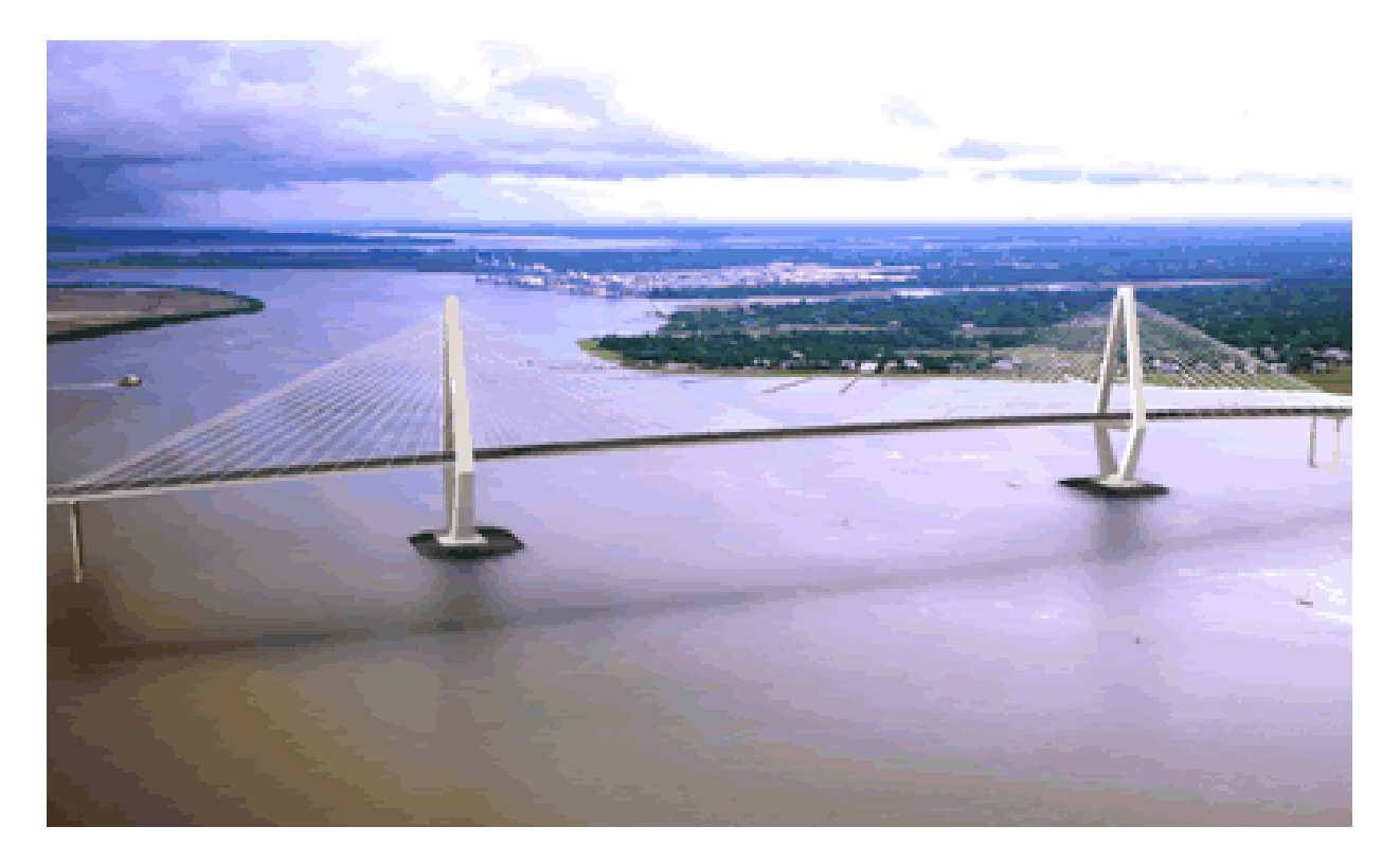
PLATE 1: The Cooper River Project in Charleston, South Carolina, USA showing the two rock islands composed of armour stone supplied by Atlantic Minerals Inc . which are designed to protect the bridge support towers.