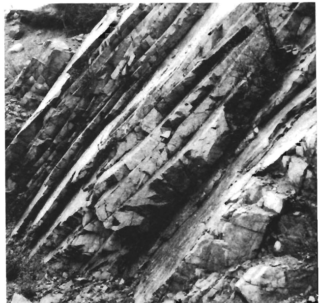
Plate 3. Sheet jointing in granite of the Swift Current Granite near Swift Current.