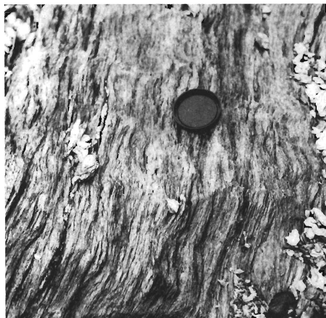
Plate 5. Schistosity showing cleavages in mica schist near Trans-Canada Highway in Whitbourne area.

Rock types in any given area that are being considered