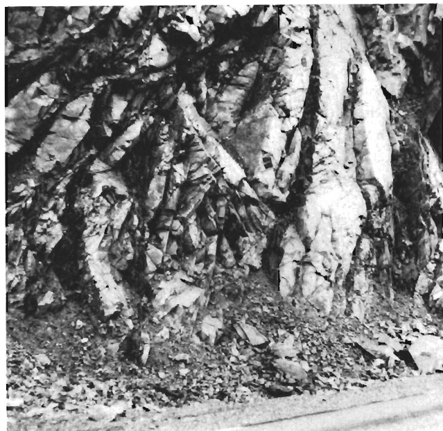
Plate 4. Mafic dykes (dark colour) in granite near Swift Current.

crushing and during the blending of the crushed stone with cement or asphalt binders: