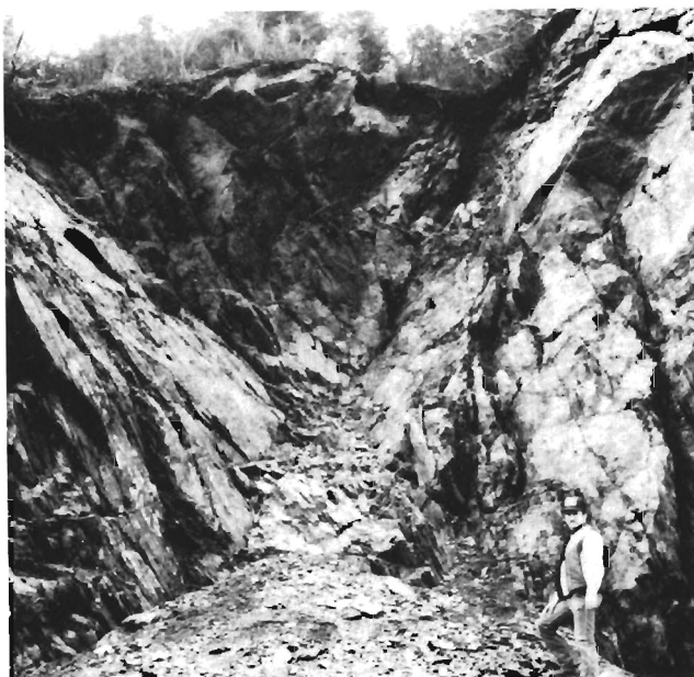
Plate 1. Faulting in green and red shales in the Conception Group near Bay Roberts.