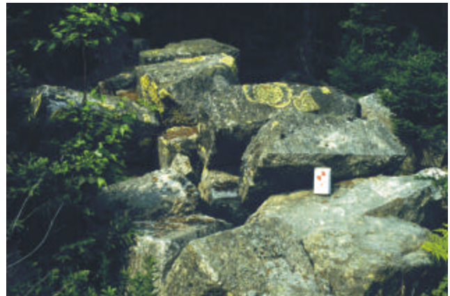
Plate 8. Abandoned granite blocks at the former Benton granite quarry. The notebook is 17.5 cm long.

Wreck Cove, Great Bay de l'Eau, on the hillside about 300 to 400 m northeast of Old Bay. The quarry is located in NTS map area 1M/12, in the vicinity of UTM coordinates 607000E 5270750N, NAD 27. The ground is open for staking. The quarry is obscured by forest and could not be located. The granite forms part of the Old Woman's Stock (O'Brien, 1998), a red to pink, high-level, miarolitic, biotite granite of Devonian age. This quarry was abandoned in the 1914 having produced a reported 1200 tons of blocks for export to Nova Scotia (Martin, 1983).