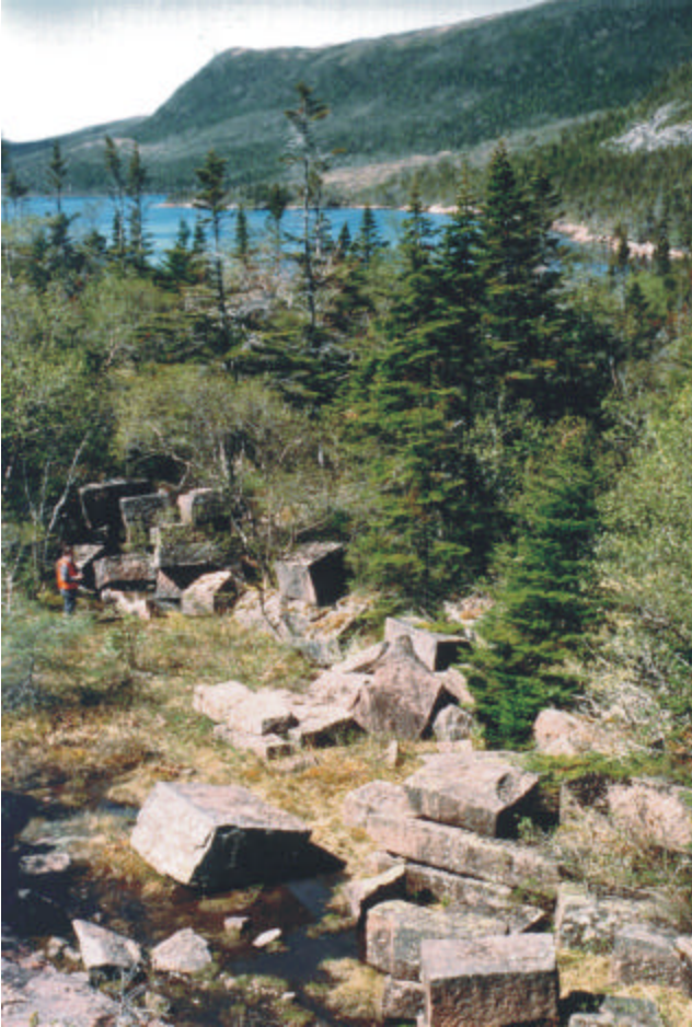
Plate 9. Abandoned granite blocks at the former Old Bay granite quarry. The blocks are about 30 to 60 cm thick.

potential for production of large blocks at this site. It is located about 4 km from a highway but there is little other infrastructure in the area. A few blocks of granite from the quarry were used to construct the John Guy monument in Cupids around 1914. The granite in the monument is a dark-pink to reddish, medium- to coarse-grained, massive, uniform, equigranular, biotite granite containing a few miarolitic cavities. The polished rock in the monument shows very little if any deterioration in the nearly 90 years since it was erected.