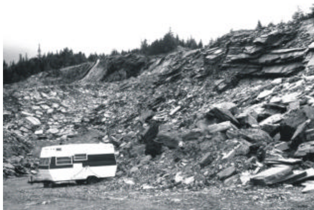
Plate 5. Carew Services' Twillick Brook flagstone quarry, north of Milltown, Bay d'Espoir.