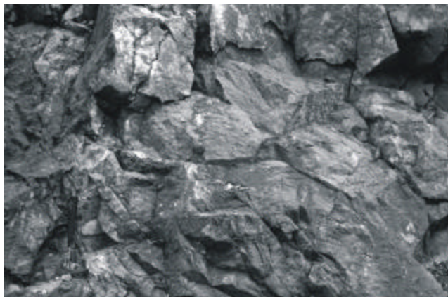
Plate 11. Highly fractured limestone at the Cobbs Arm Quarry, New World Island. The rectangular block at the top of the photo is 35 cm on a side.

quarried limestone was used in the paper-making process at Grand Falls. A vast amount of limestone has been removed from the site and only about 10 m of limestone remain on the quarry face before the overlying shales are encountered. The limestone in the quarry is pale-grey, recrystallized, thick-bedded and locally cut by thin calcite veins. Fracturing is intense and only small blocks usually much less than 1 m long can be obtained (Plate 11). This is possibly due in part to blasting. There are few partings along the bedding planes. There is no potential for block production but small building blocks less than 50 by 40 by 30 cm could be made by hand or by a saw. The ground is open for staking.