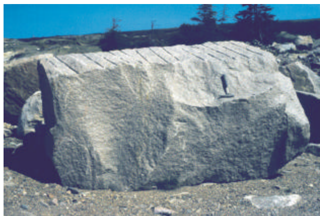
Plate 6. Quarried granite block in Eugene Kenney's quarry, north of Goobies. Hammer on block is 32 cm long.

A dormant granite quarry is located about 8 km north of Goobies adjacent to the abandoned rail line (NTS map area 2C/4, at UTM coordinates 276675E 5321775N, NAD27). The quarry site was probably originally developed during construction of the Newfoundland railway in the 1890s and is today held under Mining Lease 162 by Eugene Kenney.