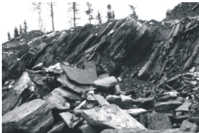
Plate 3. Quarry face at J. Tuach's flagstone quarry, Fisher Hills, near Pynn's Brook. The slabs in the foreground are about 75 cm long.