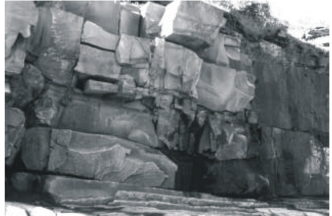
Plate 10. Jointed sandstone at the abandoned Kellys Island quarry. The lower block is about 40 cm thick.

The abandoned sandstone quarry on Kellys Island, Conception Bay, is located near the northeast corner of the island and is probably the current cliff face. The cliff face is located in NTS map area 1N/10 and the UTM coordinates are 348940E 5267980N, NAD27. King (1988) has assigned