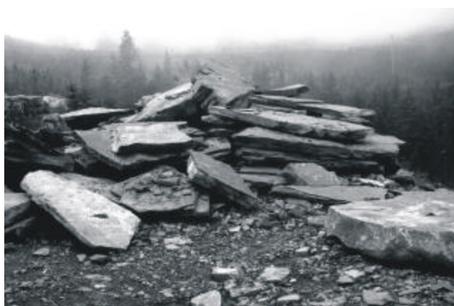
Plate 4. Stacked oversize slabs at Carew Services' quarry, Fisher Hills, near Pynn's Brook. The slabs are up to 1.5 m long.

pelite and siltstone associated with minor, thickly bedded sandstone. The flagstone is a dark- to light-grey slate and medium-bedded sandstone containing selvages of slate. Cleavage is subparallel to bedding, which results in large slabs, commonly from 10 to 30 cm thick (Plate 5).