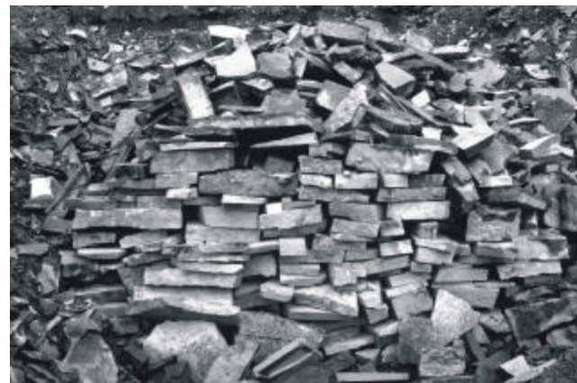
Plate 1. Stacked and sorted blocks of sandstone at Hunt's quarry, Bell Island. The blocks are about 25 cm long.

The Bay d'Espoir flagstone quarry operated by Carew Services Ltd., is located north of Milltown, Bay d'Espoir, NTS map area 2D/4, at UTM location 605000E 5320500N, NAD 27, in a former road aggregate quarry, about 100 m west of Route 360. The rocks are part of the St. Josephs Cove Formation of the Baie d'Espoir Group of Colman-Sadd (1979) who describes the bedrock as thinly bedded