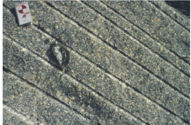
Plate 7. Drilled-off block of granite at BBK Quarry Limited's granite quarry, north of Middle Brook. The notebook is 17.5 cm long.

The Old Bay granite quarry in southern Newfoundland, is located about 5 km west of Route 362 and 10 km north of