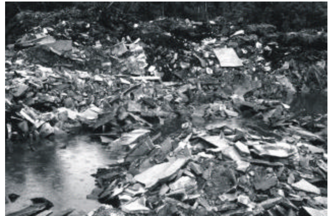
Plate 2. Ripped-up slabs of sandstone at Hammond's quarry, Bell Island. The slabs are up to 60 cm long.