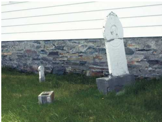
Plate 6c. Foundation wall of Brigus United Church constructed from local sandstone blocks.