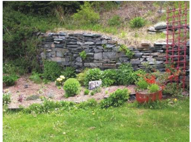
Plate 6b. Stone wall behind the Stone Barn constructed from local sandstone blocks.

churches are wooden structures but their foundations are made from local, cleaved sandstone that outcrops near the churches. The stone at St. George's Anglican Church has been painted but at Brigus United Church the original stone may be observed (Plate 6c). It is assumed that both churches used similar stone.