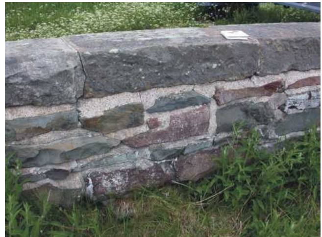
Plate 3. Outside face of the rampart at the Queen's Battery, Signal Hill, St. John's showing the local stone used to construct the wall.

Originally constructed in 1796, the Queen's Battery (Figure 1, Plate 3) was used as a defensive point to protect