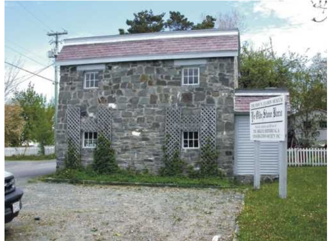
Plate 6a. The Stone Barn, Brigus, constructed from Kellys Island sandstone, and the Britannia Cove red slate roof.

St. George's Anglican Church and Brigus United Church were built in 1876 and 1875 respectively. Both