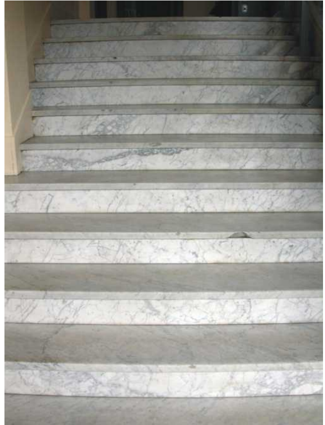
Plate 2. Marble staircase inside the Corner Brook Museum.

Constructed in 1926, the Corner Brook Museum building (Figure 1, Plate 2) was originally the Corner Brook Public Building and used as a police station, courthouse, telegraph office and jail. After renovations to the original concrete building were completed in 1997 it became the home of the Corner Brook Museum and Archives. The major stone feature found within the museum is a marble staircase that extends from the basement, where the jail cells were located, to the courthouse located on the third floor (Plate 2). The steps are constructed from a white, streaky marble breccia and is possibly a variety of the world famous Italian Carrara Marble.