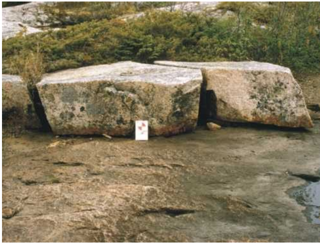
Plate 4d. Blocks of equigranular Holyrood Granite found in Quarry Brook, near Holyrood. Notebook is 17 cm high.