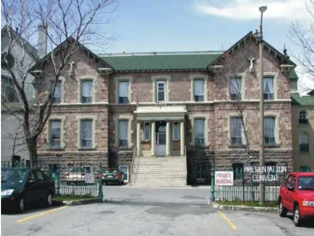
Plate 4a. Front of Presentation Convent, Convent Square, St. John's.