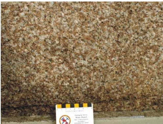
Plate 4c. Equigranular granite used in the upper floor walls of Presentation Convent.

St. John's harbour. The outside of the ramparts, facing the Narrows, is constructed of local red and green sandstone from the Gibbett Hill and Quidi Vidi formations of the Signal Hill Group (King, 1990). The blocks are roughly shaped. The cap rock and interior wall (facing the barracks) is composed of blocks of medium-grained, uniform, light grey to buff sandstone having bevelled edges and a crenulated inside vertical face. This sandstone is not available locally and must have been imported. The age of the current wall is not known and it is possible that the imported sandstone was recycled from another building or structure well after 1796. The adjacent renovated barracks is also constructed from stone available from the Signal Hill area but new imported green sandstone (possibly Wallace Sandstone from Nova Scotia) was used for the window sills.