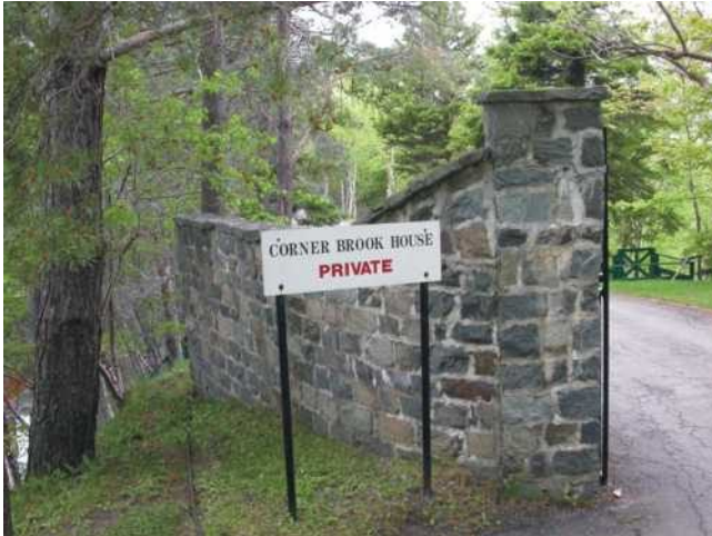
Plate 1. Stone wall and gate post at the entrance to Corner Brook House.

lines (Symonds, 2001). Armstrong never used the house and it became the residence of the General Manager of the Newfoundland Power and Paper Co. pulp and paper mill. Corner Brook House is a wood and brick structure built in the Tudor Revival style (Symonds, 2001), and displays little use of stone. However, the walls and gate posts at the entrance to the house (Plate 1), as well as the stone walls along West and Main streets in Corner Brook, were built during the late 1920s to early 1930s. The variety of rock types used in the walls at the entrance to Corner Brook House suggests that several sources were used. However, one strong possibility is that they are mainly glacial erratics that were collected locally and shaped into blocks for use in the wall. The walls along West and Main streets are constructed from grey marble that could have been obtained from an area along the Trans-Canada Highway or along the southwestern area of the Humber Gorge where Knight (1995) has described a variety of grey limestones (that have been variably altered to marble) from the St. George and Table Head groups.