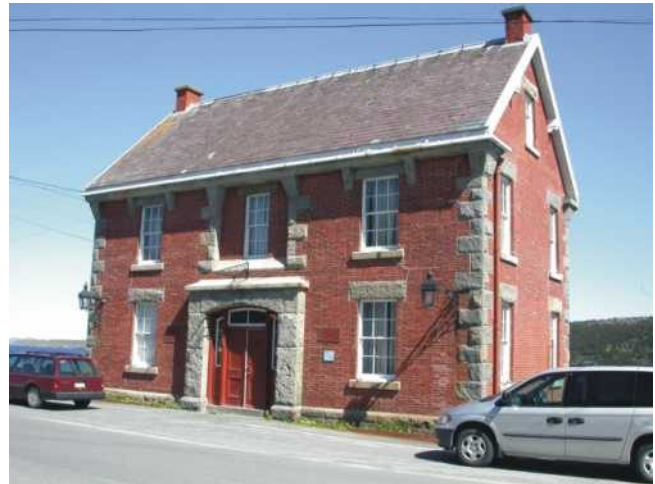
Plate 5. Conception Bay Museum, Harbour Grace showing the use of Topsails Granite for the quoins, doorway, lintels, sills and dentils, the red slate roof and red brick facing.

The material used for the stone steps in front of the Convent is almost certainly an Irish granite, possibly “Dublin Granite”. The granite is a coarse-grained, equigranular, hornblende granodiorite (Plate 4e). The granite used for the stone steps is virtually identical to the granite used for the bases of the Italian Carrara marble statues in front of the Basilica and also that used as a facing stone for the disused Diocesan offices, located between St. Bonaventure’s College and the Basilica Museum. The length of the steps (over 3 m) is similar to that seen in the Diocesan building where several granite ashlar of this length can be observed near ground level.