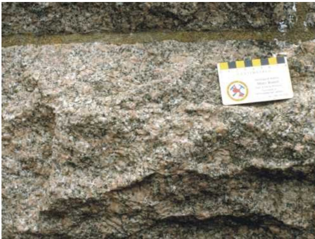
Plate 4b. Porphyritic granite used in the basement-level wall of Presentation Convent.