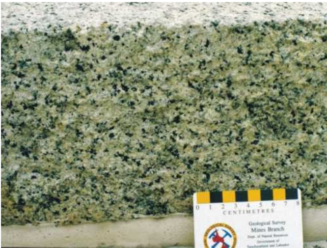
Plate 4e. Equigranular hornblende-biotite granodiorite, similar to “Dublin Granite”, used for the front steps of Presentation Convent.

tresses in the CBS-Holyrood area have abutments constructed of Holyrood Granite.