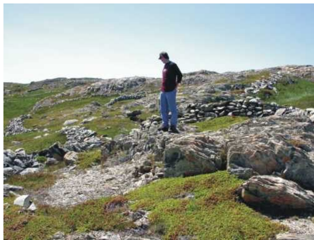
Plate 7. Remnants of the historic stone walls at Grates Cove constructed from local siltstone.

The rock walls at Corner Brook indicate that locally occurring limestone and marble is suitable for wall construction and is a long-lasting material. The blocks of sandstone used in the Brigus area are also a good building material. This type of rock has been used for centuries in Newfoundland to construct the foundations of many buildings.