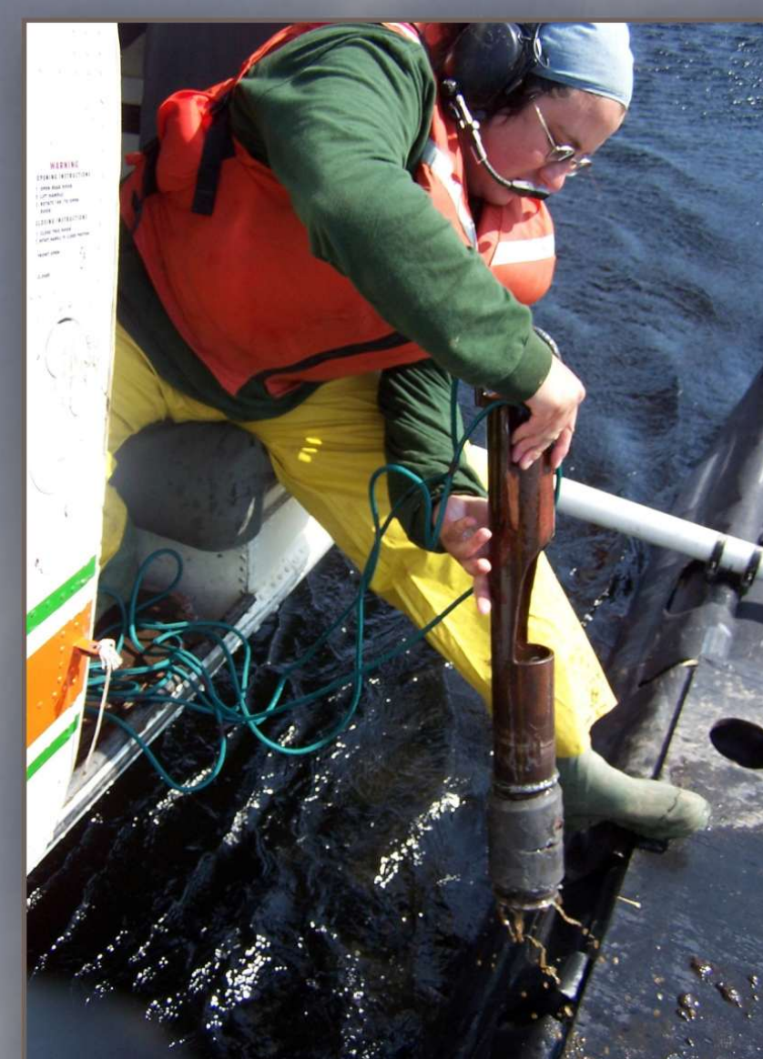
Lake sediment sampling

The Geological Survey of Newfoundland and Labrador provides support for mineral exploration through an extensive program of field work and analysis of surficial sediments. The geochemistry database currently available is unparalleled in Canada for its comprehensive coverage, and provides one of the best resources of its kind in North America.