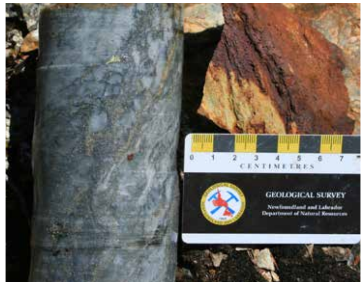
Core sample containing base-metal mineralization obtained from the Handcamp prospect.

Safety in the field is a prime concern of the Geological Survey, and every effort is made to eliminate accidents through training and awareness initiatives. The Geological Survey was once again recognized for its safety record by the AMEBC – PDAC "Safe Day Everyday" Award in 2017.