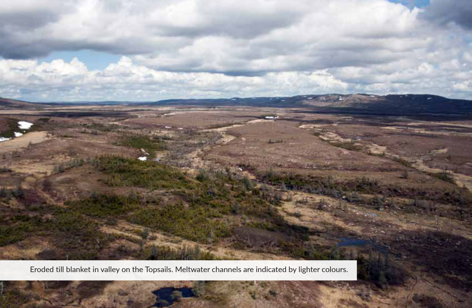
Eroded till blanket in valley on the Topsails. Meltwater channels are indicated by lighter colours.

sampling at the property was to take advantage of the exposed trenches, before their backfilling at the end of the 2018 field season. A report on the initial findings of the 2018 survey will be published in Current Research 2019-1.