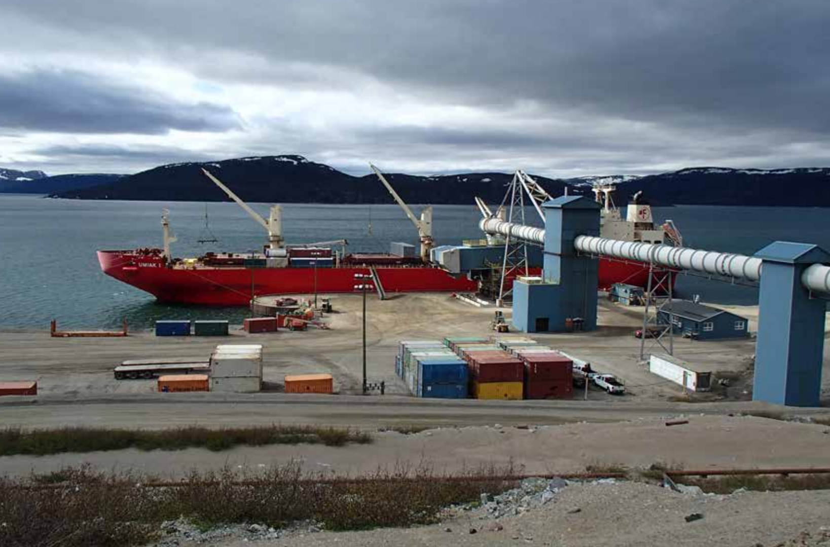
Vale Newfoundland and Labrador, Ship Loading at Voisey's Bay.