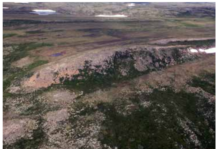
Streamlined bedrock landform northwest of Pants Lake. Landform tapers to the east-northeast, indicating ice-flow direction.