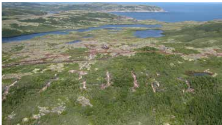
Trenching and Drilling, St. Lewis, southern Labrador.

All exploration work requires approval from the department. This involves a referral process whereby relevant government and non-government agencies are notified of work intent and scope, and are given the opportunity to provide feedback. Standard conditions and those derived from the referral process are included in the approval document.