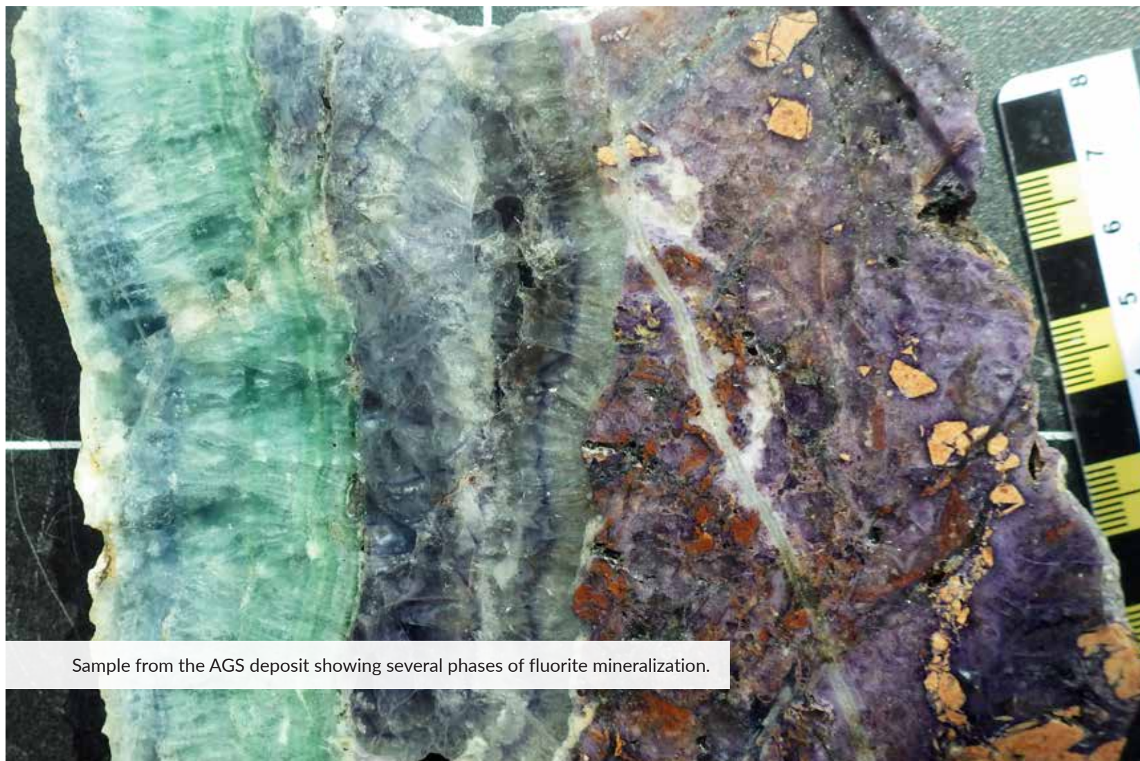
Sample from the AGS deposit showing several phases of fluorite mineralization.

She also conducted fieldwork in the Snowshoe Pond area to determine the source of high fluorine anomalies in till samples recently collected by Jennifer Organ and Heather Campbell (GSNL). Pegmatite dykes were located at some of the sites. Pegmatites are a very likely source of the anomalies because they are commonly very high in F. They may also carry economically significant amounts of rare earth elements (REE). Samples of pegmatites and surrounding granitic rocks were collected for geochemistry and petrographic analysis. Findings of this study will be published as they become available.