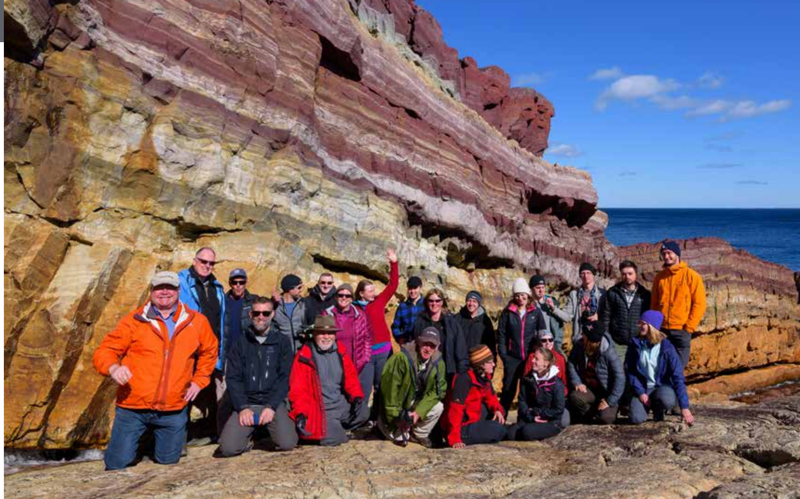
Participants of the GAC NL Fall Field Trip to Bonavista in September of 2017.

The rocks consist of older, granulite-facies metasedimentary and tonalitic gneisses and subordinate gabbro to pyroxenite cumulate sills and oxide facies iron formation lenses. These units predate extensive migmatitic diatexite, variably deformed granite, syenite and tonalite plutons and granite pegmatite. The region has the potential for hosting gold, base metal, platinum group elements and radioactive mineralization in several different rock types. Numerous gossan zones containing bornite \pm pyrrhotite \pm arsenopyrite \pm chalcopyrite mineralization, some with elevated Au, Ag, Cu, Pb, Ni and Cr occur within migmatitic gneiss, foliated granitoid rocks, diatexite, mafic to ultramafic intrusions and iron formation. Current exploration efforts by Labrador Gold Corporation have outlined two district-scale gold anomalies associated with magnetic highs in the region. In addition to gold and base-metal potential in these rocks, late-stage pegmatite intrusions and granite plutons have local anomalous Th, U, REE, Mo and W contents. Limited exploratory work has been conducted in the Ashuanipi Complex of Labrador