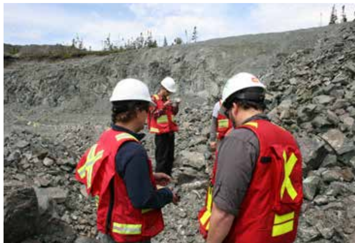
Geologists at Point Rousse.

Financial assurance sufficient to cover full-site rehabilitation is required from operators and is administered by the section.