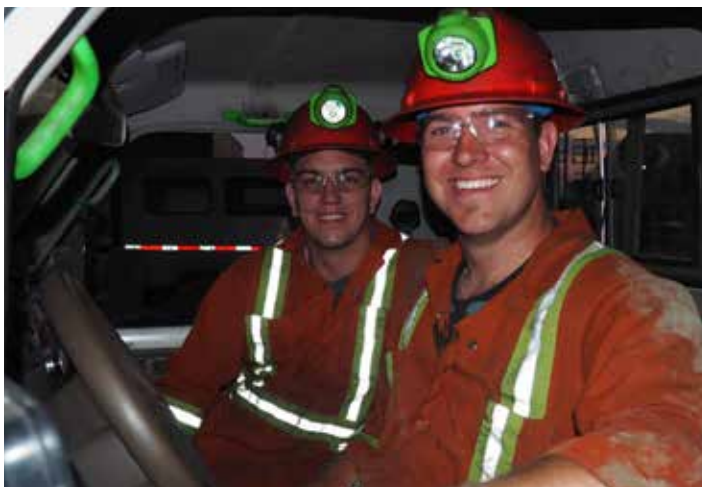
Rambler Employees.

Since Mineral Resources Review last year, 10 development plans or amendments, 13 rehabilitation and closure plans or amendments, 7 financial assurance proposals and 6 mill licence applications have been submitted to the section for review. The section represented the department on environmental assessment committees for Search Minerals' Foxtrot project; Rambler Metals and Mining Canada's tailings expansion project; Anaconda Mining's Argyle project and Matador Mining's Cape Ray project. The Mining Act also requires mine operators