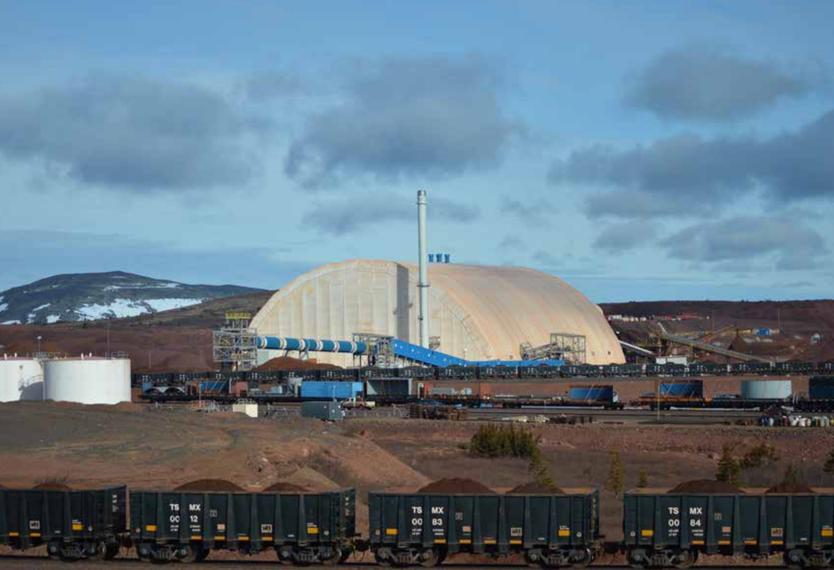
Tata Dome with train.

communication, data gaps and discrepancies are resolved to maximize statistical integrity.