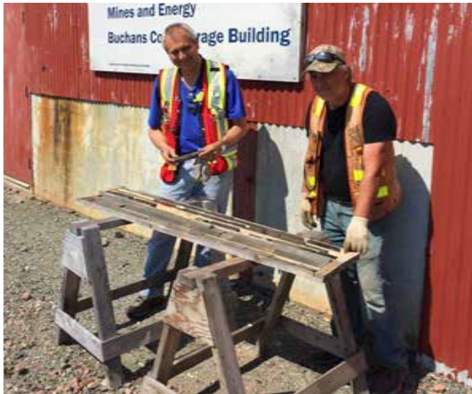
Buchans Resources Limited Personnel Inspecting Drill Core at the core storage facility in Buchans, 2018

Memorial University. The core-storage area houses approximately 1.5 million metres of drillcore samples from nearly ten thousand drill holes collected from various exploration projects within the province. Samples are available for inspection and are used extensively by the mineral exploration industry, government, and academia. Sampling of core is permitted where sufficient core is available to allow removal of some material and with the conditions that all unused material is returned to the core library along with copies of analytical results. The core-storage database is available online via the Geoscience Atlas.