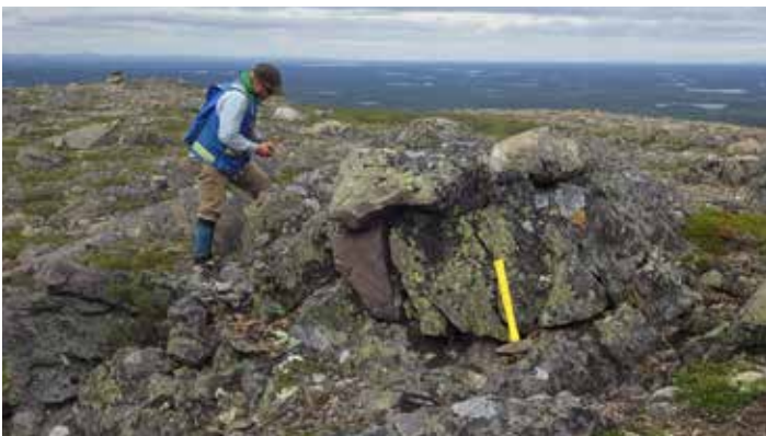
Student assistant Benjamin MacDougall collecting a sample in western Labrador.

Tim van Nostrand is continuing compilation of 1:50 000-scale bedrock mapping of the northern Archean Ashuanipi Complex in western Labrador, including all or parts of NTS map areas 23J/02, 03, 04, 05, 06, 07, 10, 11, 14 and 23O/03.