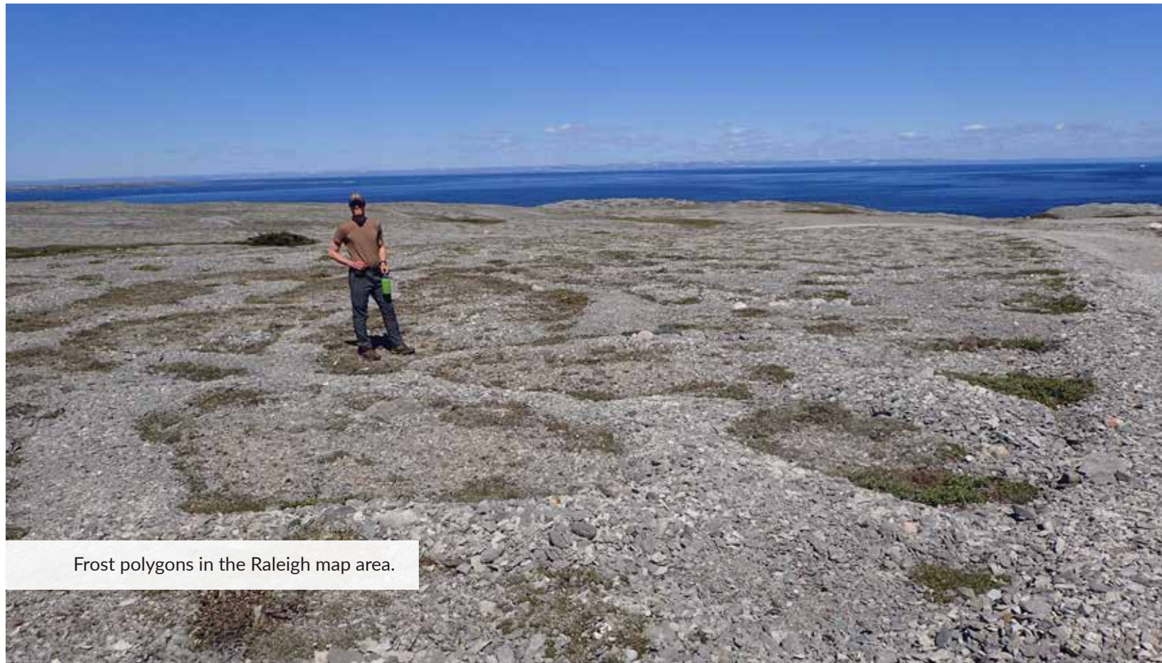
Frost polygons in the Raleigh map area.

has potential for Pb-Zn mineralization and has seen increased exploration activity, with more than 2000 claims staked since the beginning of 2017. Detailed till sampling and striae mapping were also completed in exposed trenches in the North and South zones of Altius Minerals' Sail Pond property, in the St. Julien's map area (NTS 02M/04). The main objective of the mapping and