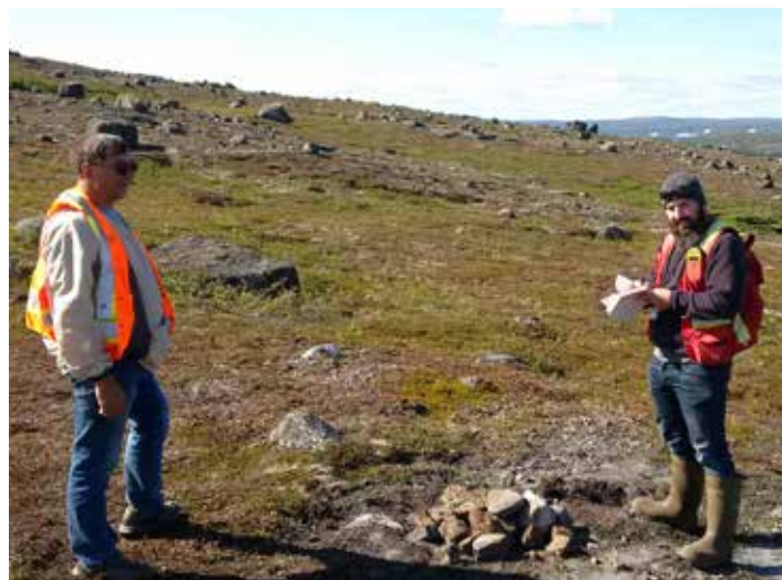
Inspections at drill site, South Voisey Project.

There have been 307 applications for exploration approval processed, so far, in 2018, compared to a total of 332 by year-end, 2017. Exploration-site inspections are conducted on a full-time basis, and companies are advised to be diligent in following all regulations and conditions governing their exploration approvals. Onsite inspections of 29 exploration project sites (as of August 31) have been carried out in various areas of the province. Inspections in Labrador Inuit Lands included participation by an inspector from Nunatsiavut Government's Department of Lands and Natural Resources.