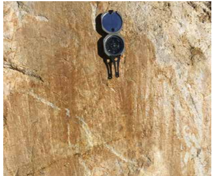
Striae mapping at Sail Pond property's South Zone.