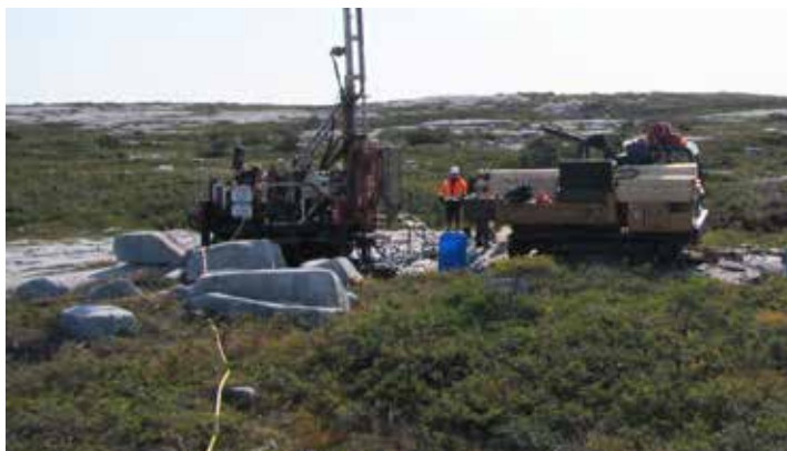
Fall drilling on the White Hills property, Port au Port Peninsula.

All exploration work requires approval from the department. This involves a referral process whereby relevant government and non-government agencies are notified of work intent and scope, and are given the opportunity to provide feedback. Standard conditions and those derived from the referral process are included in the approval document.