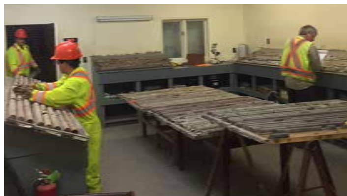
Students assisting personnel from Sokomon Iron Corp in the viewing lab in Buchans, 2018.

The Core-Storage Program is responsible for six core-storage facilities located in Pasadena, Baie Verte, Buchans, Springdale, St. John's and Goose Bay. Seasonally, the program is supported by summer students, normally from the geology program at