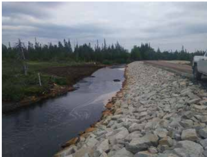
Former Consolidated Rambler Mine Site, Dam Repairs.

to submit an annual report on the past year's operations, and an operational plan for the coming year. Through review of these annual submissions and inspection of mine sites, the section ensures that operators are developing projects in accordance with approved development plans