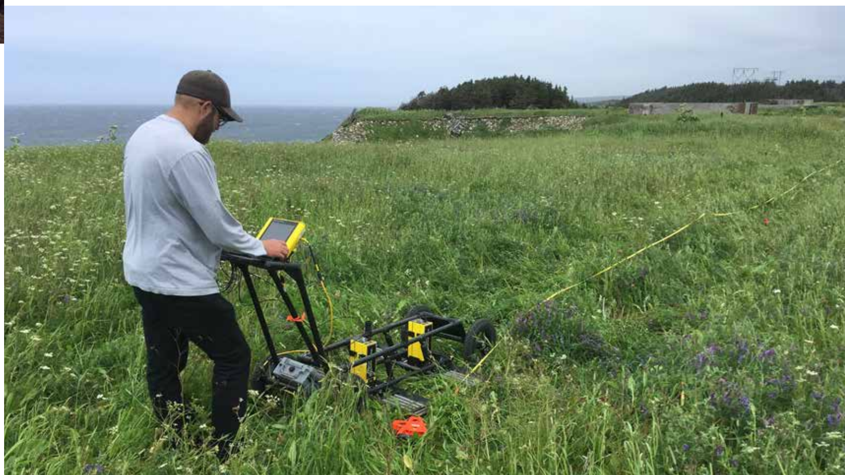
Checking the recorded profile during ground penetrating radar (GPR) survey at the Daniel's Harbour landslide site.