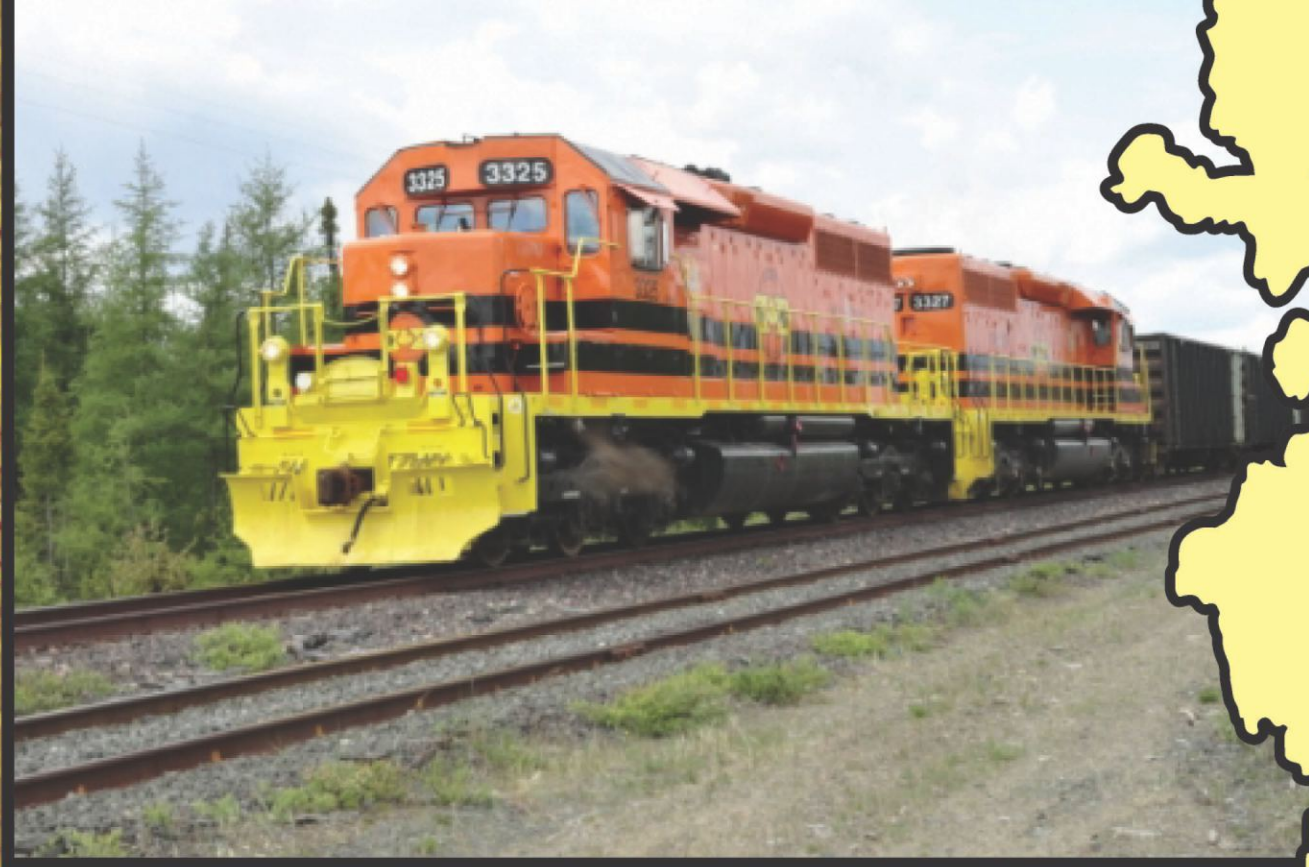
DSO Project. Labrador Iron Mines.