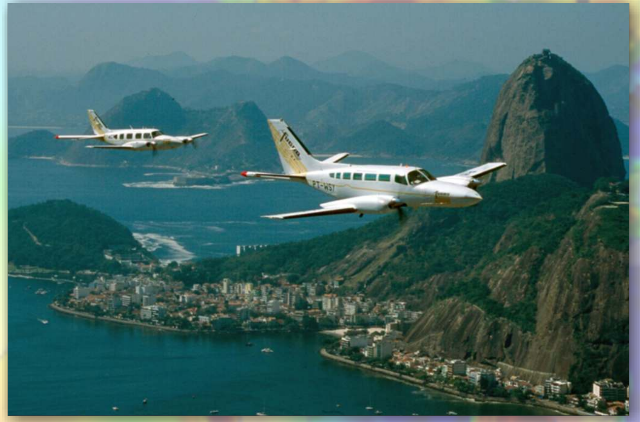
Example of the type of fixed-wing aircraft used to conduct airborne surveys