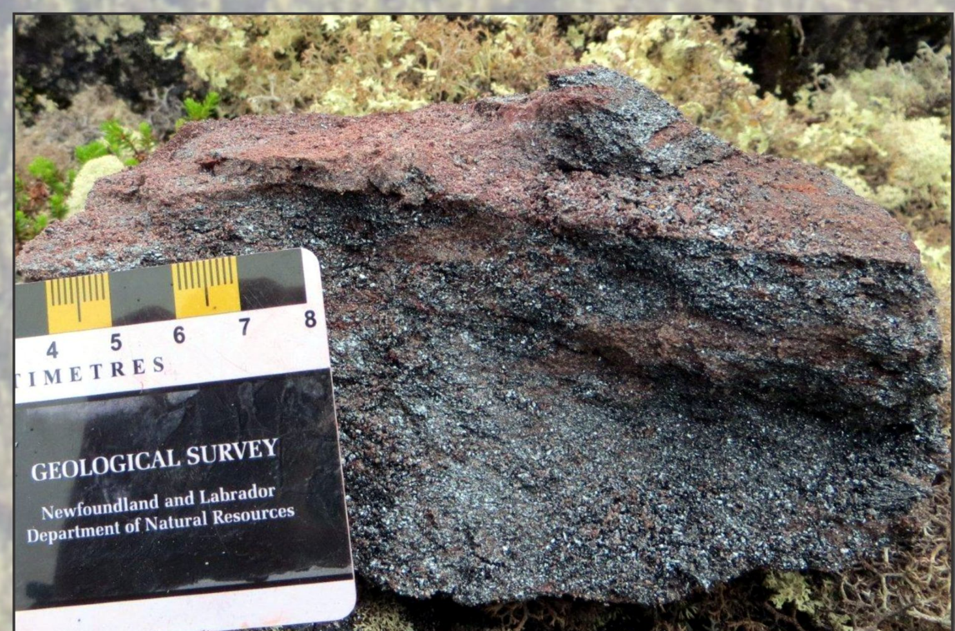
Massive Quartz - Specularite