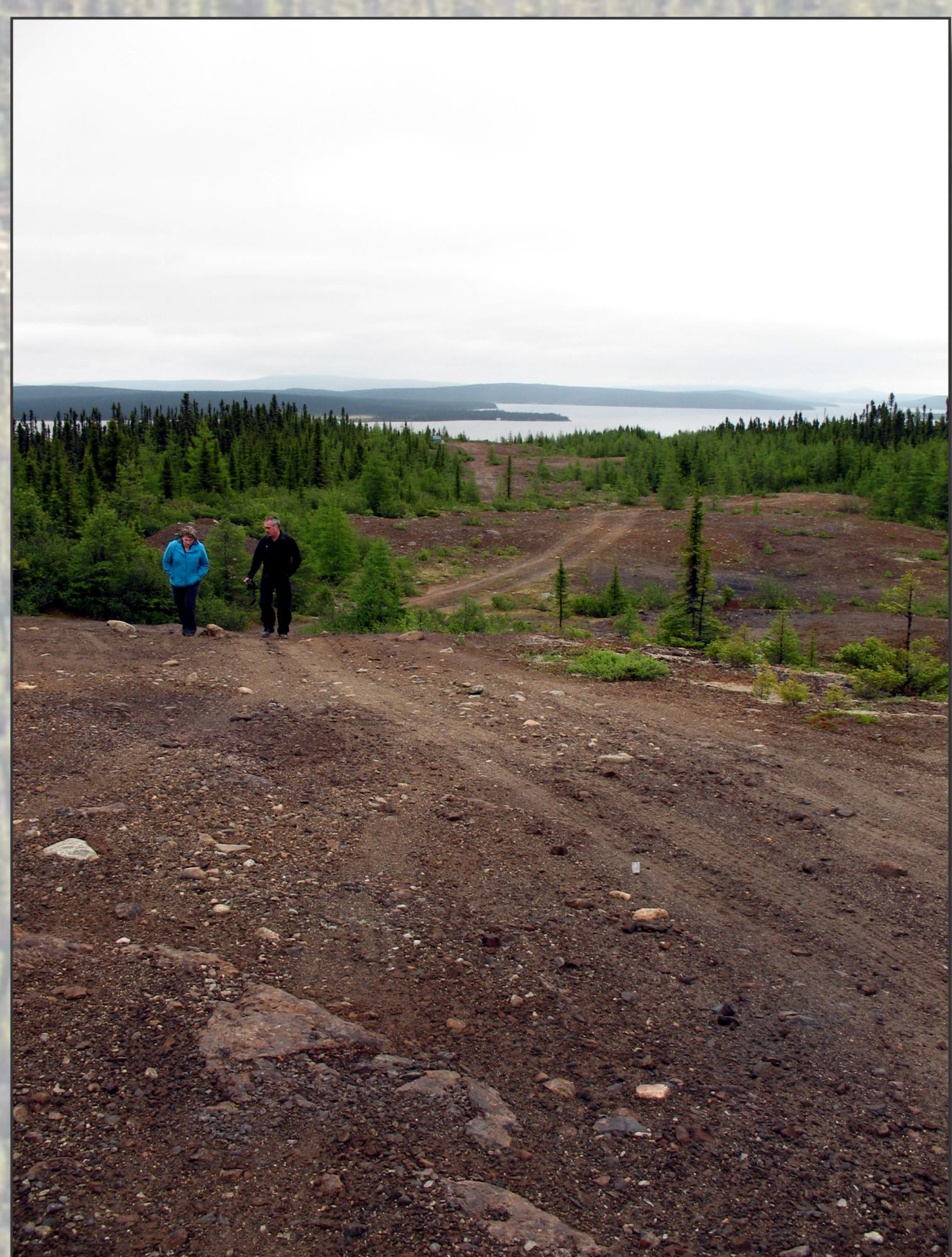
Historic Exploration Trench