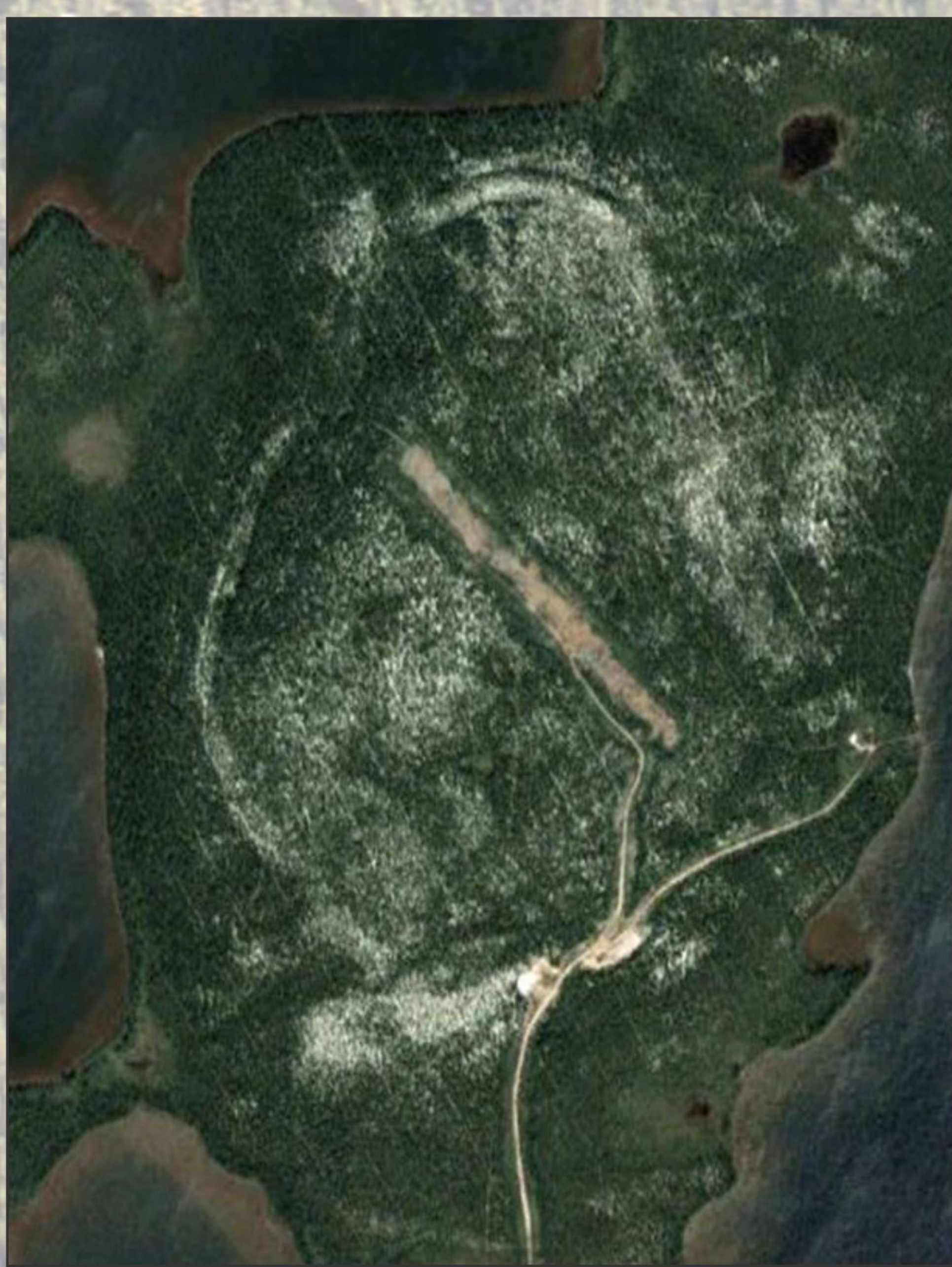
Aerial View Directly Above (North ↑)