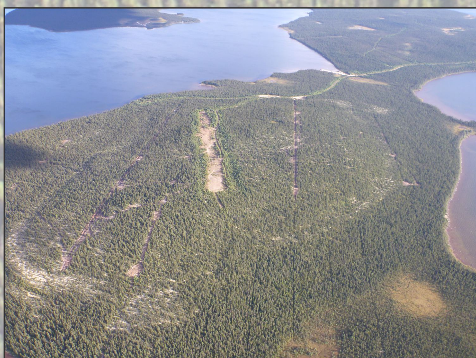
Aerial View of Julienne Lake (looking south)