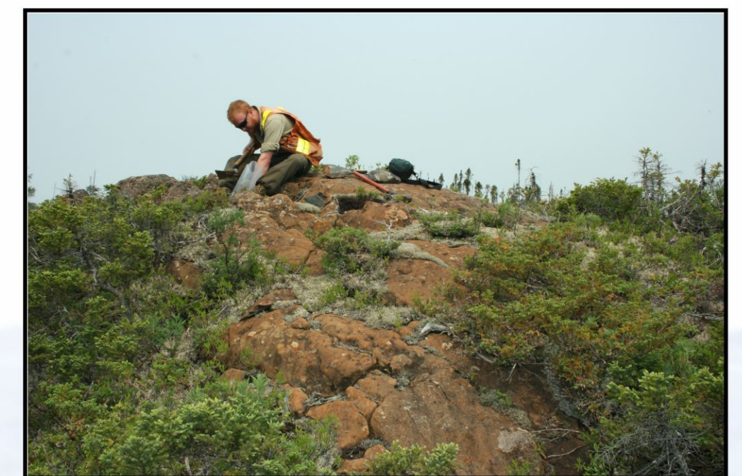
Melatroctolite with 1-3% disseminated sulphide; Red Cross Lake Intrusion. Location 3 on map.

Fe-Ti-V mineralization in western Newfoundland is interpreted to be magmatic, and may have similar characteristics to some of the magmatic type Ni-Cu mineralization elsewhere on the island. Other mid-Paleozoic intrusions may have similar potential.