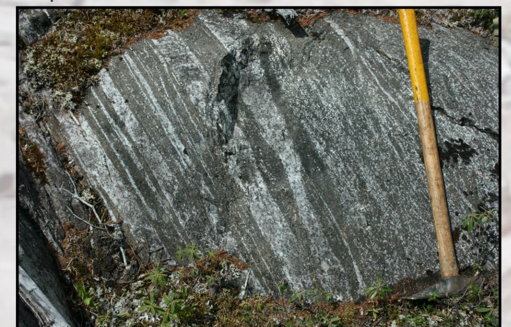
Layered troctolite - SW portion of the Mt. Peyton Intrusive Suite. The rocks locally contain minor sulphide disseminations. Location 4 on map.