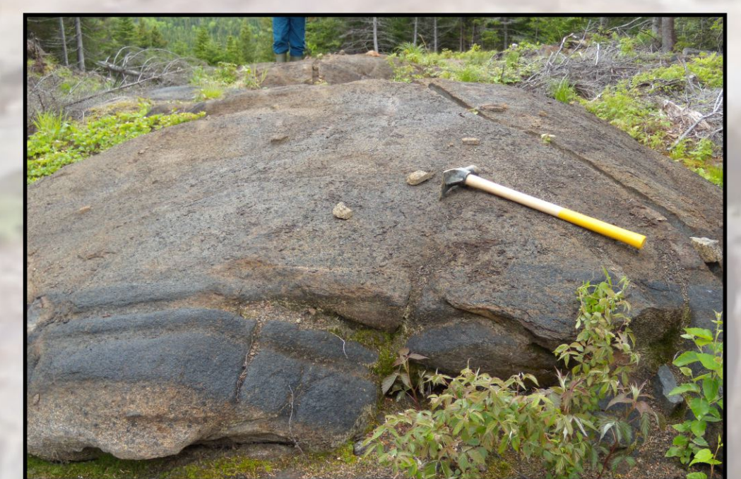
Cumulate oxides (magnetite-ilmenite) within layered gabbro in the Keating Hill Area. Location 2 on map.