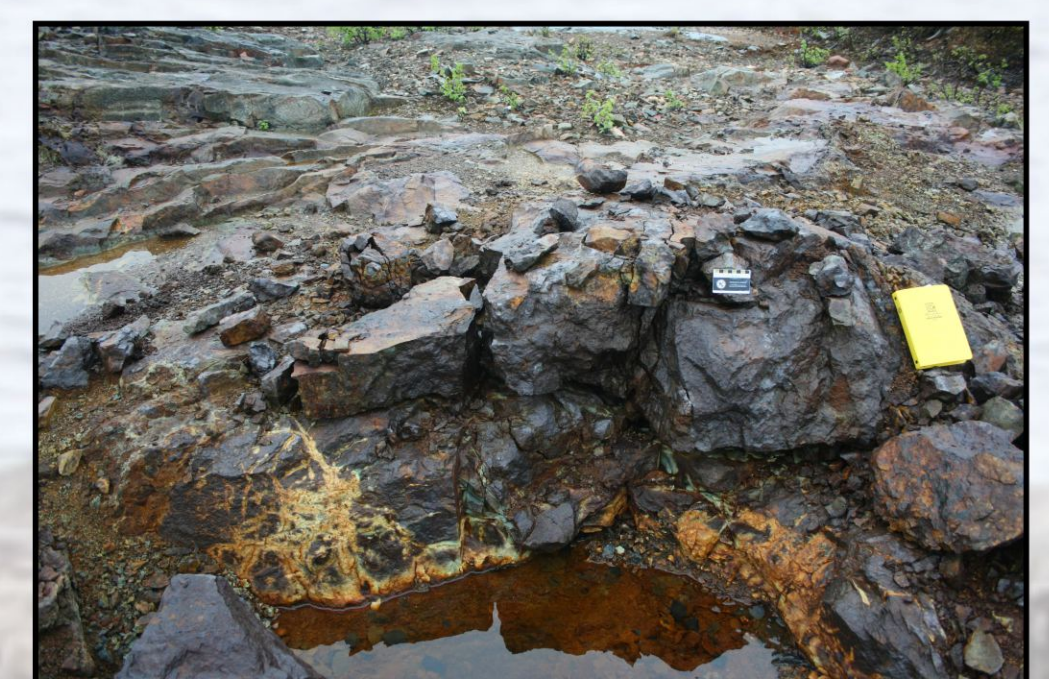
Massive sulphide pod at the base of a gabbro containing disseminated sulphide - Main Showing - Powderhorn Lake area. Location 5 on map.