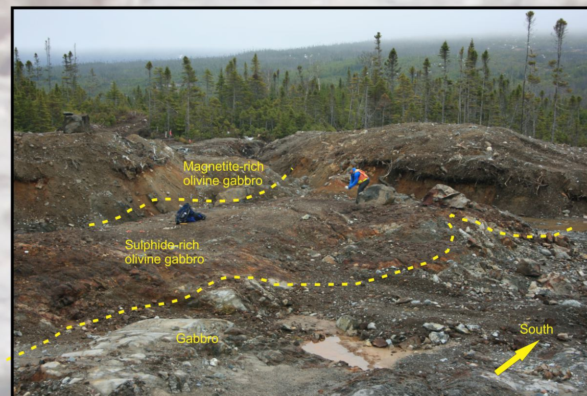
Main trenched and stripped area of the Portage occurrence, Puddle Pond intrusion. Location 1 on map.