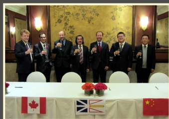
Signing Ceremony, Beijing, November, 2012: Xinxing Cathay and Century Iron Mines / Altius Value: (details tba)