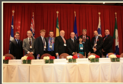
Canada-China Mineral Investment Forum 2013, Beijing