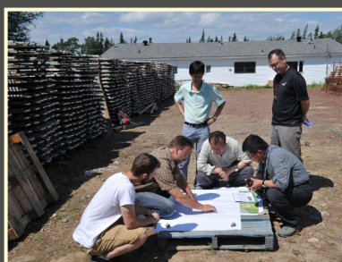
China's Ministry Lands and Resources / China Academy of Geological Sciences (CAGS) Department seminar & VMS field trip