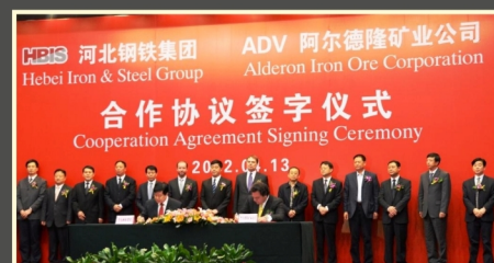
Signing Ceremony, Shijiazhuang (Hebei Province), April 2012 Alderion Iron Ore Corp. and Hebei Iron and Steel Group Co. Value: $182.2 Million