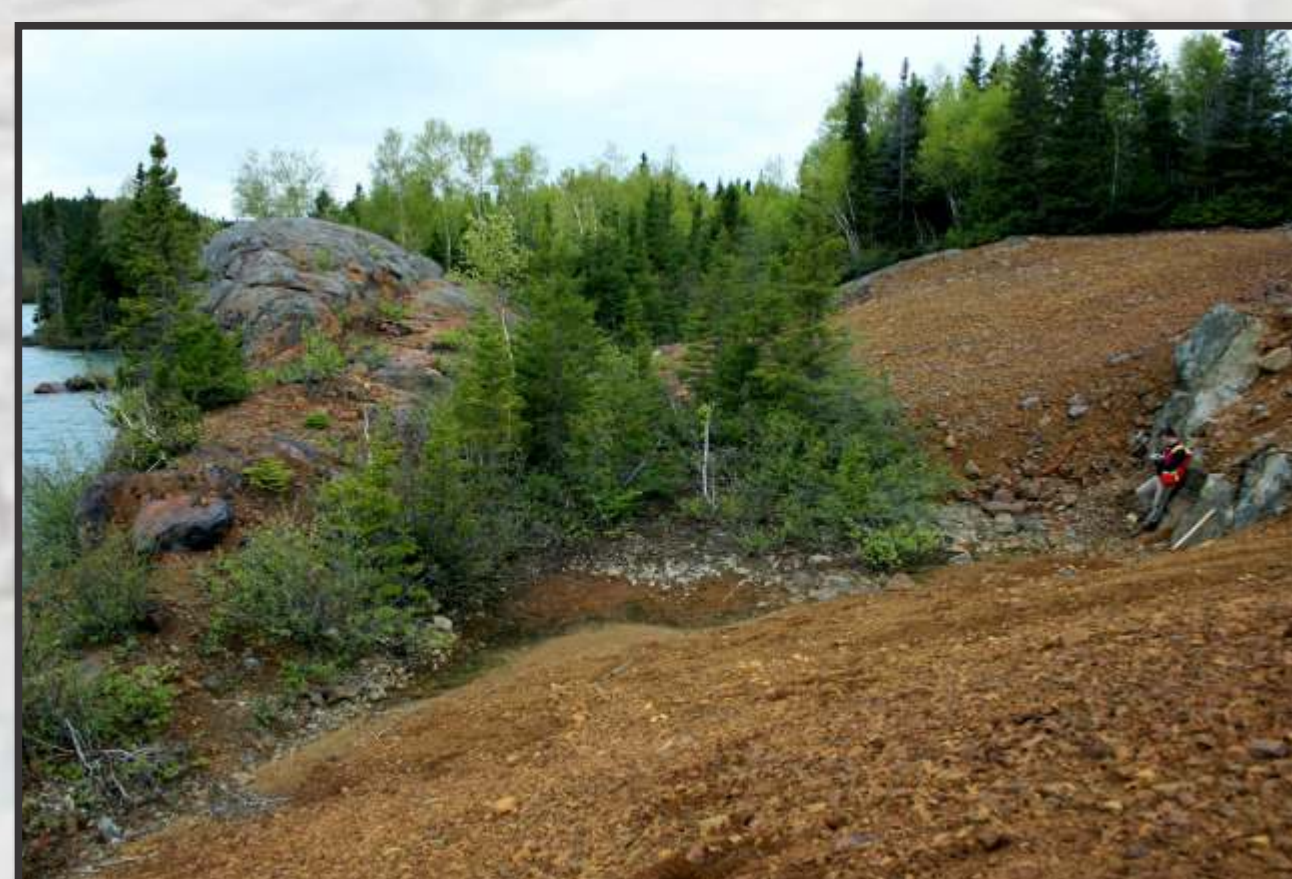
Outcropping VMS mineralization at the Gullbridge deposit.