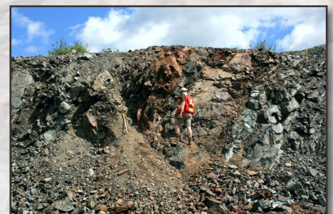
New exposure of structurally bound VMS-style mineralization, located in a quarry ~ 4.5 km northeast of the Gullbridge deposit.