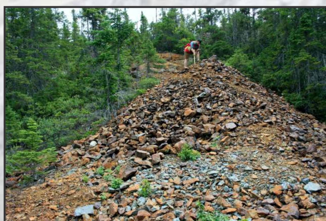
Historical adit, Southwest Shaft deposit.