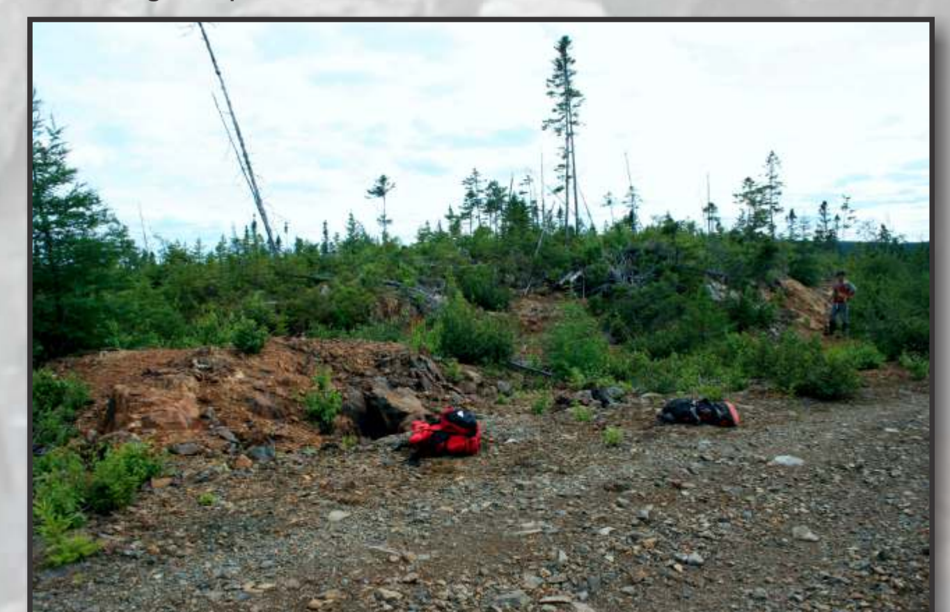
Outcropping VMS mineralization and related alteration, Lake Bond deposit.