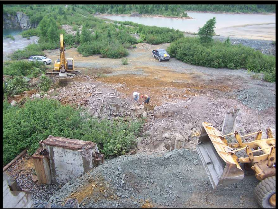
A view of the worksite from above. (before)