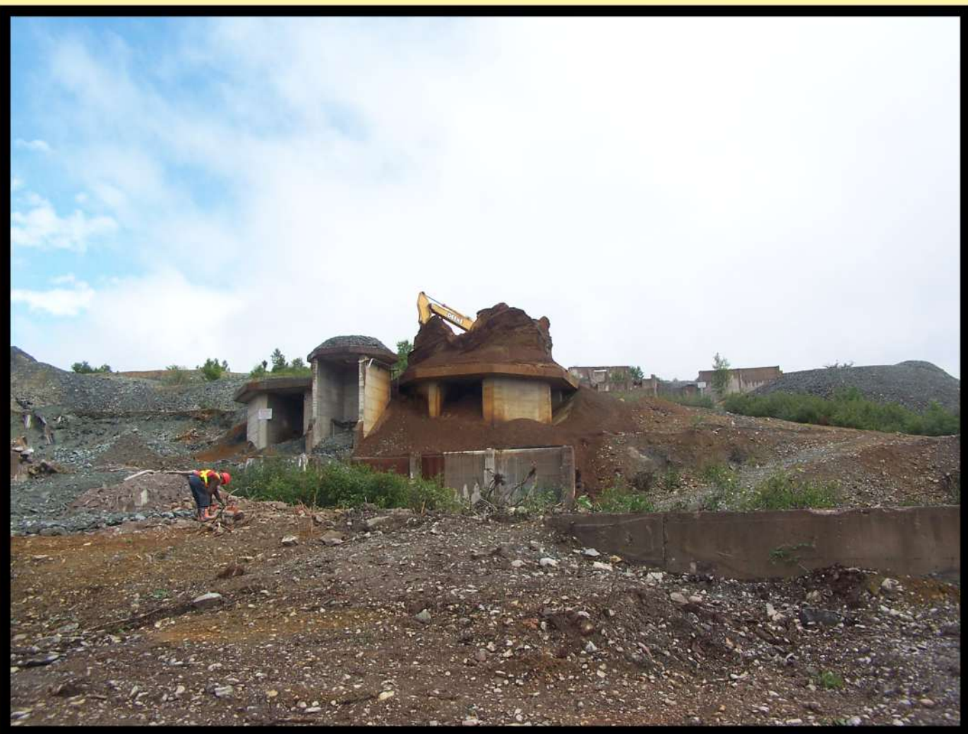
All acid generating material had to be gathered and stockpiled.