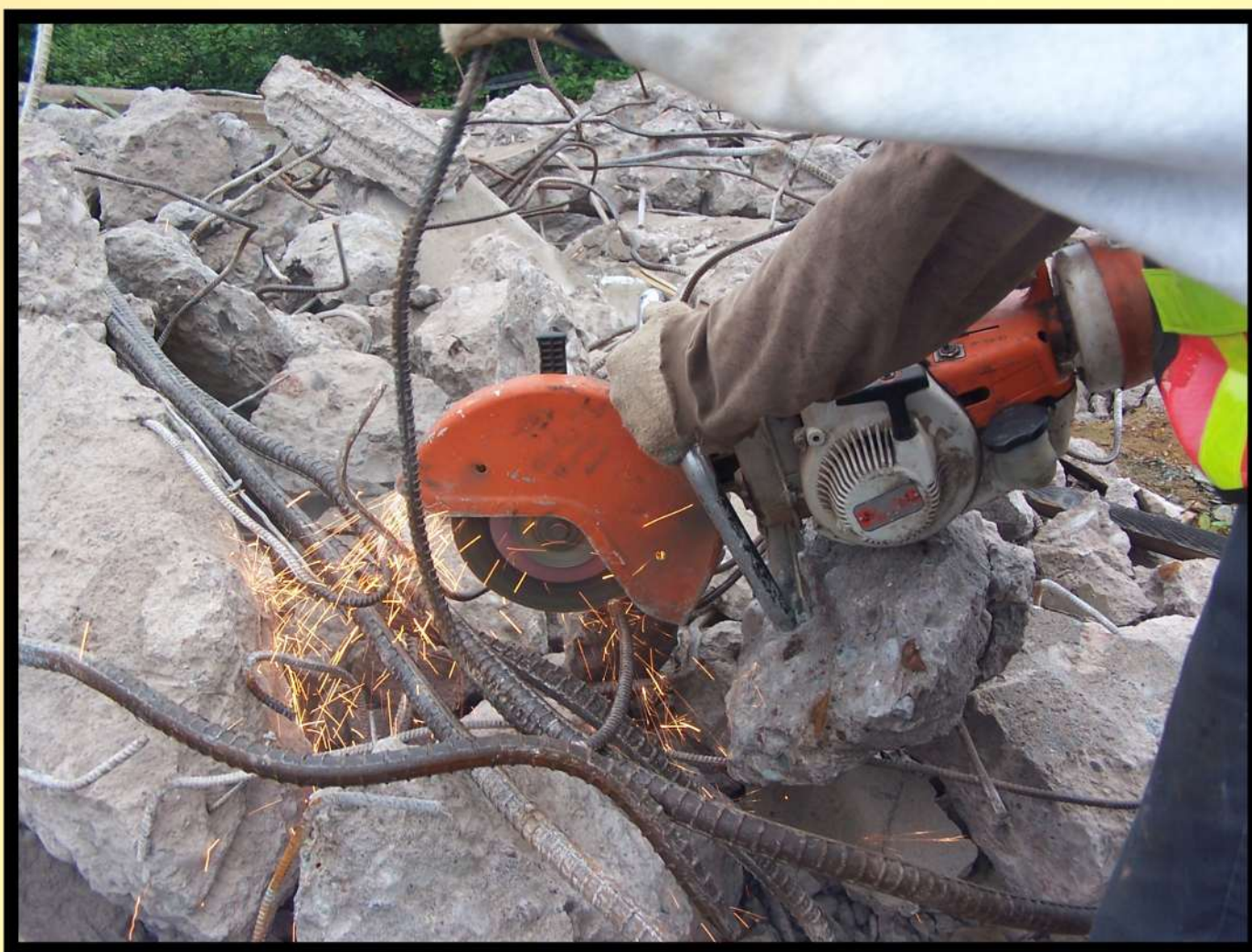
Cutting off the reinforcing bars.