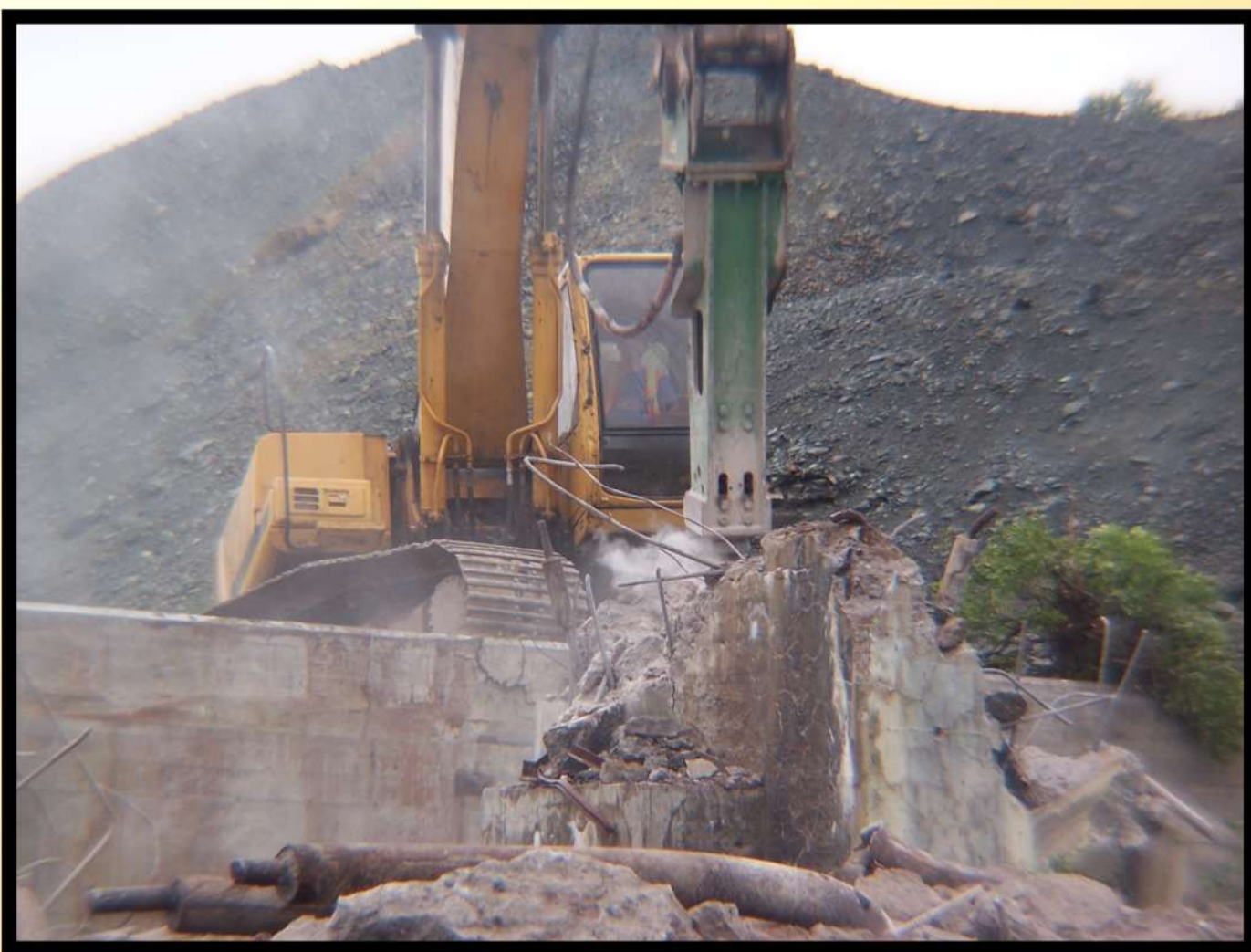
Using a hydraulic hammer to break up the concrete foundations.