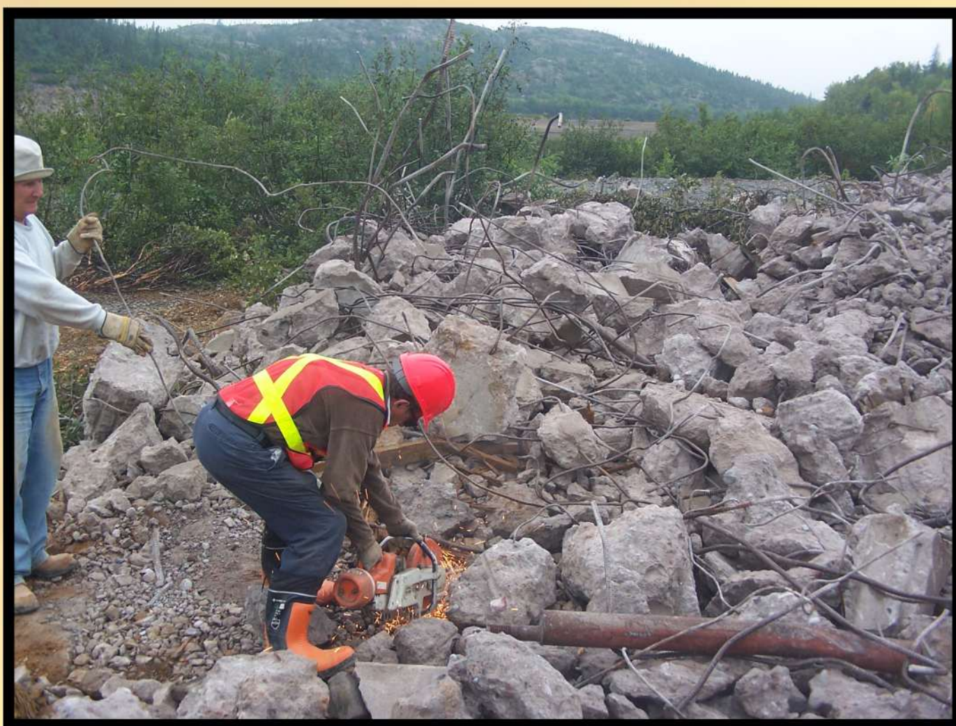
Cutting off the reinforcing bars.