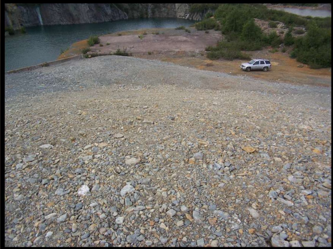
A view of the worksite after completion.