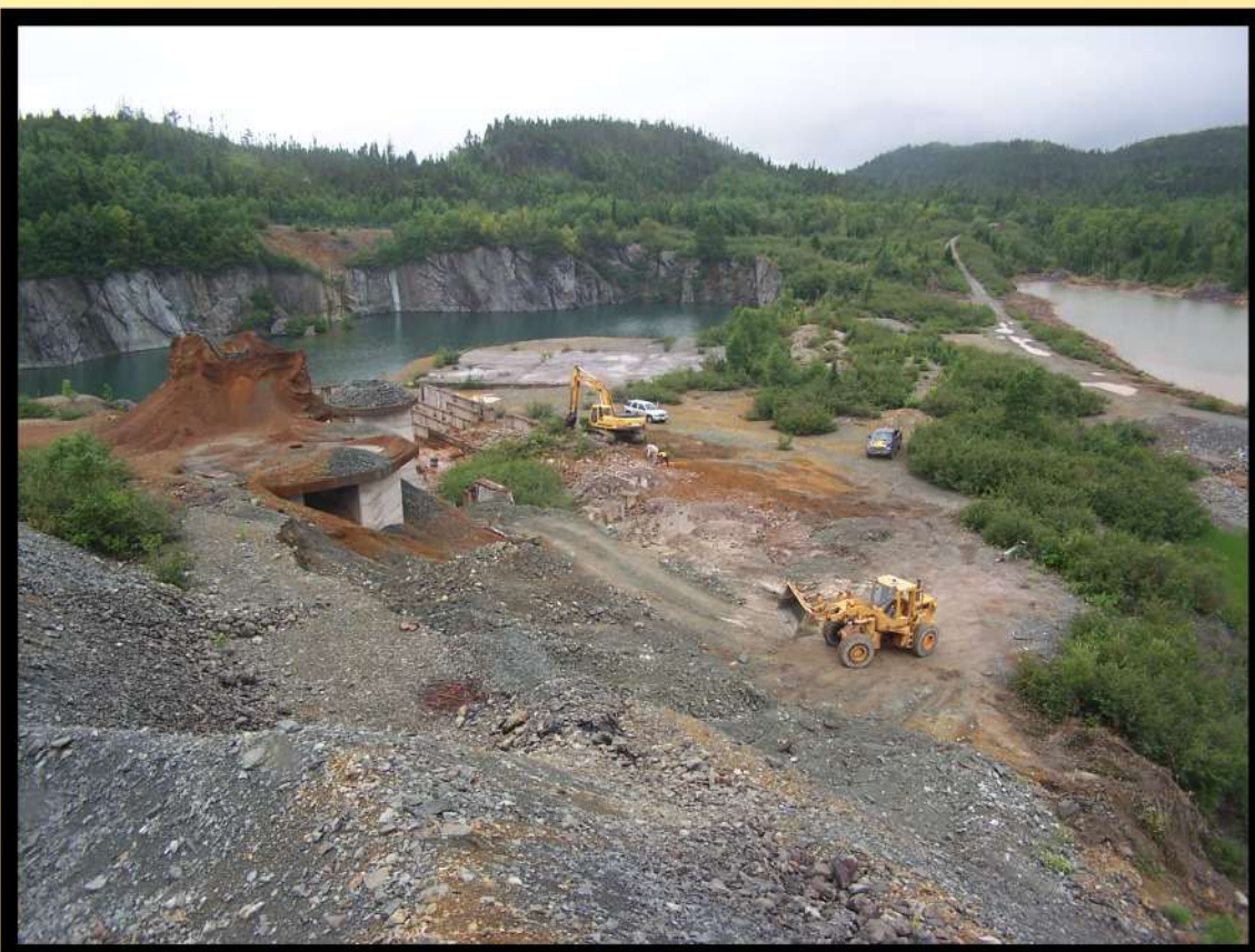
A view of the worksite from above. (before)