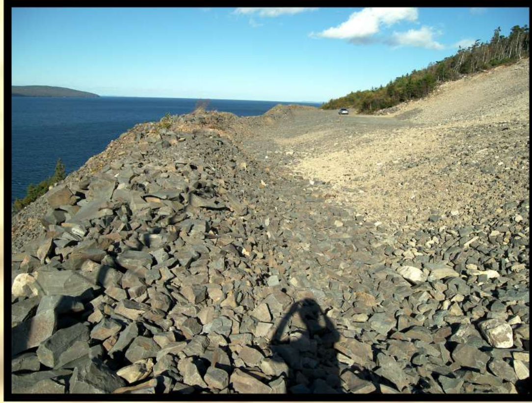
View of Safety Berm at the base of the slope.