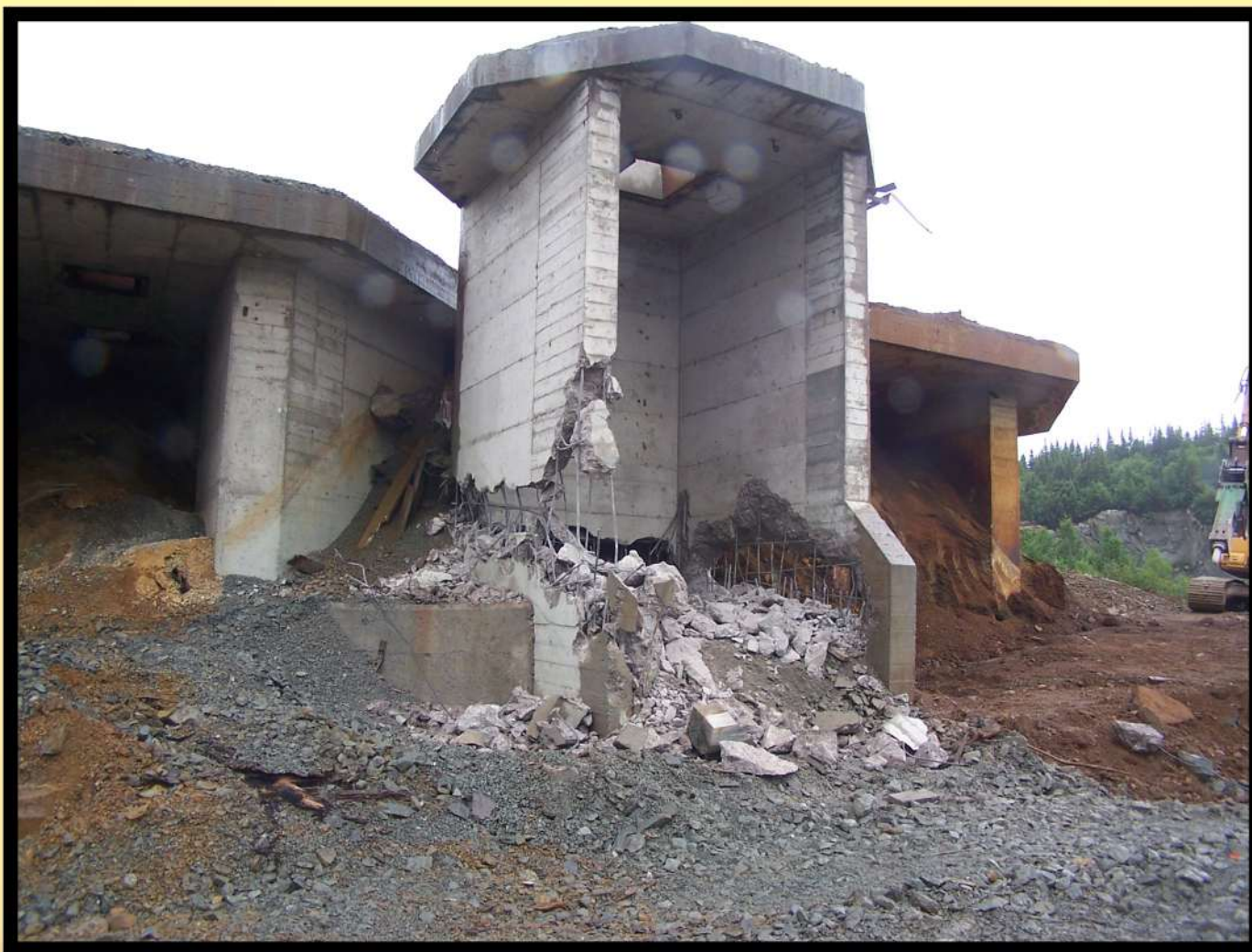
The hydraulic hammer was used to collapse a high concrete structure.