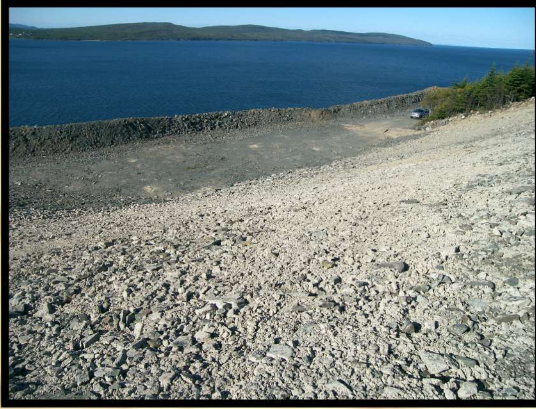
View of Safety Berm at the base of the slope.