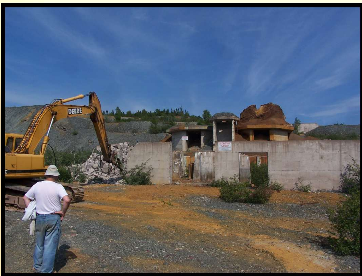
Using a hydraulic hammer to break up the concrete foundations.