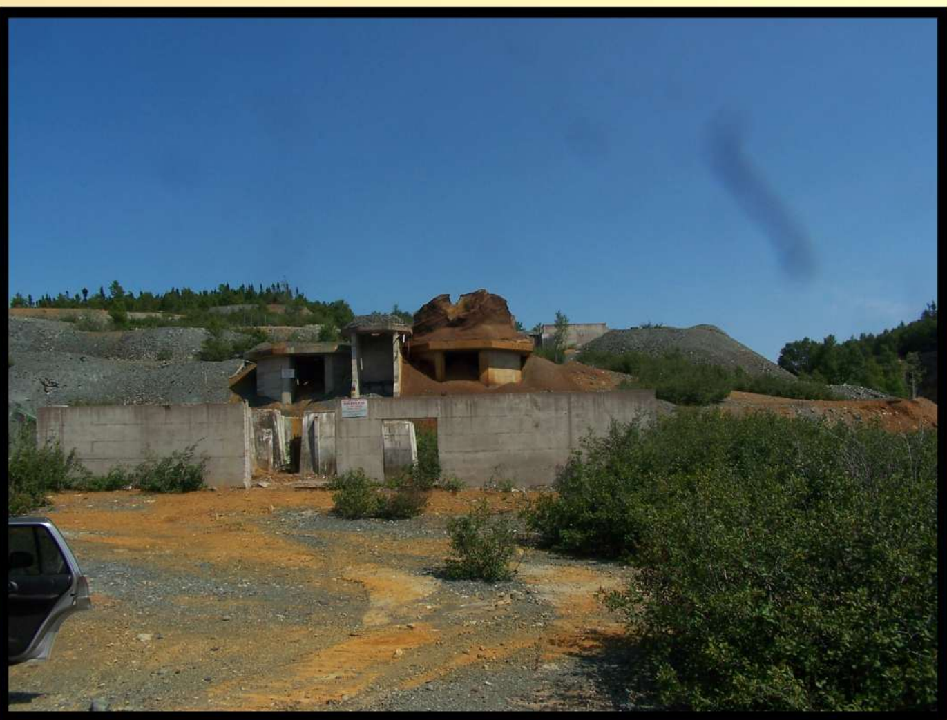
View of Whalesback Abandoned Mill Site - July, 2008.