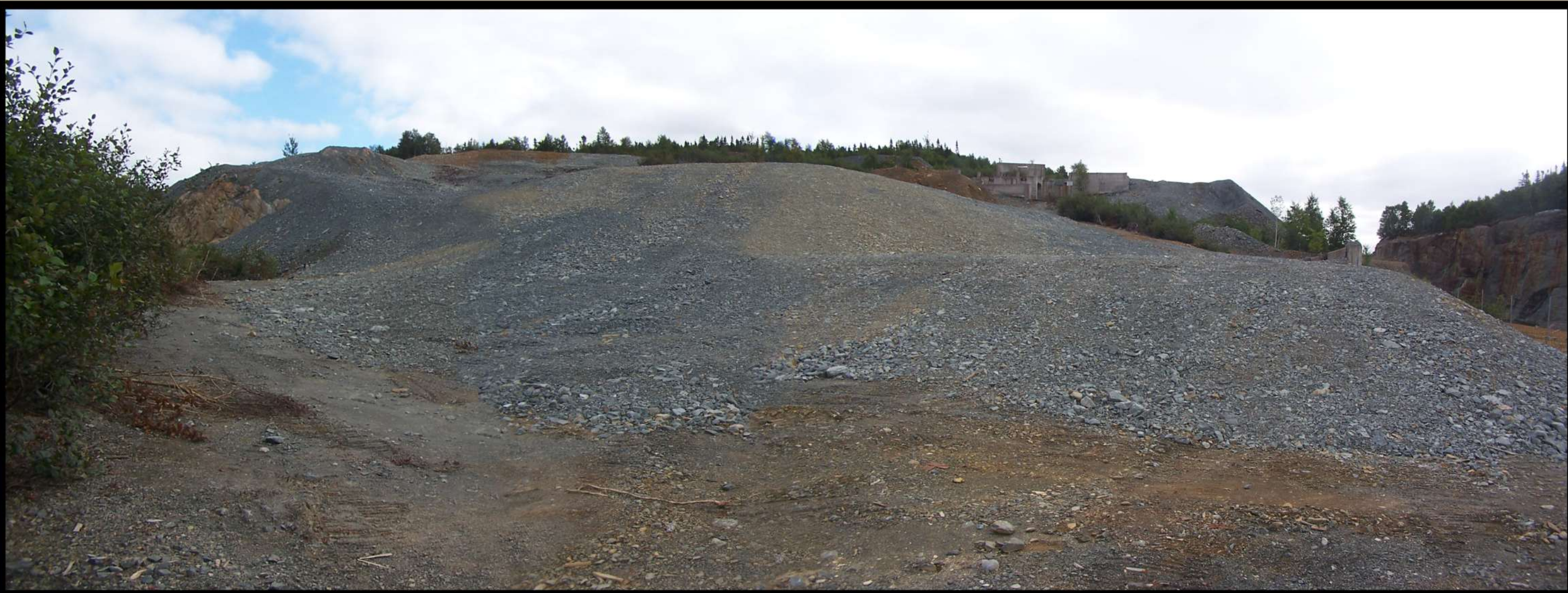
View of former mill site after rehabilitation.