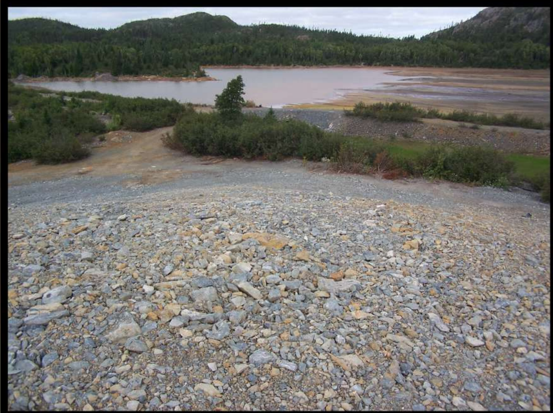
A view of the worksite after completion.