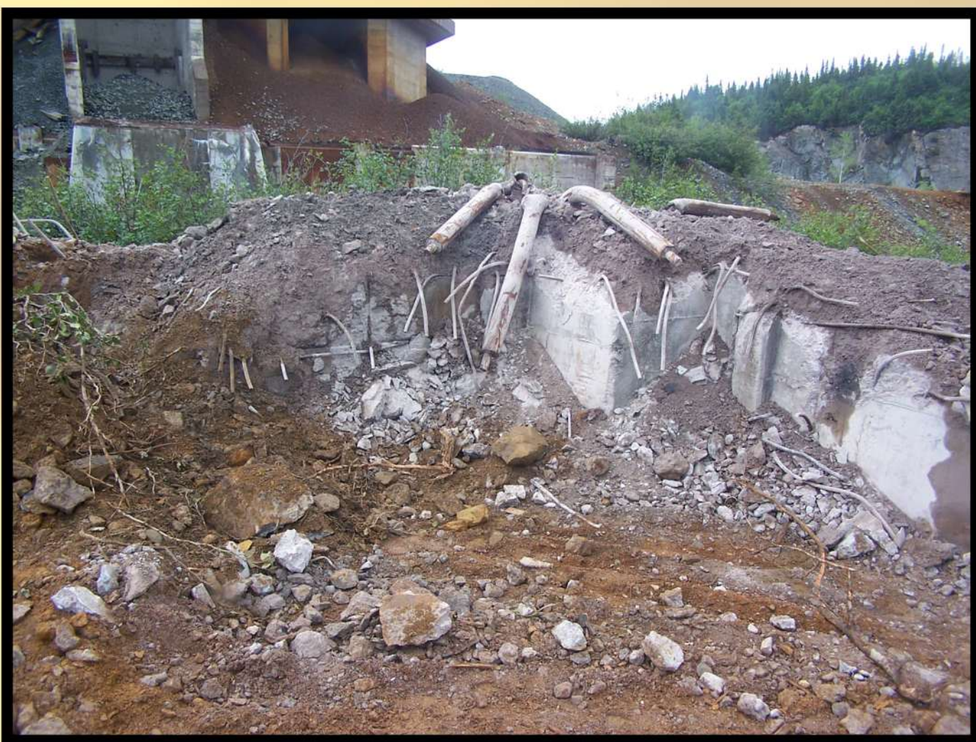
The reinforcing bars were bent down for safety reasons.