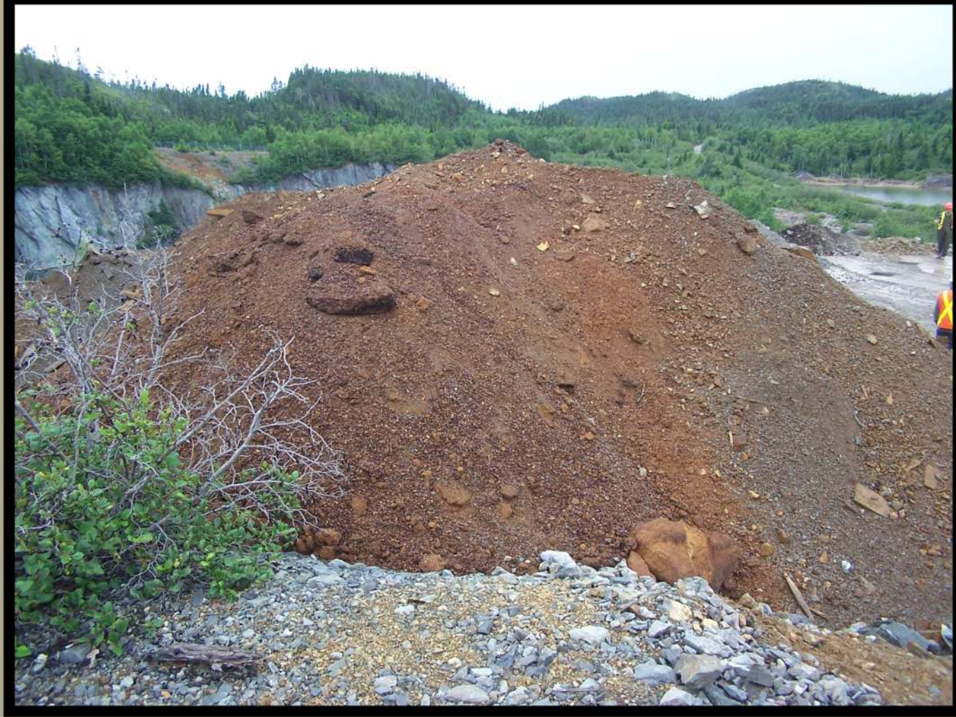
Stockpiled acid generating material.