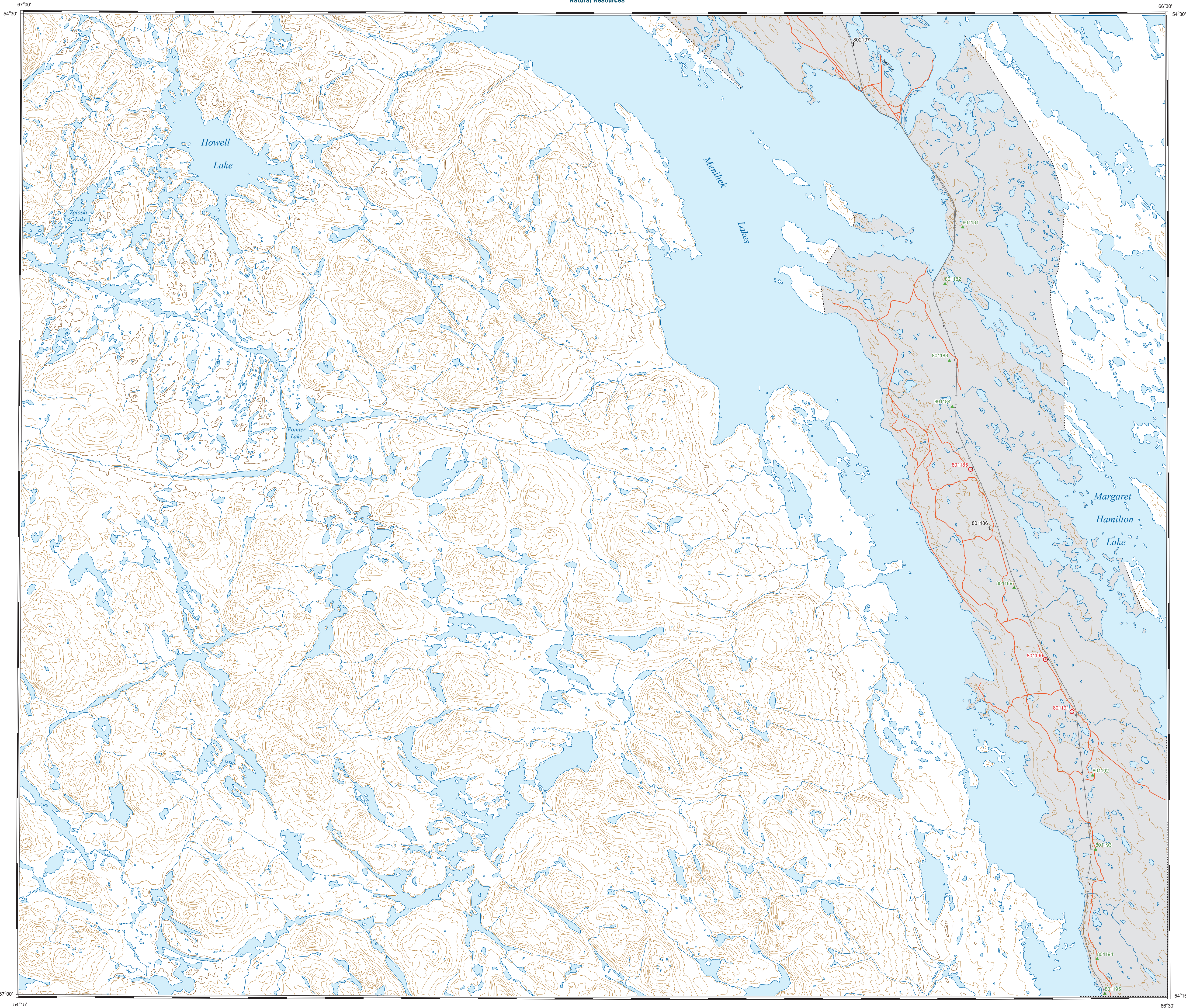
MAP 2014-14 MENIHEK LAKE (NTS 23J/07) NEWFOUNDLAND AND LABRADOR