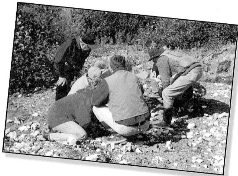
Looking for gold at the "Knob Showing" near Glenwood during the CIM Teachers Field Trip.