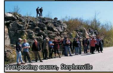
Prospecting course, Stephenville

major industry conferences. The Resource Room helped prospectors to follow up contacts made at the industry conferences. The Resource Room was also part of the delegation to the 9 th Biennial SGA-NAMS meeting, held in Dublin, Ireland, and distributed information on prospectors properties available for option.