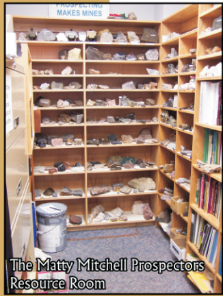
The Matty Mitchell Prospectors Resource Room

The Matty Mitchell Prospectors Resource Room project is currently in its tenth year of operation. Principal objectives of the Room are to provide technical and promotional assistance and mentoring to prospectors across Newfoundland and Labrador. In 2007, the Resource Room provided in excess of one hundred individual clients, on multiple visits, with on-site information and consultation services, including rock and mineral identification, help with data interpretation, presentation, property promotion and technical advice. Others were assisted via telephone and/or email consultations and through seminars and prospecting courses. The booming commodity sector encouraged many prospectors to stake properties, resulting in a steady demand on our resources in 2007. It was a busy but rewarding year in which we saw at least nine prospectors successfully option their properties either to local juniors or Canadian majors.