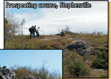
Prospecting course, Stephenville