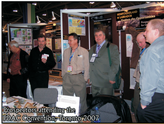
Prospectors attending the PDAC Convention, Toronto 2007

The Resource Room continues to develop outreach initiatives to promote itself and its services to the public. As part of our