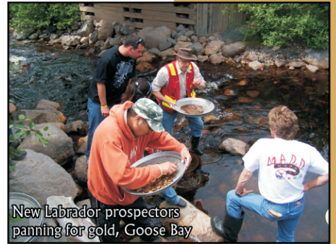
New Labrador prospectors panning for gold, Goose Bay

The Management Committee Matty Mitchell Prospectors Resource Room