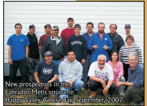
New prospectors in the Labrador Metis course in Happy Valley-Goose Bay, September, 2007.