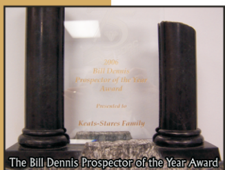
The Bill Dennis Prospector of the Year Award

The Resource Room supplied property promotional services and technical and logistical support to clients at the 2007 PDAC (Toronto), Exploration Roundup (Vancouver) and Mineral Resources Review (St. John's) trade shows. We developed, displayed and distributed prospector property posters and Properties for Option maps, booklets and CD-ROMs, and joined with the Survey in developing promotional and regional technical posters for these