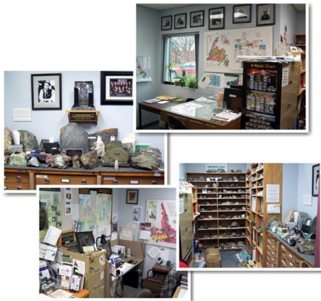
The Matty Mitchell Prospectors Resource Room

The MMR continues to meet its original purpose as a permanent multi-use resource area and drop-in centre for prospectors. Over the past 10 years, however, the partnership project has evolved into a major venture that facilitates effective delivery of a wide range of joint government—industry initiatives in support of prospecting and the mineral exploration industry. As before, we strive to deliver these initiatives and meet client demands in a rapid, effective, and cost-efficient manner.