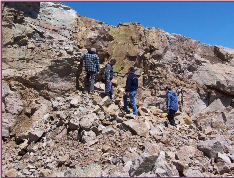
Prospecting course participants, Stephenville, 2009

A public—private sector partnership working for the Newfoundland and Labrador prospecting community