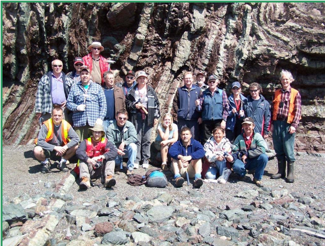
Graduates of the Stephenville Prospecting Course, June 2009