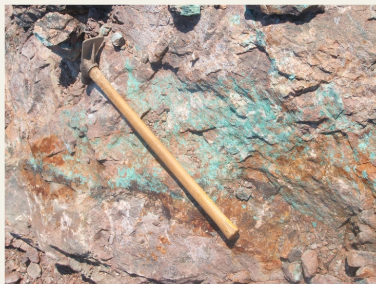
Plate 1: Doe Hills Mineralization

Three historic mineral occurrences have been found on the property, the two Avalon Isthmus Copper showings and the Doe Hill Barite Showing. The barite is located in joints and fractures and at least some of the copper mineralization occurs along the core of a regional anticline (Map 2). Several exploration companies worked the area in the 1980's and 1990's but filed no reports. In the mid-1990's, the Quinlan prospecting brothers staked property based on the discovery of copper mineralization in the rhyolite of the Bull Arm Formation. A grab sample returned 7.7% Cu, 0.89 oz/t Ag and 104 ppb Au .