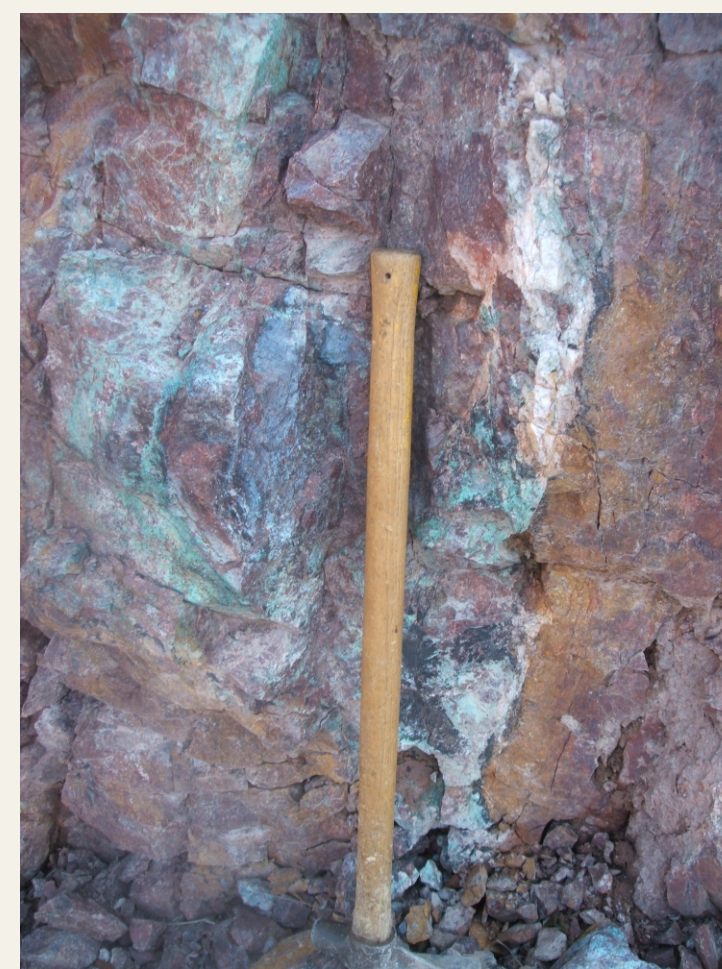
Plate 2: Doe Hills Mineralization