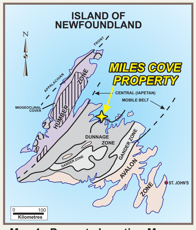
Map 1. Property Location Map

The Miles Cove Property consists of 69 claims located in northern Newfoundland on Sunday Cove Island approximately 0.5 km south west of the small community of Miles Cove. The Miles Cove Road and causeway connects Sunday Cove Island to Route 380, a paved highway which joins the Trans Canada Highway approximately 15 km to the southwest (Maps 1 and 2).