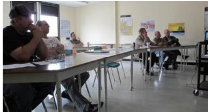
Participants at the one-day prospecting course in Baie Verte