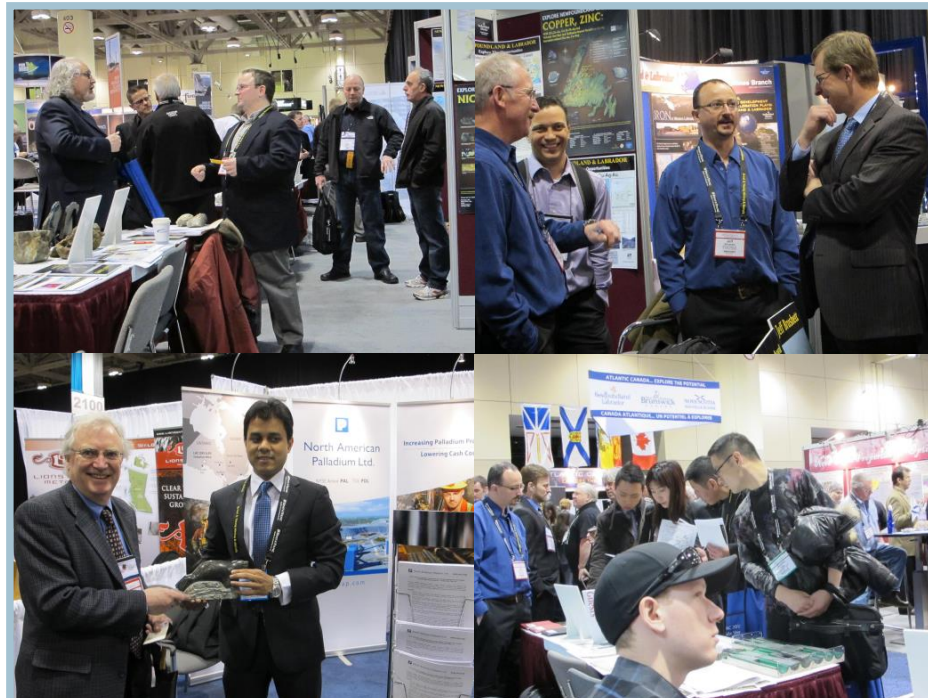
Prospectors and international delegates at the PDAC, Toronto, 2012