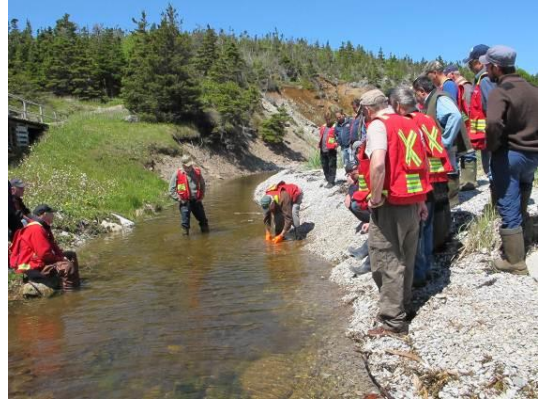
Prospectors at the Annual Stephenville Prospecting Course, 2012

The MMR geologist helped to prepare and present a one day prospecting course in Baie Verte at the College of the North Atlantic; space and use of computers were kindly donated by the school administration. Following the course, the annual Baie Verte Mining Conference was attended.