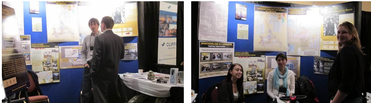
SEG Student Members from MUN volunteering at the Matty Mitchell Booth, Mineral Resources Review 2012

SEG members again volunteered to help the MMR at Mineral Resources Review 2012.