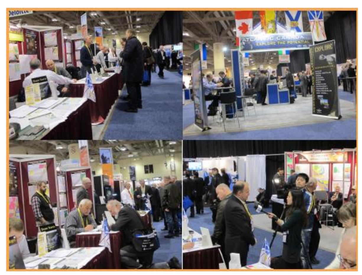
Prospectors promoting their properties at PDAC, 2013

A group of 12 prospectors (listed below with properties/main commodities) were funded jointly by Mining Industry NL and the Department of Natural Resources to attend the PDAC in Toronto. Prospectors also attending the PDAC 2013 from Newfoundland and Labrador, but not funded, included Eddie Quinlan and Lai Lai Chan. With a registration of over 30,000 people from every mining corner of the world, the PDAC provides an excellent venue for prospectors from Newfoundland and Labrador to meet face-to-face and network with professionals from the mining industry, potential optionors of prospectors' properties.