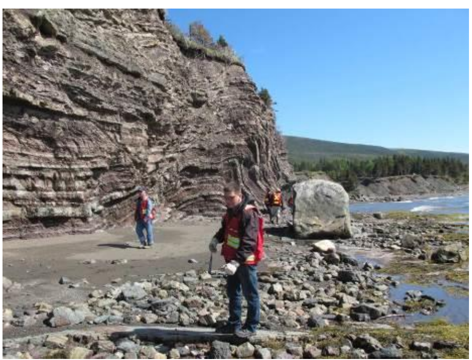
New Prospectors on field trip to Port-au-Port Peninsula, part of the annual Stephenville Prospectors Course, June 2013.

A public—private sector partnership working for the Newfoundland and Labrador prospecting community