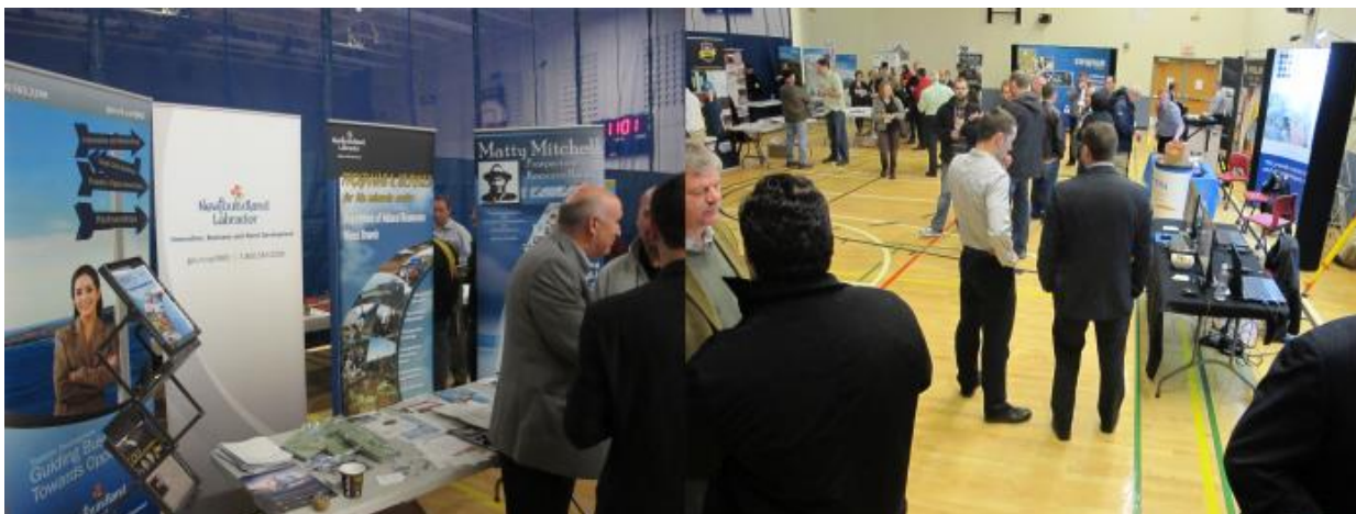
Attendees at the Baie Verte Conference, 2014

The MMR geologist attended the 27 th Annual Baie Verte Mining Conference held in Baie Verte to represent the Matty Mitchell Prospectors Resource Room.