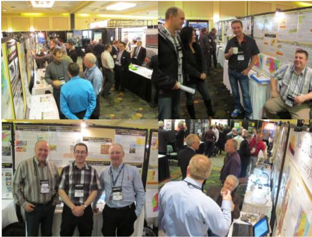
Attendees at the Annual Review, 2014