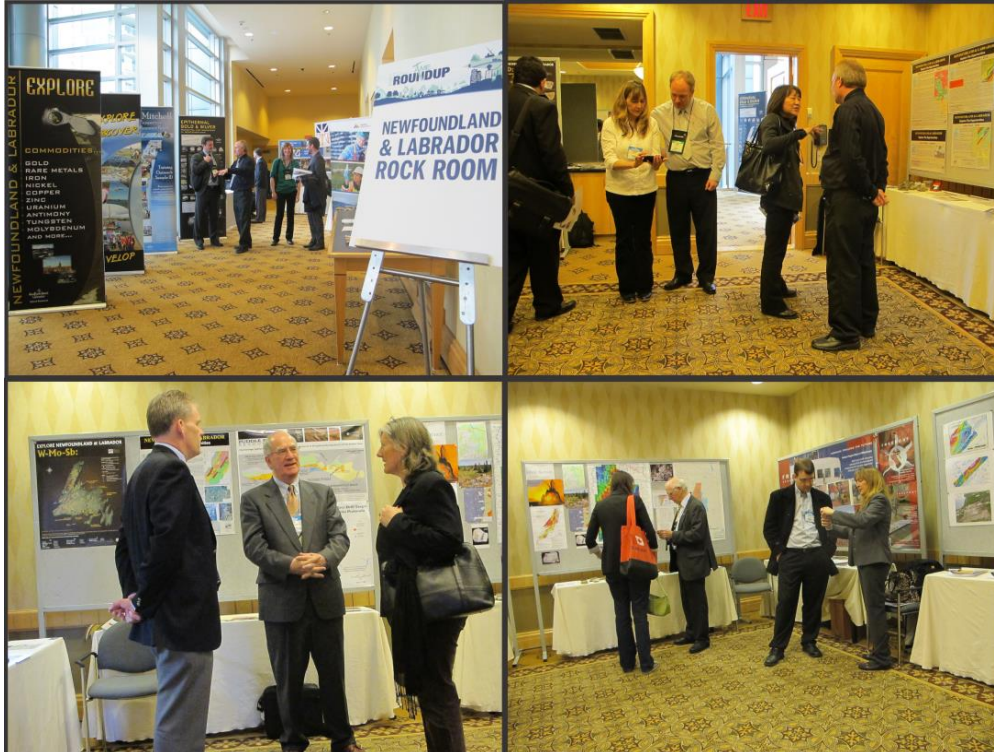
Conference attendees in the Newfoundland Rock Room at Roundup 2014