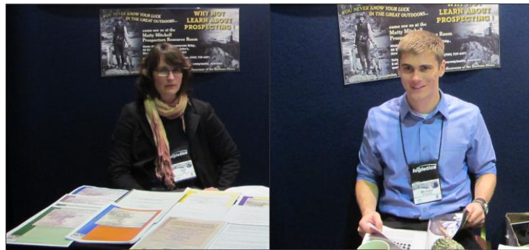
Student Members from MUN volunteering at the Matty Mitchell Booth, Mineral Resources Review

Volunteers from the MUN branch of the SEG kindly provided on-site support to the Matty Mitchell Booth and were available to assist prospectors in the promotional displays. This collaboration is to our mutual benefit, and to that of the prospectors we support.