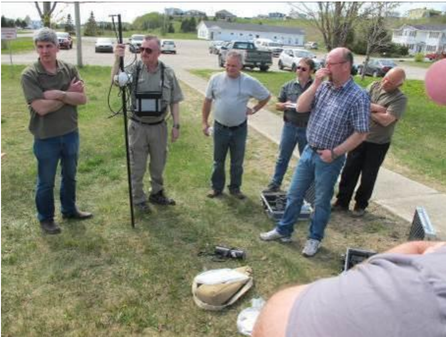
New Prospectors learning about geophysics, part of the annual Stephenville Prospectors Course, June 2014.

A public–private sector partnership working for the Newfoundland and Labrador prospecting community