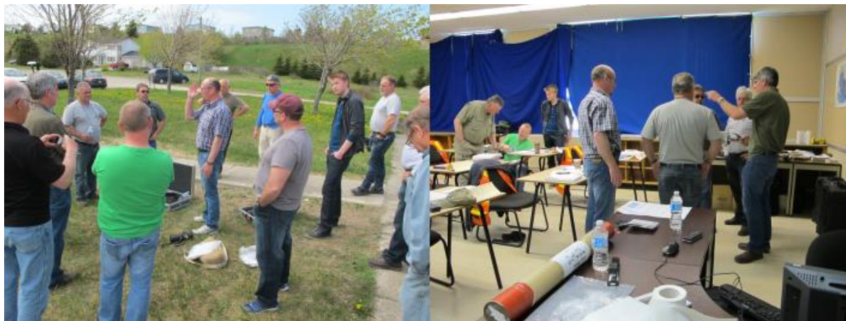
Prospectors at the Annual Stephenville Prospecting Course, 2014

The MMR geologist was available for a portion of the 24 th annual two-week long Prospectors Training Course in Stephenville, to meet the new prospectors and give a presentation on the importance and the role of the Matty Mitchell Prospectors Resource Room and how prospectors can make the best use of this facility.