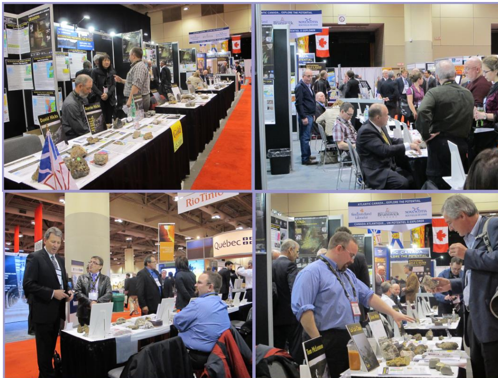
Conference Attendees at the Newfoundland/Labrador Booth, PDAC 2014