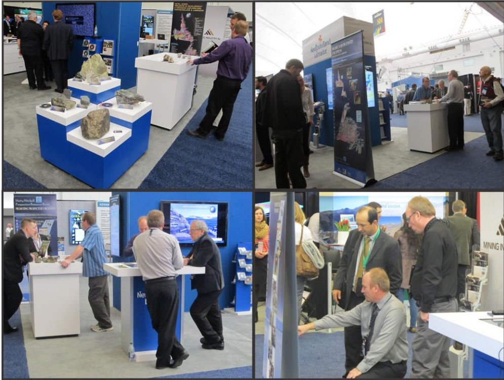
Prospectors promoting properties at the NL Booth, Roundup 2015