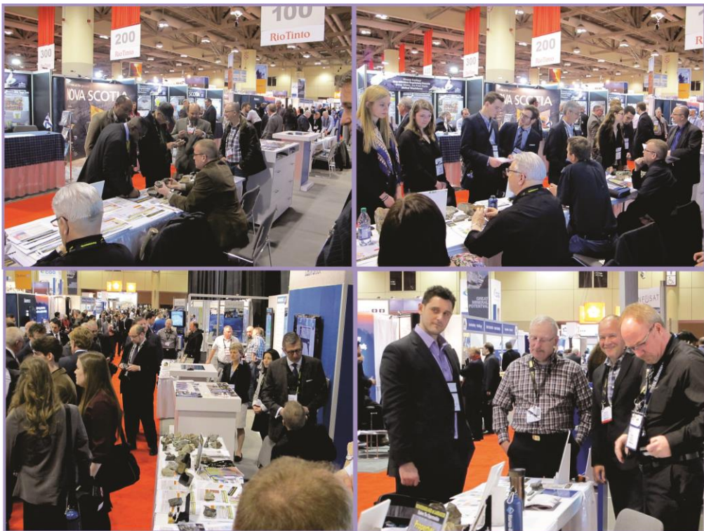
Prospectors promoting properties at the NL Booth, PDAC 2015