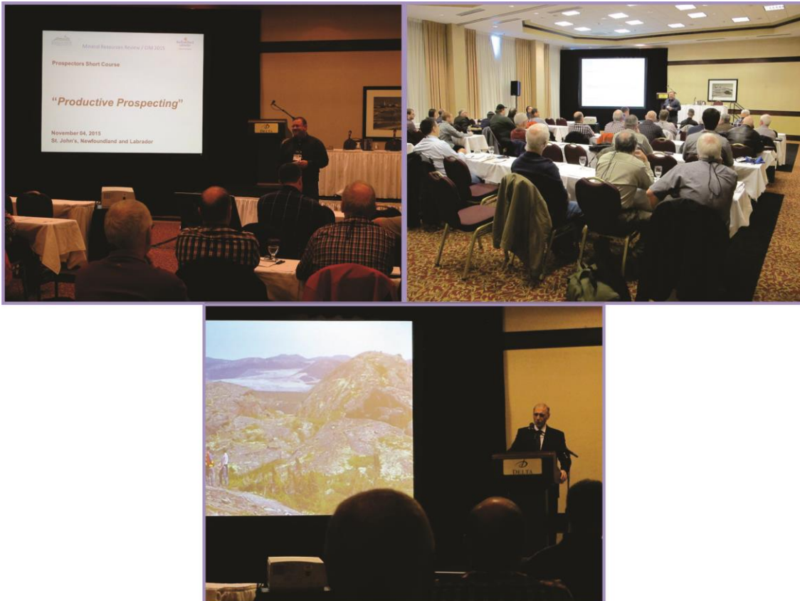
Full House at Prospectors Course, Mineral Resources Review, 2015