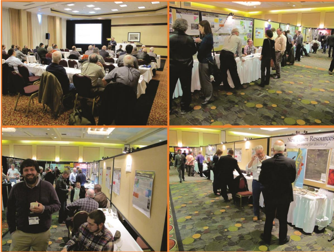
Prospectors attending the Prospectors Short Course and promoting their properties: Mineral Resources Review, 2015