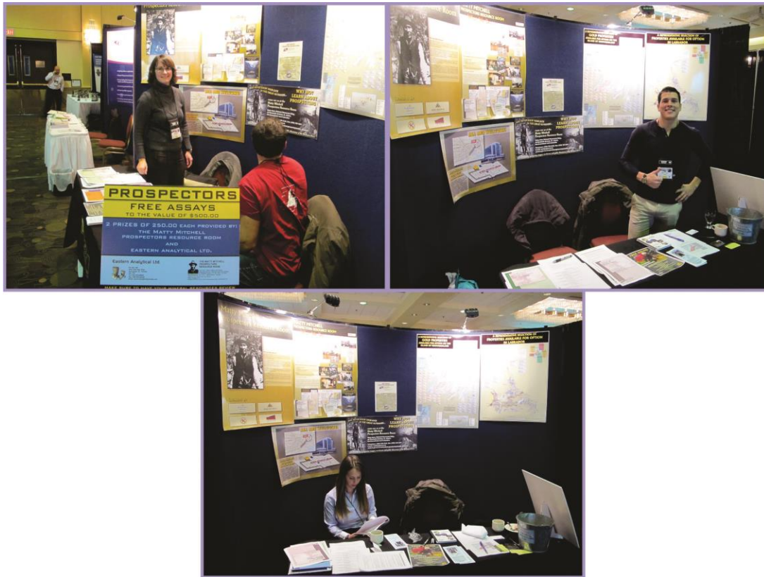
Student Members from MUN volunteering at the Matty Mitchell Booth, Mineral Resources Review, 2015

Volunteers from the MUN branch of the SEG kindly provided on-site support to the Matty Mitchell Booth, at the 2015 Mineral Resources Review, and were available to assist prospectors in the promotional displays. This collaboration is to our mutual benefit, and to that of the prospectors we support.