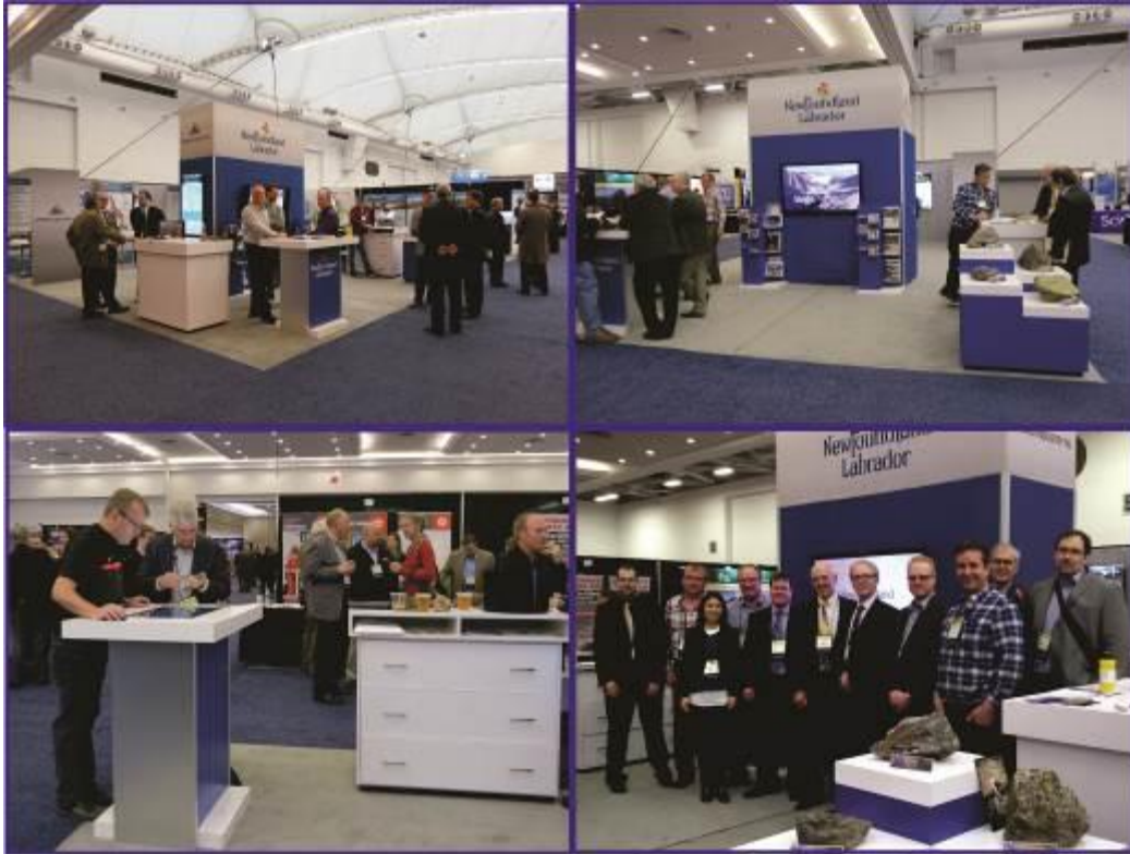
Prospectors promoting properties at the NL Booth, Roundup 2016