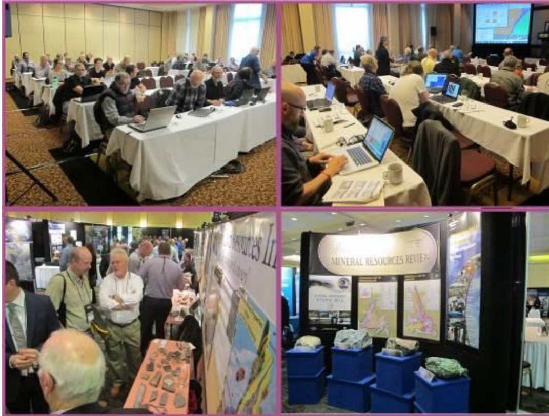
Prospectors attending the Prospectors Short Course and promoting their properties: Mineral Resources Review, 2016

Mineral Resources Review is Eastern Canada's largest mineral industry conference and trade show, attended by about 750 delegates (in 2016), trade show exhibitors and visitors. The event showcases all aspects of the mineral exploration and mining industry in Newfoundland and Labrador. More than 20 prospectors from the province had booth space at the trade show; the MMR geologist prepared posters and had rock samples cut and polished for these prospectors to promote their properties.