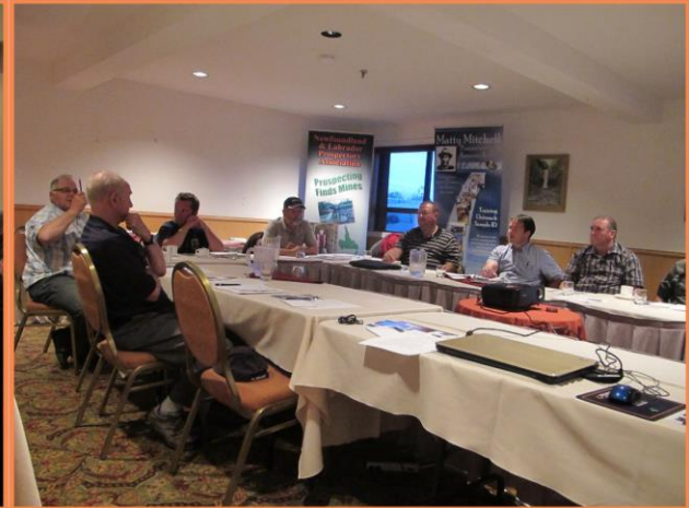
NLPA meeting - July 2016 - Gander