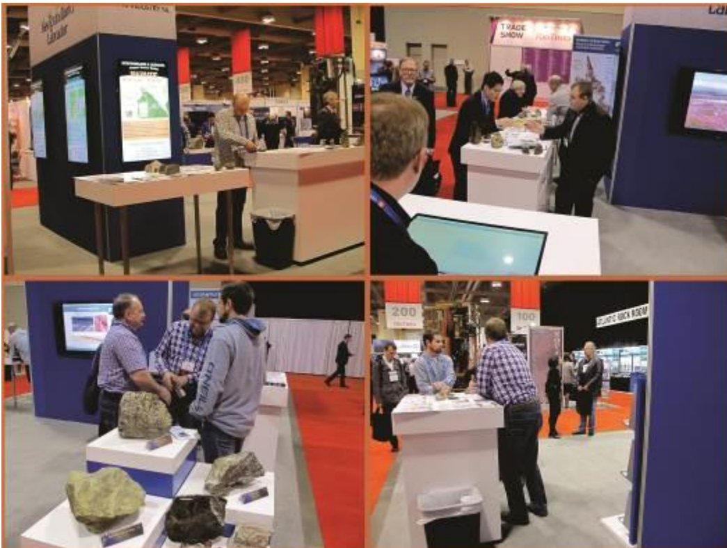
Prospectors promoting properties at the NL Booth, PDAC 2016