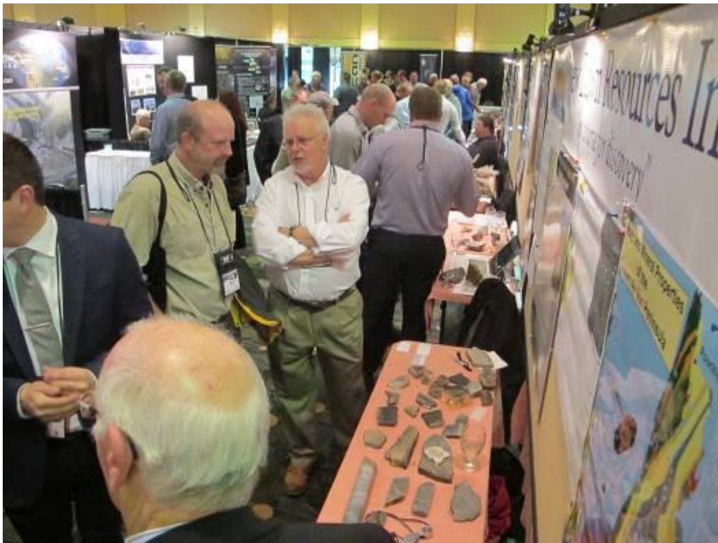
Prospectors promoting their properties: Mineral Resources Review 2016, St. John's

A public–private sector partnership working for the Newfoundland and Labrador prospecting community