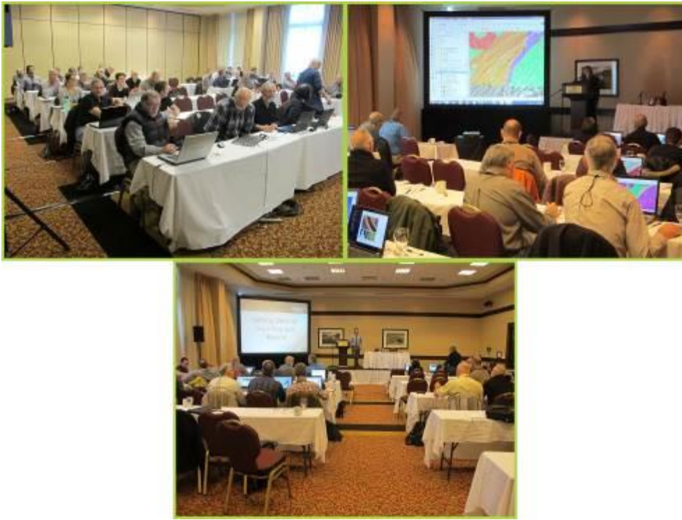
Full House at Prospectors Course, Mineral Resources Review, 2016