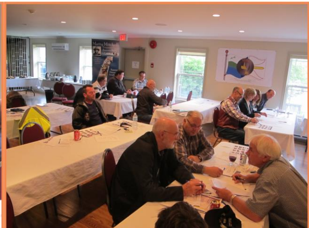
Issues being discussed by prospectors at the NLPA Annual General Meeting, St. John's, 2016