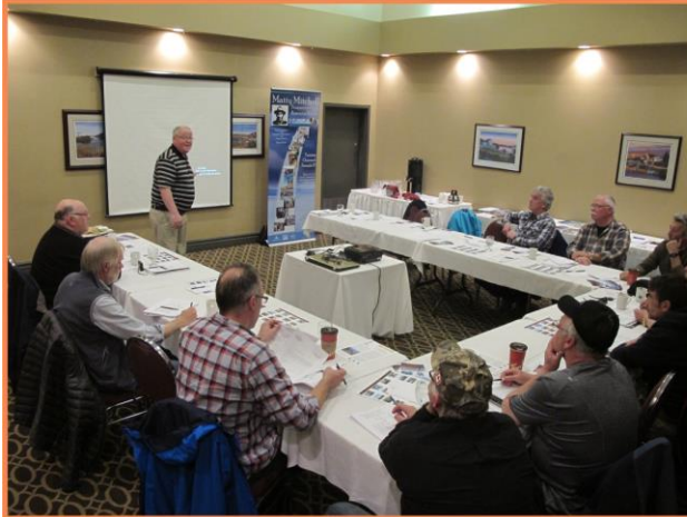
NLPA Meeting - April 2016 - Clarenville