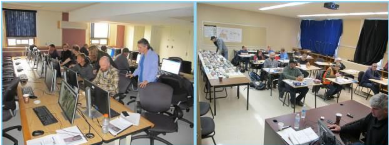
New Prospectors at Stephenville Prospecting Course, 2016

The MMR geologist participated for several days in the annual two-week long Prospectors Training Course held in Stephenville in September. Twelve prospectors attended the course and became eligible for “Designated Prospector Status”.