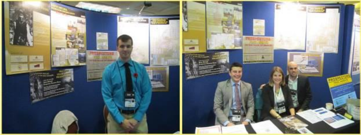
Student Members from MUN volunteering at the Matty Mitchell Booth, Mineral Resources Review, 2016