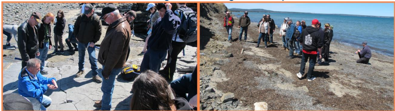
New Prospectors at Stephenville Prospecting Course, 2017

The MMR geologist participated for several days in the annual two-week long Prospectors Training Course held in Stephenville in June. A presentation was given on services provided by the Matty Mitchell Resource Room. Fourteen prospectors attended the course and became eligible for “Designated Prospector Status”.