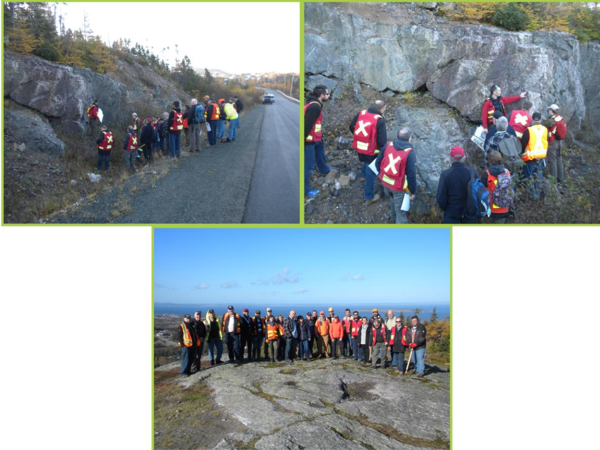
Perfect day for Prospectors Field Trip, Mineral Resources Review, 2017