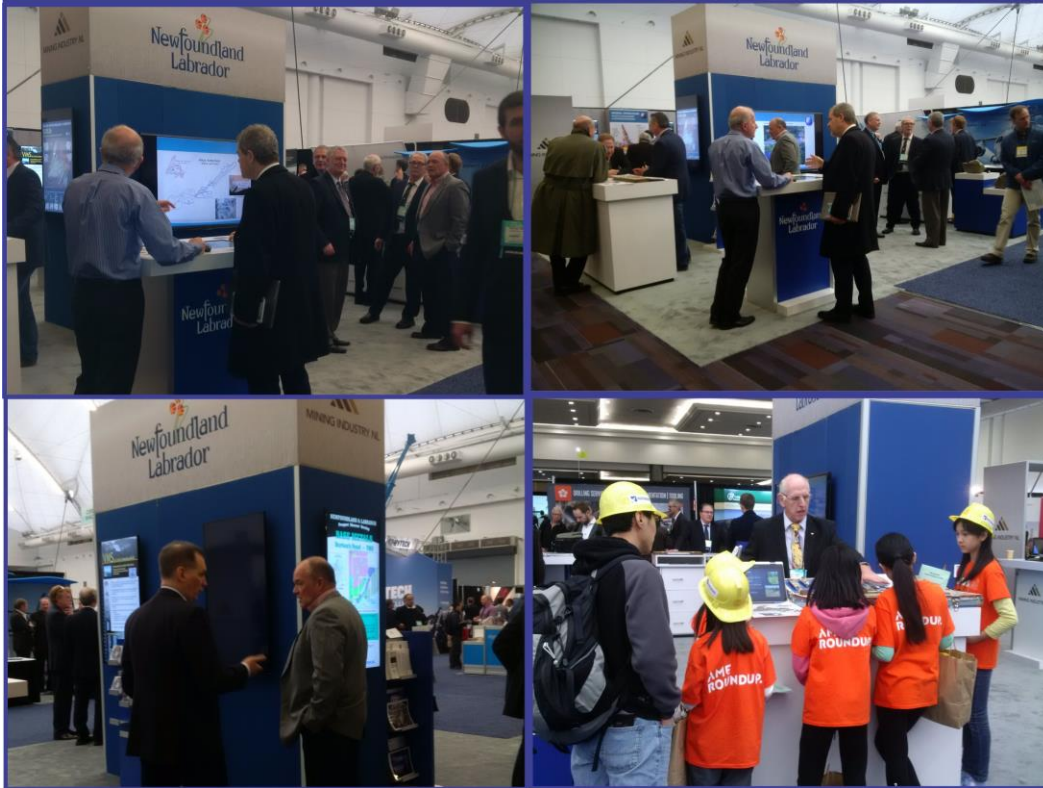
Prospectors promoting properties at the NL Booth, Roundup 2017