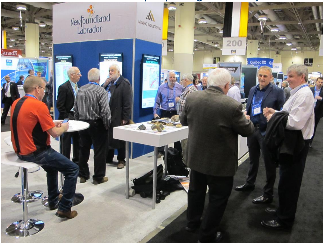
Prospectors promoting their properties: PDAC 2017, Toronto

A public–private sector partnership working for the Newfoundland and Labrador prospecting community