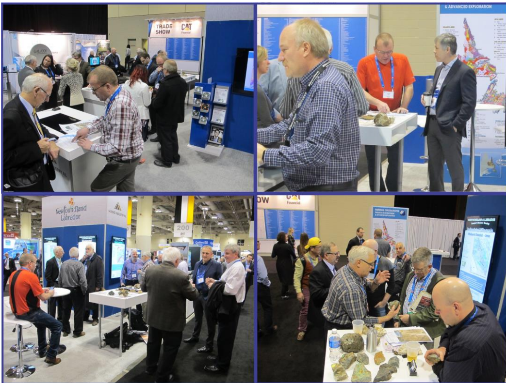
Prospectors promoting properties at the NL Booth, PDAC 2017