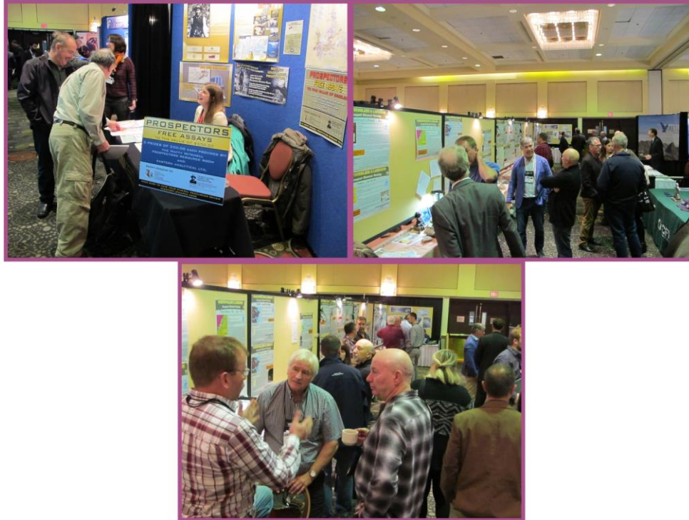
Prospectors promoting their properties: Mineral Resources Review, 2017