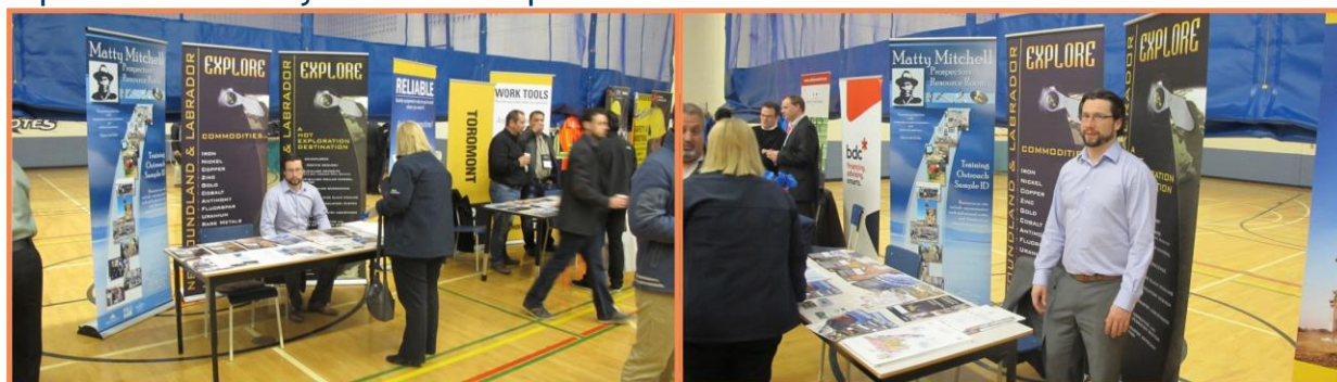
MMR Banner at Natural Resources booth, Baie Verte

The MMR geologist attended the 28 th Annual Baie Verte Mining Conference to represent the Matty Mitchell Prospectors Resource Room.