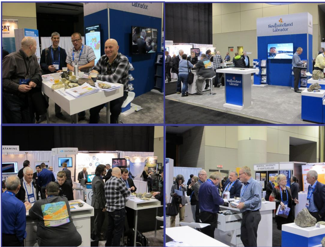
Prospectors promoting properties at the NL Booth, PDAC 2018