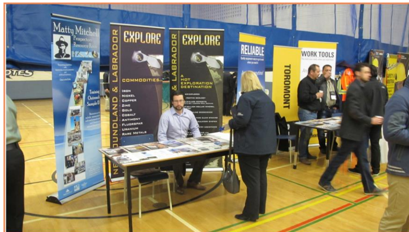
MMR Banner at Natural Resources booth, Baie Verte

The MMR geologist provided material for the Department Natural Resources booth at the 29 th Annual Baie Verte Mining Conference to represent the Matty Mitchell Prospectors Resource Room.