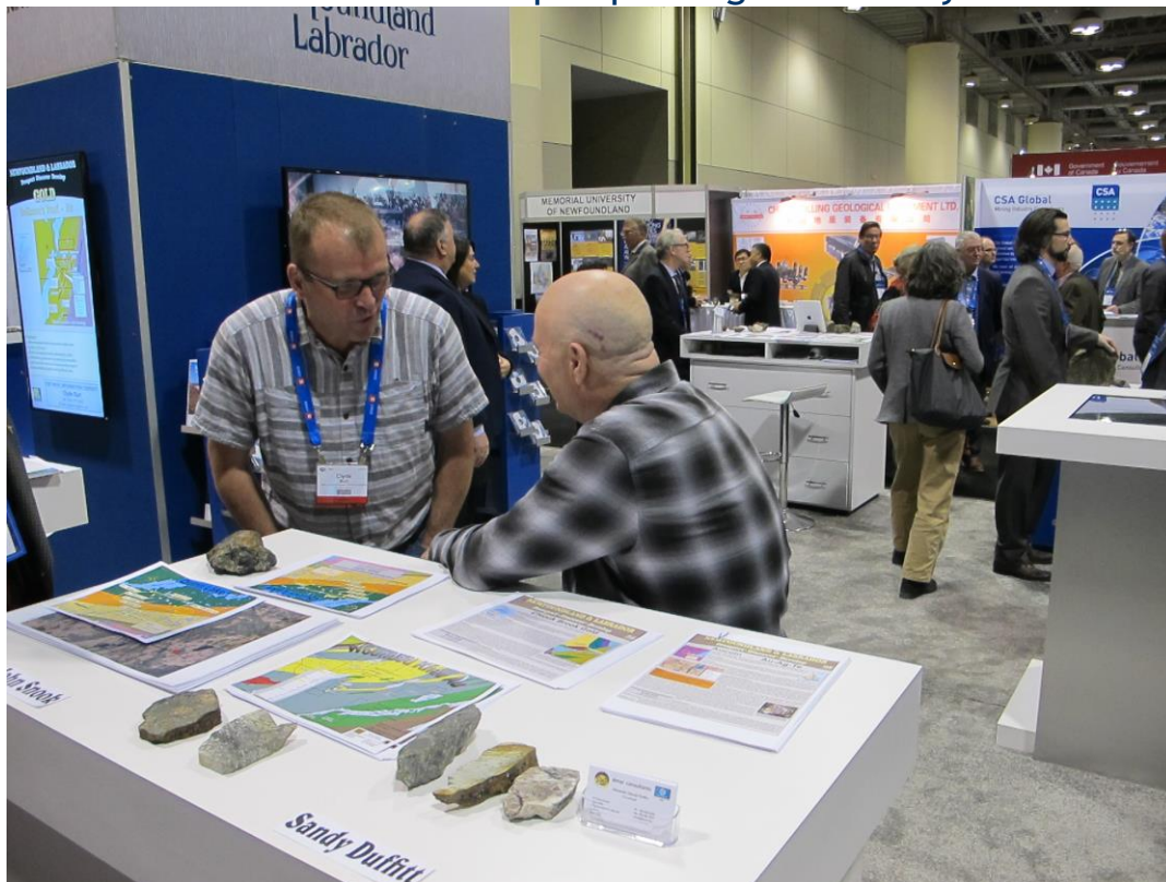
Prospectors promoting their properties: PDAC 2018, Toronto

A public–private sector partnership working for the Newfoundland and Labrador prospecting community