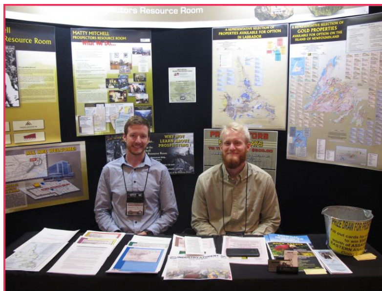
SEG Student Members from MUN volunteering at the Matty Mitchell Booth, Mineral Resources Review, 2018

Volunteers from the MUN branch of the SEG kindly provided on-site support to the Matty Mitchell Booth, at the 2018 Mineral Resources Review, and were available to assist prospectors in the promotional displays. This collaboration is to our mutual benefit, and to that of the prospectors we support.