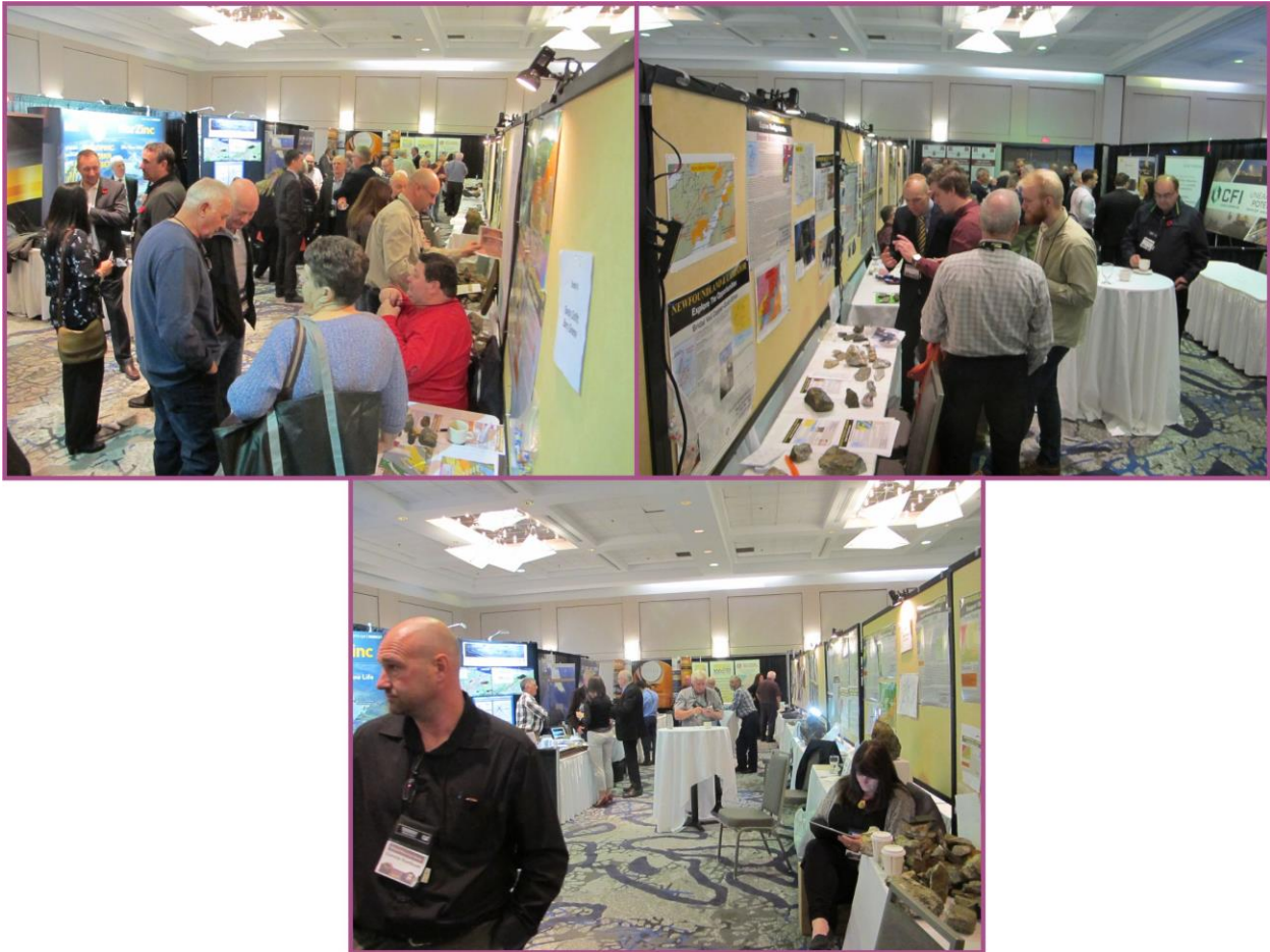
Prospectors promoting their properties: Mineral Resources Review, 2018

Mineral Resources Review is Eastern Canada's largest mineral industry conference and trade show, attended by about 750 delegates (in 2018), trade show exhibitors and visitors. The event showcases all aspects of the mineral exploration and mining industry in Newfoundland and Labrador. More than 20 prospectors from the province had booth space at the trade show; the MMR geologist prepared posters and had rock samples cut and polished for these prospectors to promote their properties.