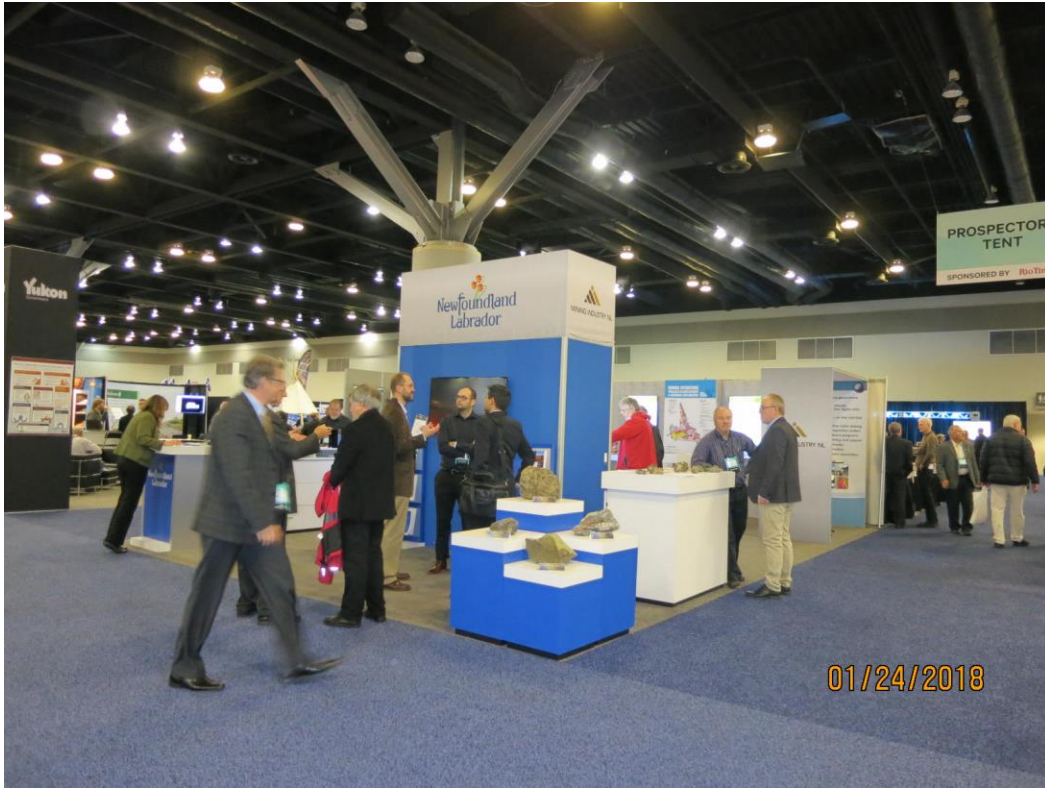
Prospectors promoting properties at the NL Booth, Roundup 2018