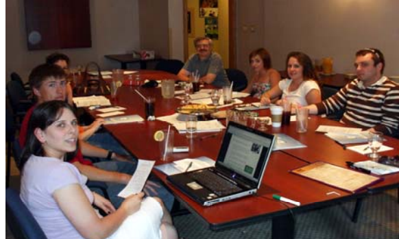
A committee meeting on the west coast of the province

"I am quite honoured to become a member of the Youth Advisory Committee. Being from rural Newfoundland, I understand the barriers that we face living in such a remote area. To become a voice for youth in this region is something that I am extremely proud of and something that I wish to pursue for a long time."