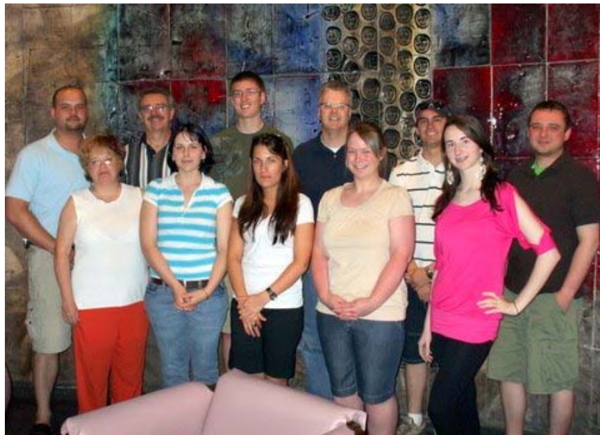
YAC members and mentors

The YAC, through meetings, consultations, research and public and peer presentations, is fulfilling its mandate and is respected as a voice for the youth of Newfoundland and Labrador.