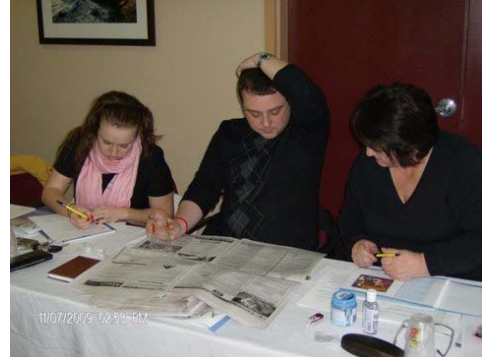
The committee discussed youth-related issues

"Being part of the YAC is both eye opening and rewarding. By listening to the experiences of youth from all over the province, I can see the issues from different angles, which is an amazing experience."