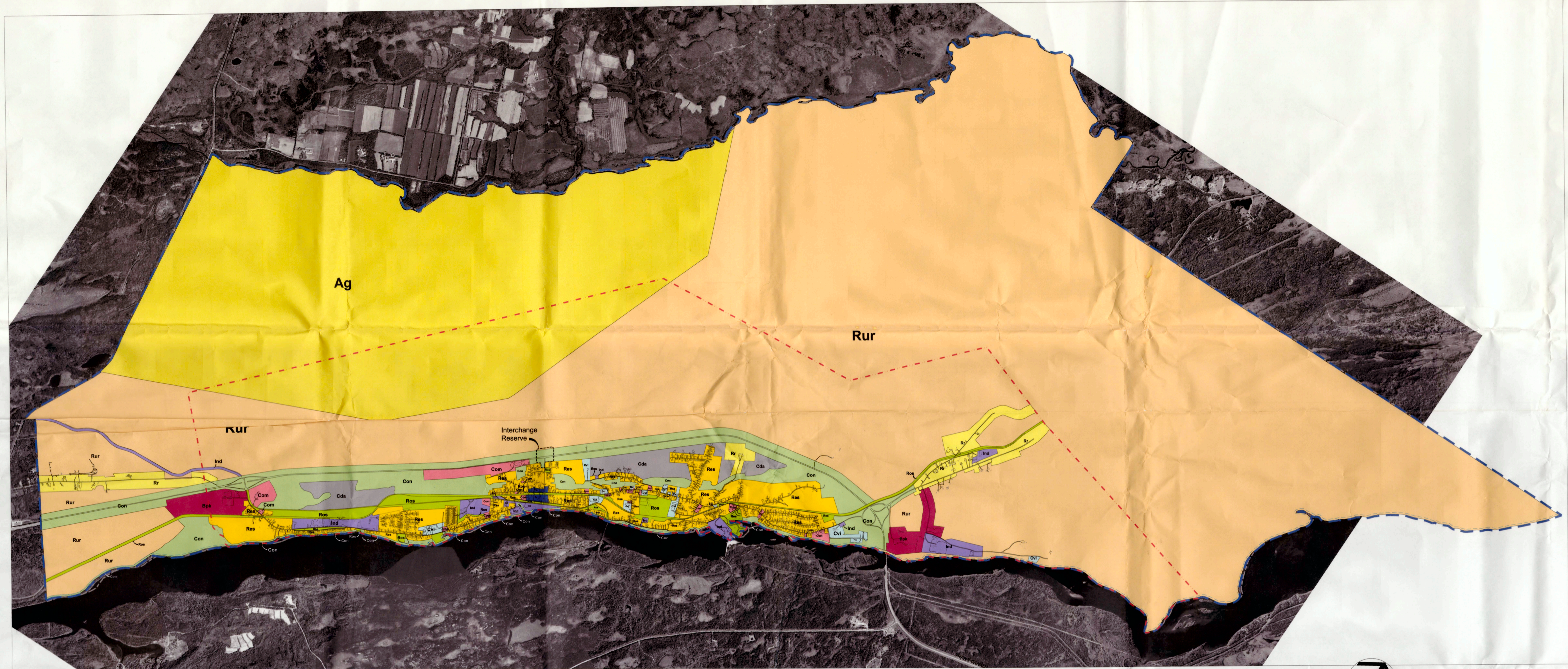
WITHIN MUNICIPAL PLANNING AREA BOUNDARY