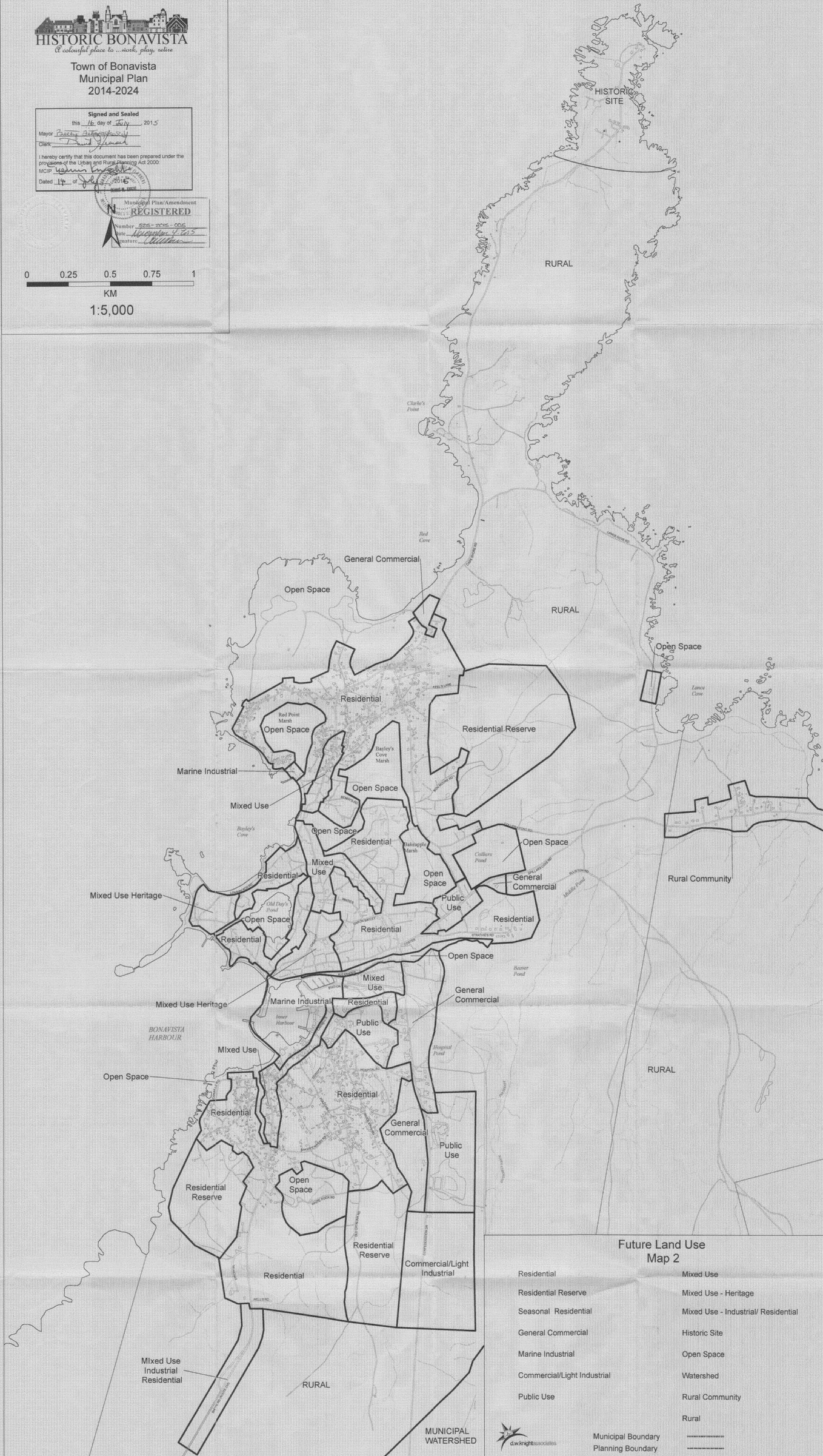
Future Land Use Map 2