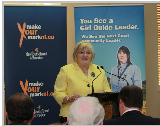
Minister Whalen speaking at Make Your Mark Campaign event

The Department supported the September 2009 municipal elections through the “MakeYourMarkNL” campaign. Launched in June 2009, this multi-faceted campaign highlighted the key role of municipal councils in providing essential services critical to the everyday lives of residents of their communities. Utilizing an innovative multimedia approach, including social networking, the campaign encouraged people to run for municipal council and to vote for candidates.