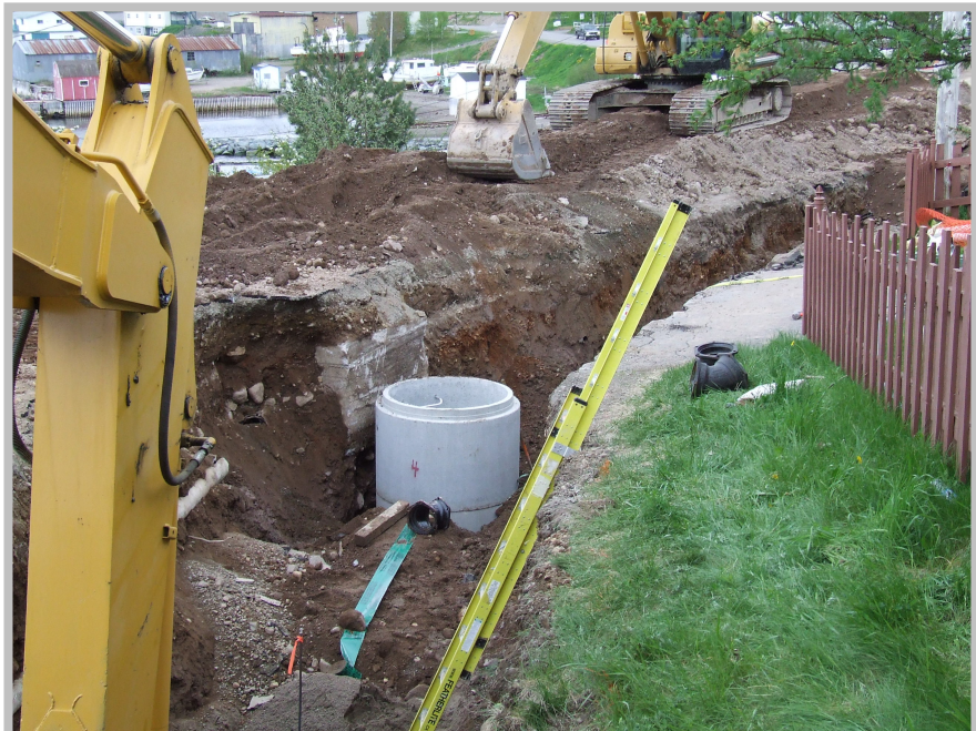
Bayview Drive, Springdale

The Department's Gas Tax Secretariat provides ongoing implementation support for municipalities, and ensures that funded projects meet all federal and provincial reporting requirements.