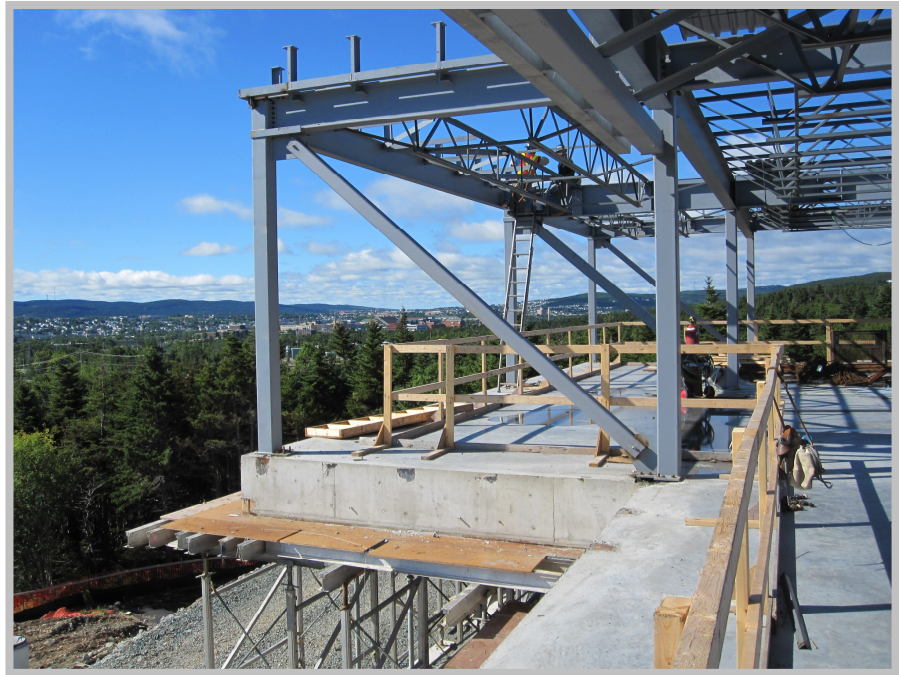
YMCA-YWCA – Ridge Road, St. John's

completed by March 31, 2012. The Department's support for development of regional land use plans contributed to Municipal Affairs' strategic direction of Strengthened Municipal Capacity .