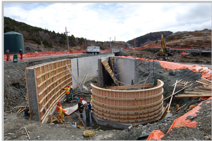
Weir, Quidi Vidi

Municipal Affairs' infrastructure investments contributed to the Department's strategic direction of Increased Regional Sustainability .