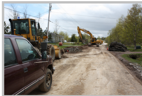
Point of Bay Waterline

Municipalities throughout Newfoundland and Labrador are facing a variety of infrastructure demands ranging from the need to upgrade existing infrastructure to installing new infrastructure, including water distribution and sewage collection systems, water and sewage treatment plants, and recreation facilities. In 2008-09, the Department changed its method of funding municipal infrastructure programs from an annual commitment to a three-year funding strategy. This enabled municipalities to plan and implement major projects much more efficiently. 2009-10 was the second year of the strategy, which will total $358.74M over three years. Together with federal and municipal investment, the three year investment in municipal infrastructure will be approximately $404M, including federal funding of approximately $68M.