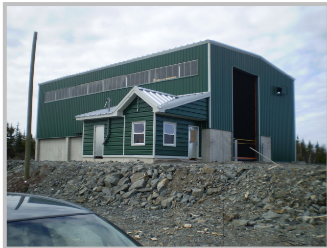
Waste management transfer station – Central region

In the Central region, construction is ongoing at the regional full-service site located near Norris Arm North. Construction activity is also ongoing at seven transfer stations strategically located throughout the region, and interim consolidations of landfill sites are underway.