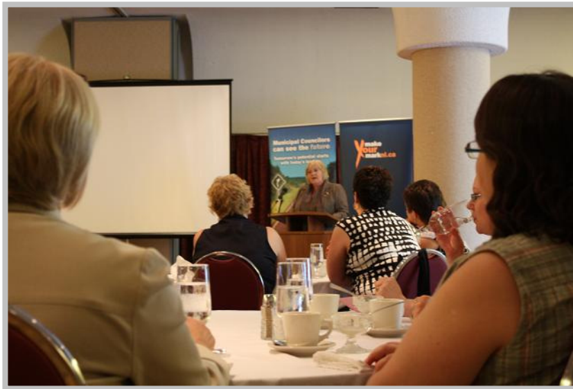
Women's Lunch and Learn – Corner Brook

One of the goals of the MakeYourMarkNL campaign was to increase the number of female candidates for council. The Department held three lunch and learn events specifically designed for women. In cooperation with the local status of women councils, Minister Whalen hosted sessions in St. John's and Corner Brook. In addition, the Honourable Charlene Johnson, Minister of Environment and Conservation, hosted a session in Carbonear. The focused efforts to encourage and support female candidates met with noted success: in comparison to the 2005 elections, there was a 9 percent increase in female candidates, and a 20 percent increase in elected female candidates.