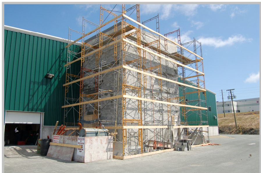
Paradise Community Center