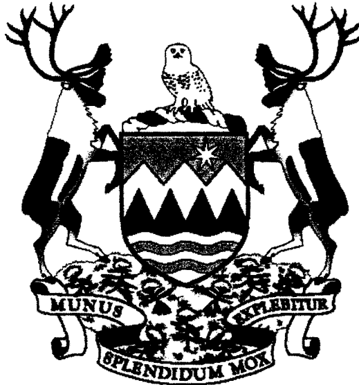
The Labrador Coat of Arms