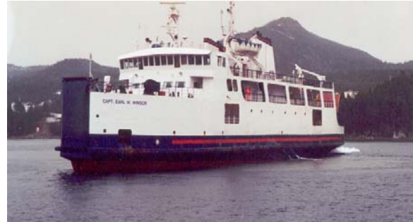
MV Captain Earl Winsor

to provide sufficient capacity during the summer months.