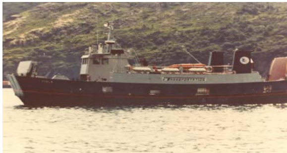
MV Island Joiner

jurisdictions. This applies to both the Bell Island commuter service and also to the community services to both the large and smaller islands around the coast. The BMT report further indicates that, overall utilization levels are quite low and in some cases indicate that service frequencies could be reduced. Reducing the frequency of the service would assist in reducing crew workload and allow more time for planned maintenance activities. Although levels of ferry utilization have not declined as rapidly as have the population in these communities, ferry utilization can be expected to fall if current population trends continue. This was taken into consideration by BMT in identifying their recommended capacities for replacement ferries.