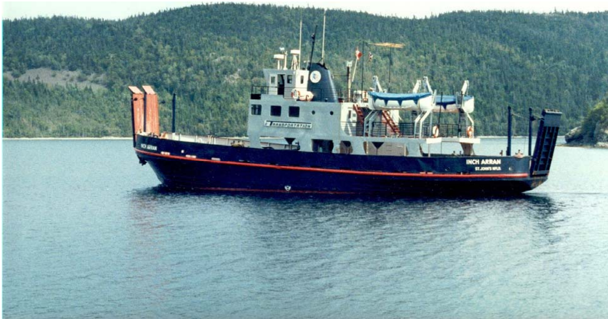
MV Inch Arran

need to have a reliable replacement vessel for when the Gallipoli is taken off the run for its annual refits. The ferry service is the only transportation to and from the island. Thus, with regards to health and safety issues as well as quality of life, there needs to be a consistent and dependable ferry service to and from Ramea. As previously stated, the BMT report does suggest a solution to deal with this issue by recommending the construction of a new swing vessel.